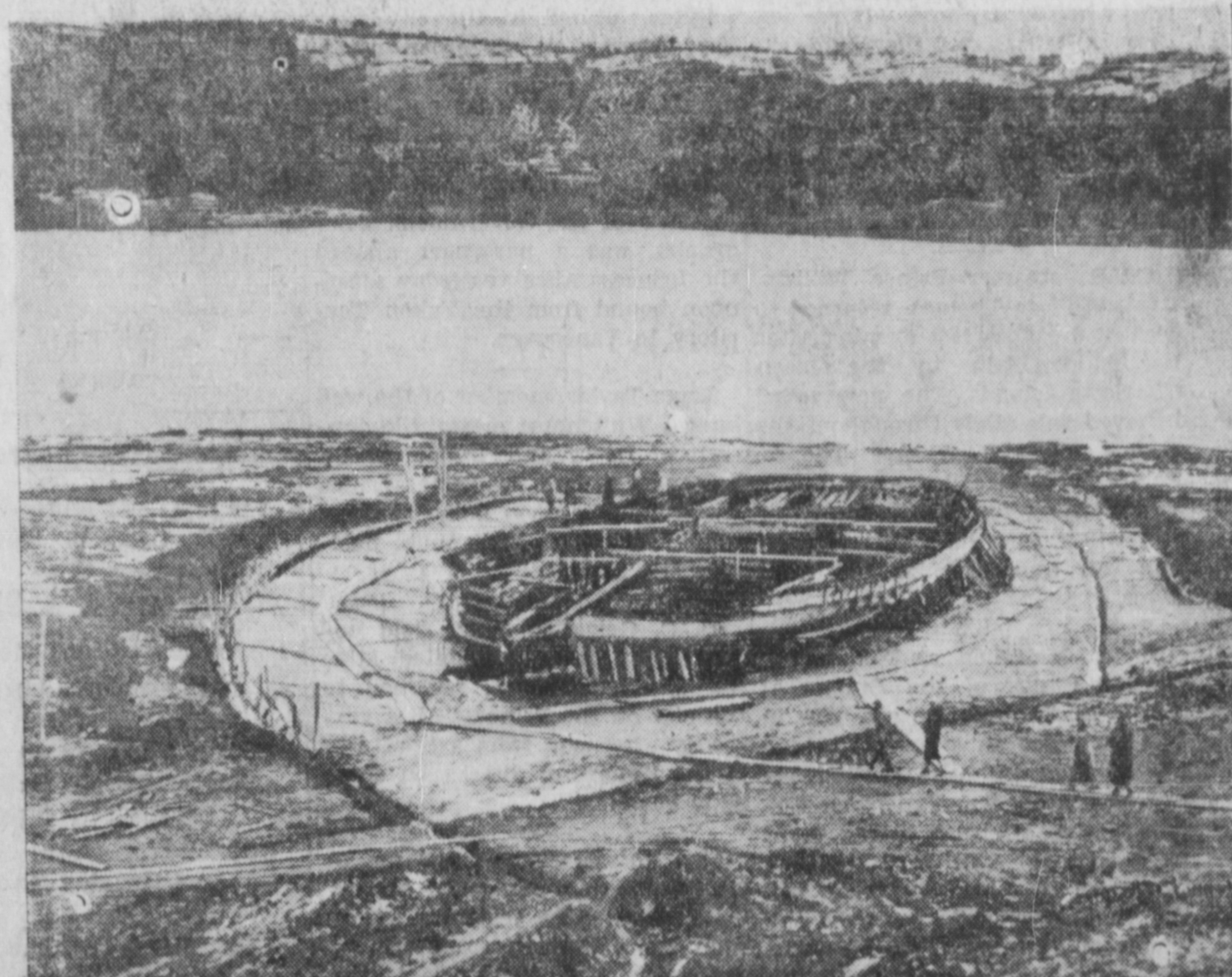
General view of Lake Nemi, in Italy, drained away to show famous galley of Emperor Caligula. It is thought that in time whole bottom of lake may become arable.