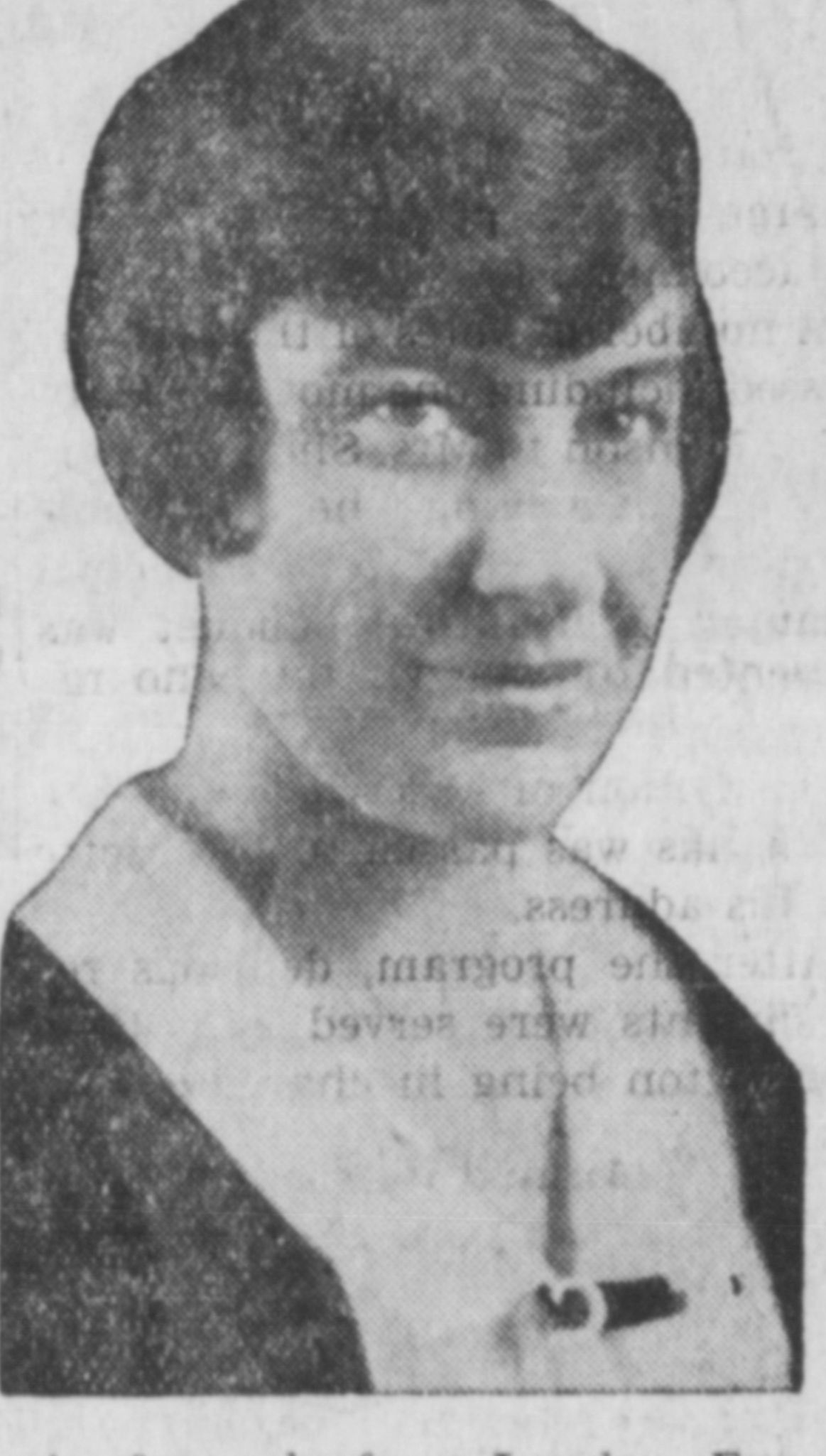
Lady, formerly from London, England will demonstrate here

how to make the best use of her new servants.