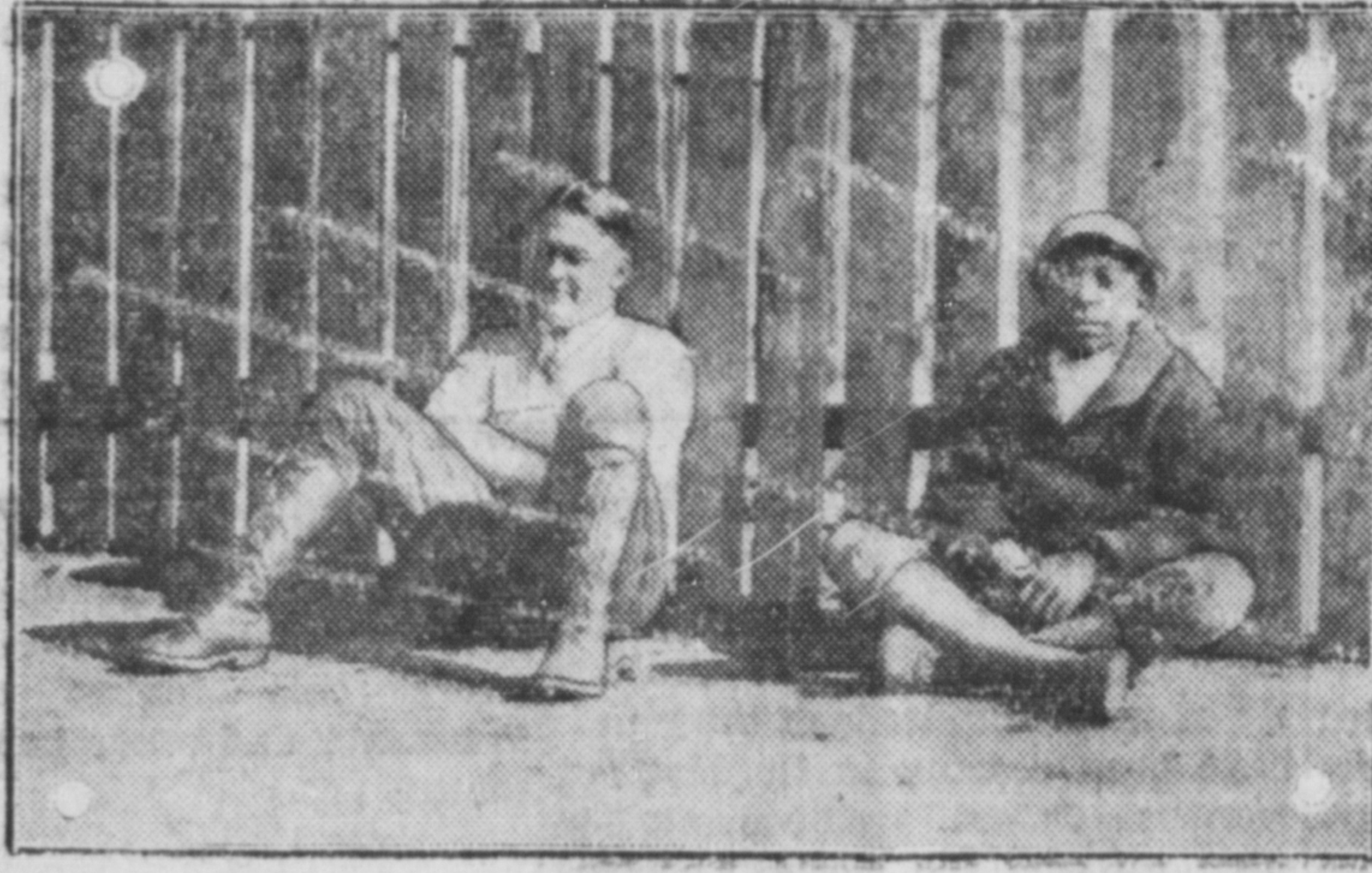
Photo shows a little colored lad of the sunny south, day dreaming with Bobby Jones, "the king of the links," in an unusual pose of the great golfer taken at Augusta, Georgia.

February 9— Eagles vs. Grotto. Seal Cove Sawmill vs. Kts. of Columbus. I.O.O.F. vs. Hawks. Moose vs. Toe H. Operators vs. Elevator. Six Musketeers vs. P. R. Hotel.