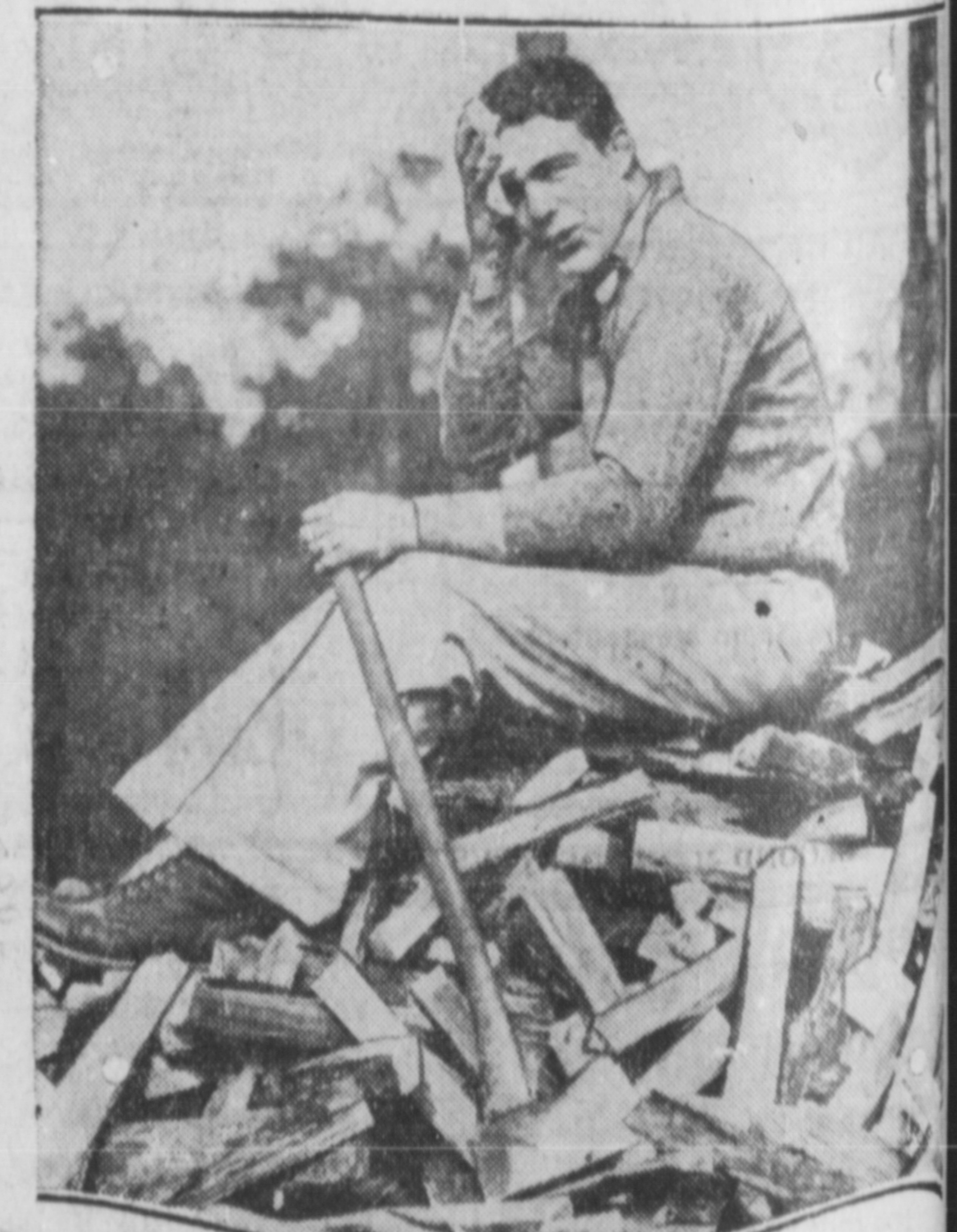
Like Mr. Hohenzollern of Doorn, Young (heavyweight) Stribling has passion for woodchopping—especially when preparing to make a serious assault upon world heavyweight championship.