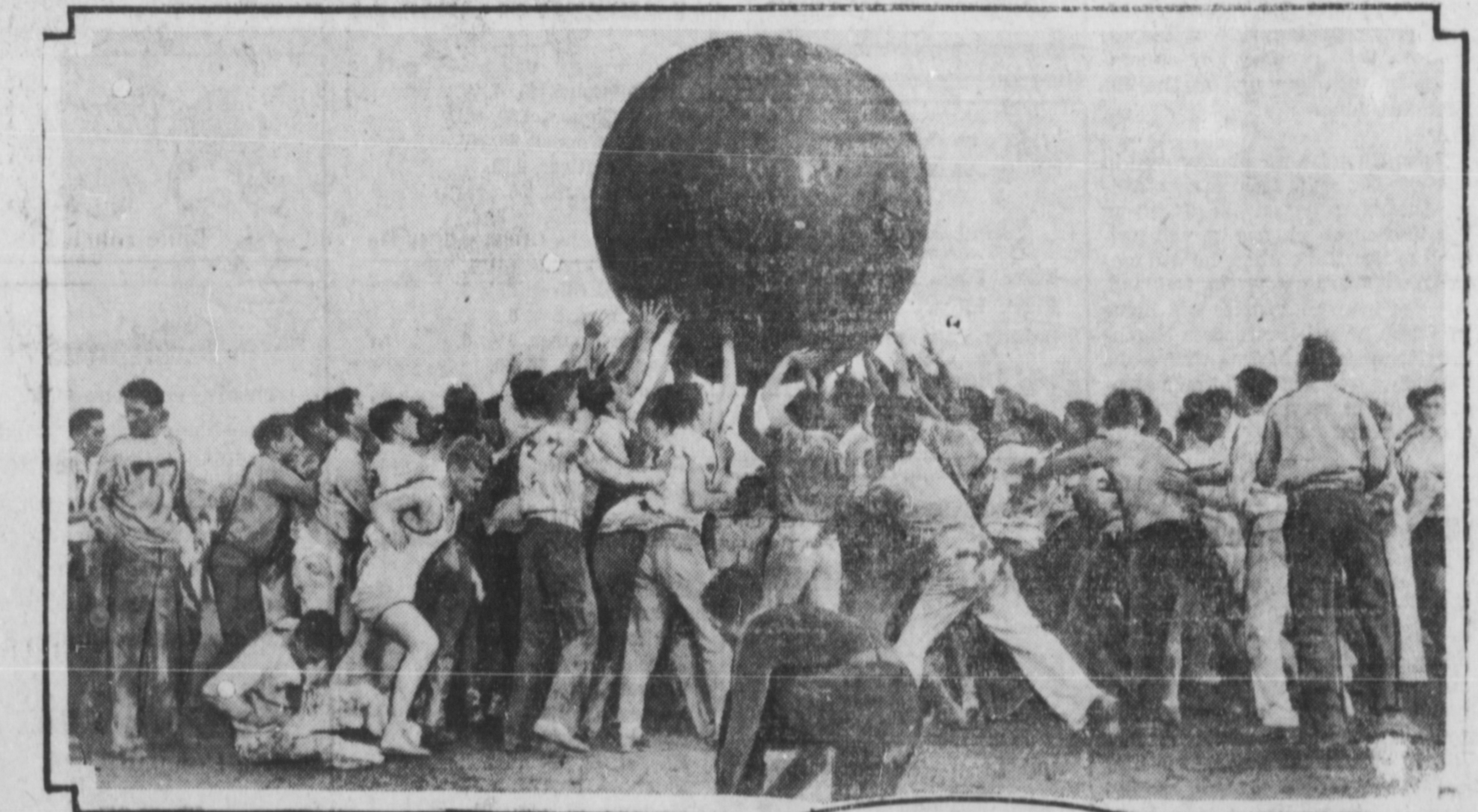
Tense moment in annual push-ball battle between freshmen and sophomores of University of California at Los Angeles. Sophs won.

When the roof of the technical school collapsed, a number of students and teachers were killed. Jellicoe ward of the Napier Hospital and nurses' home were wrecked and number of nurses who had come off night duty being rescued. The nurses showed great heroism rescuing patients from the burning building.