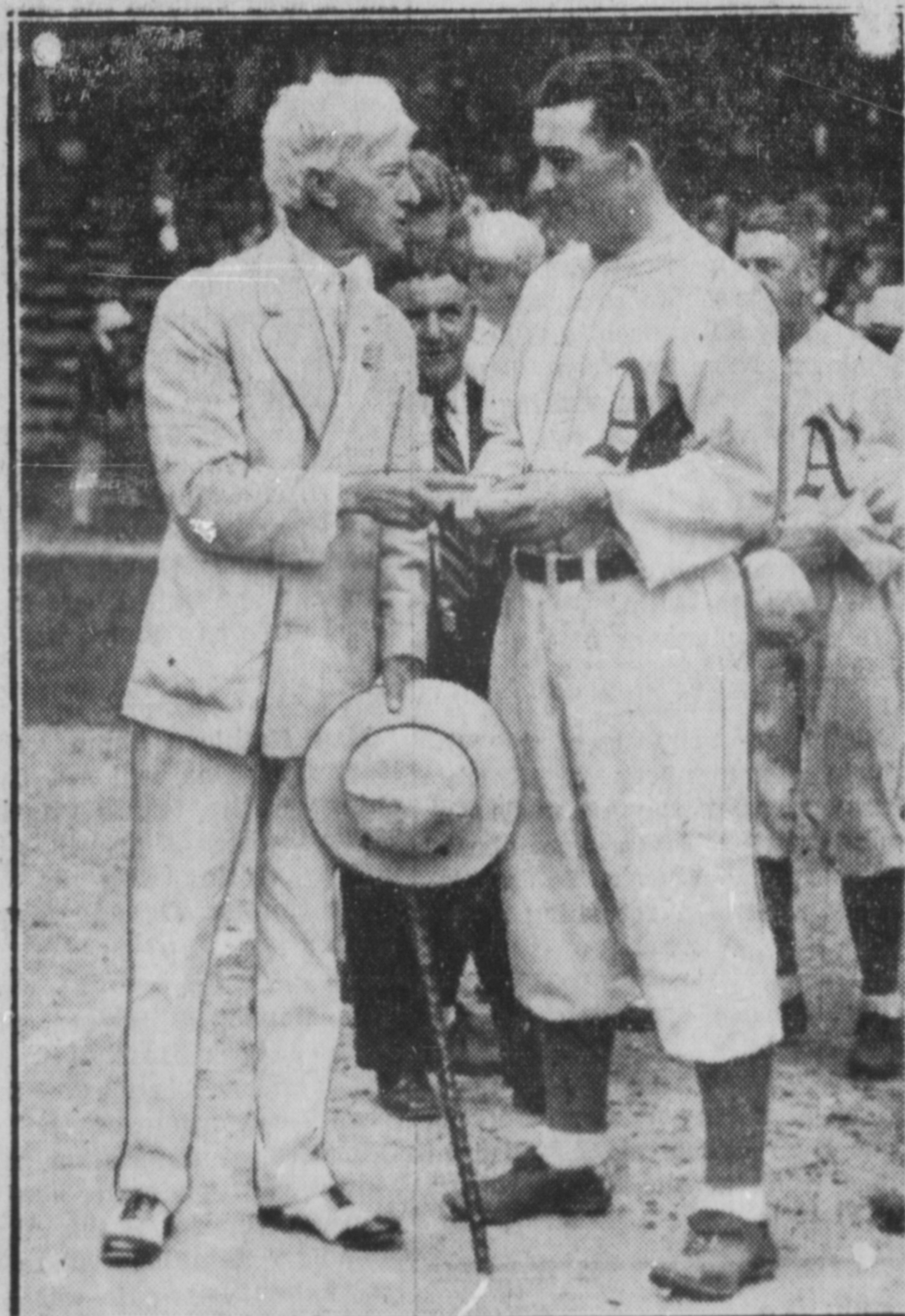
Judge Kenesaw M. Landis, commissioner of baseball (left), presenting gold watch to Al Simmons during the ceremony of raising club's second consecutive world baseball championship flag at Shibe Park, Philadelphia, Pa.