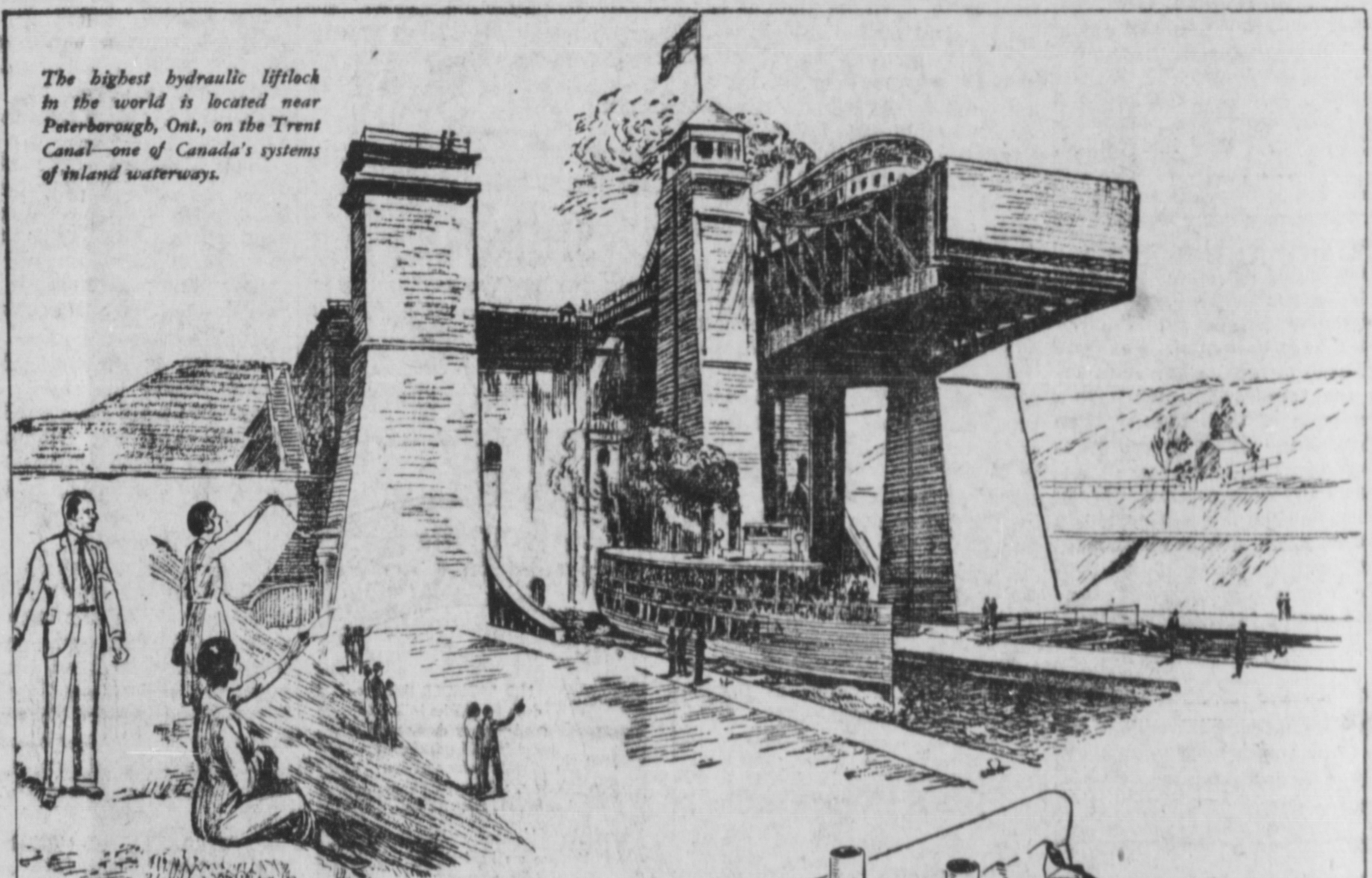
The highest hydraulic liftlock in the world is located near Peterborough, Ont., on the Trent Canal—one of Canada's systems of inland waterways.

The naval program provides for the laying down by Italian firms of