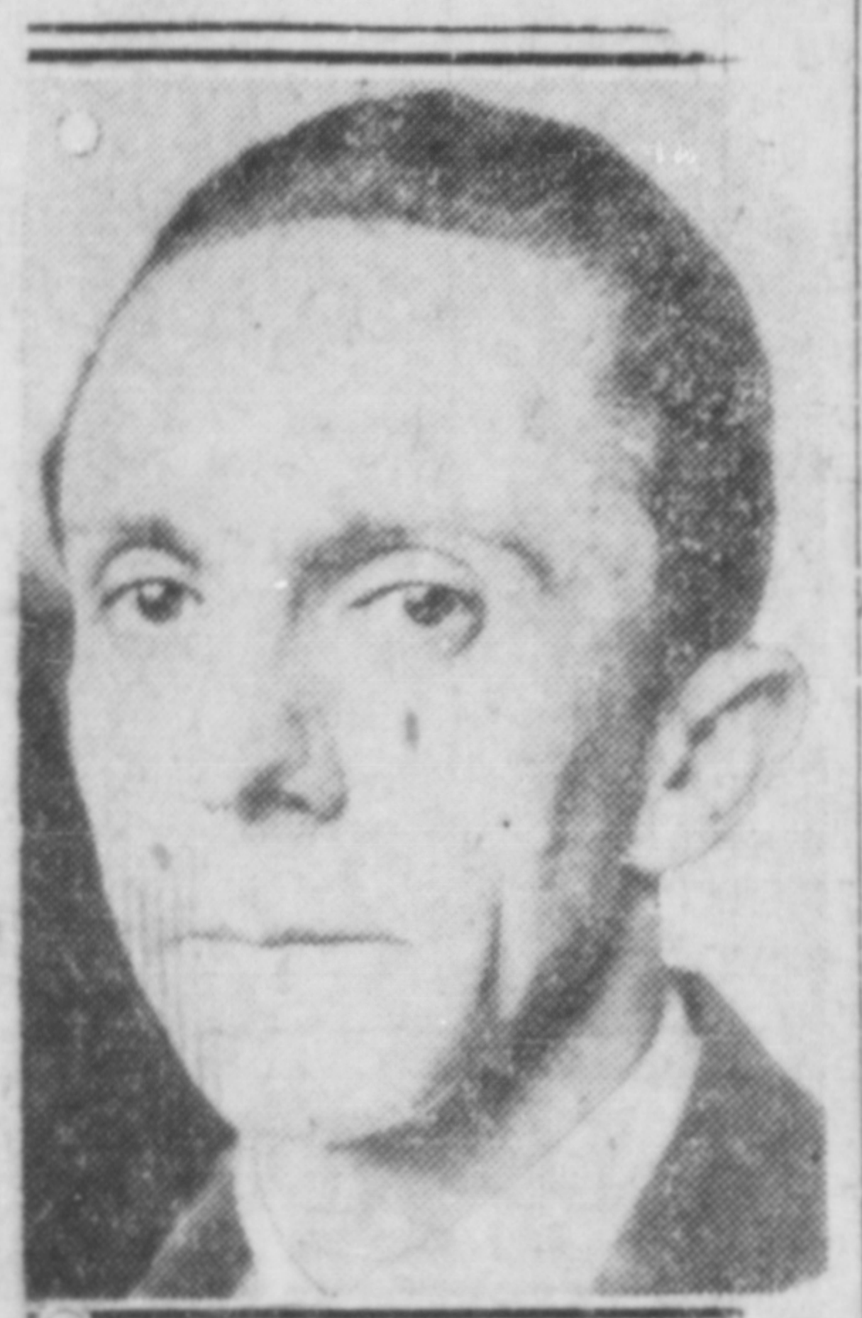
Dr. Goebels, member of Reichstag, leader of National Socialist faction and political "ambassador plenipotentiary" of Hitler