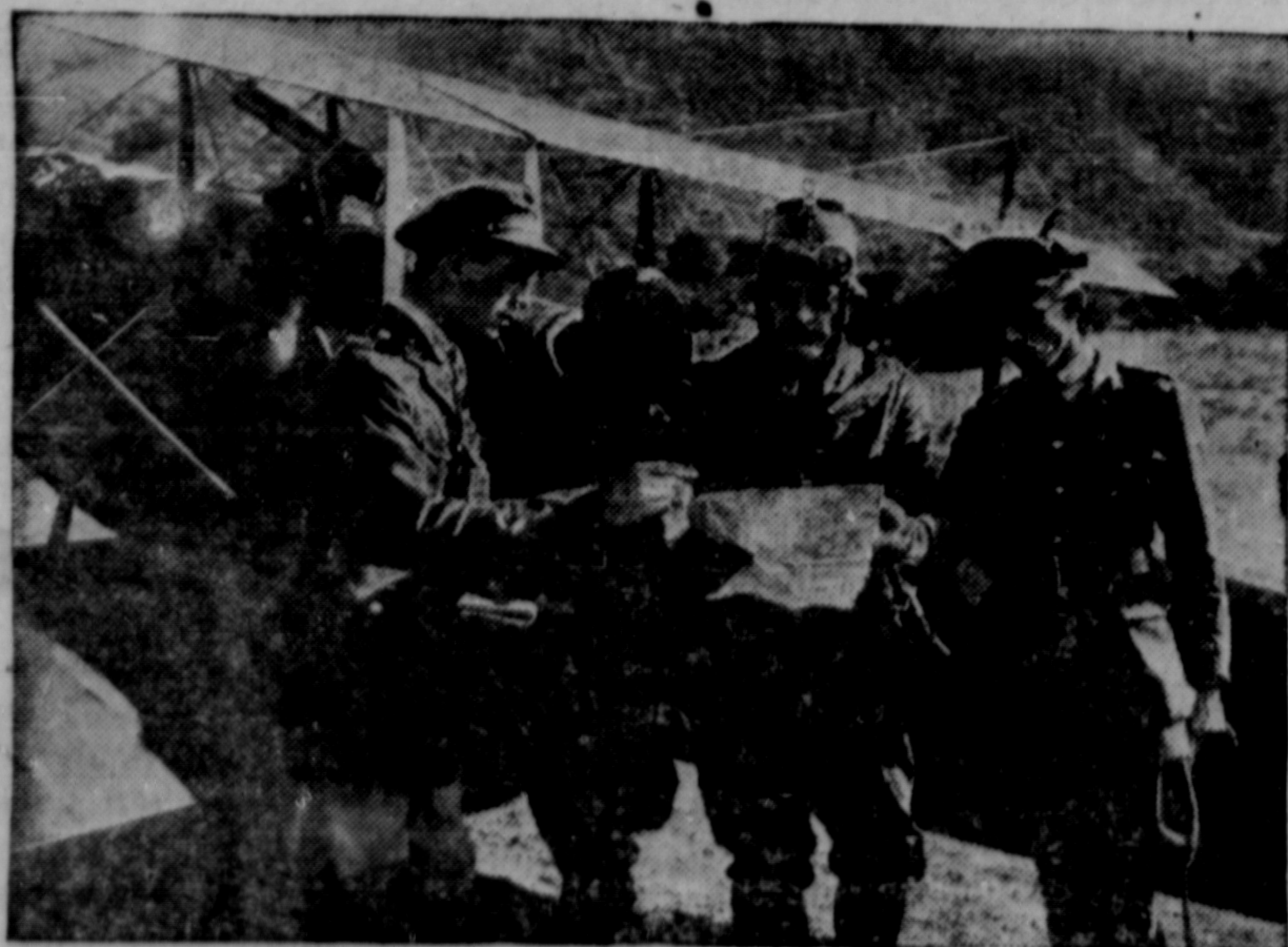
Scene from "Heart of Humanity" at the Westholme theatre tonight and tomorrow.

An article in the Wall Street Journal comments on the depreciated currency of Europe and the hopelessness of trying to bring it to a par with that of the United States where gold still can be exchanged for notes. It states that if we continue to increase the cost of production matters will only get worse. The salvation of the situation is to produce more and spend less.