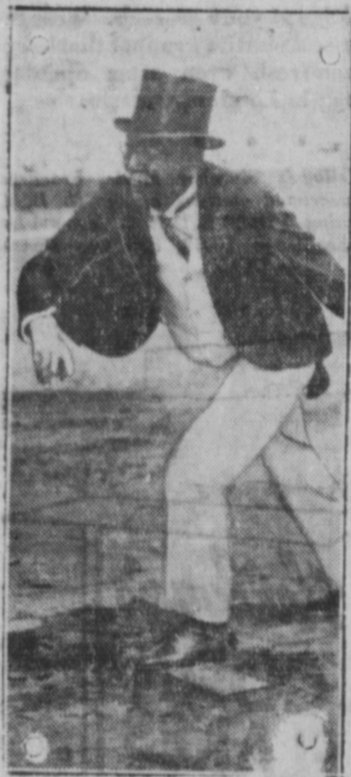
Mayor of Tokyo officiates at baseball game at the Meiji Shrine grounds.