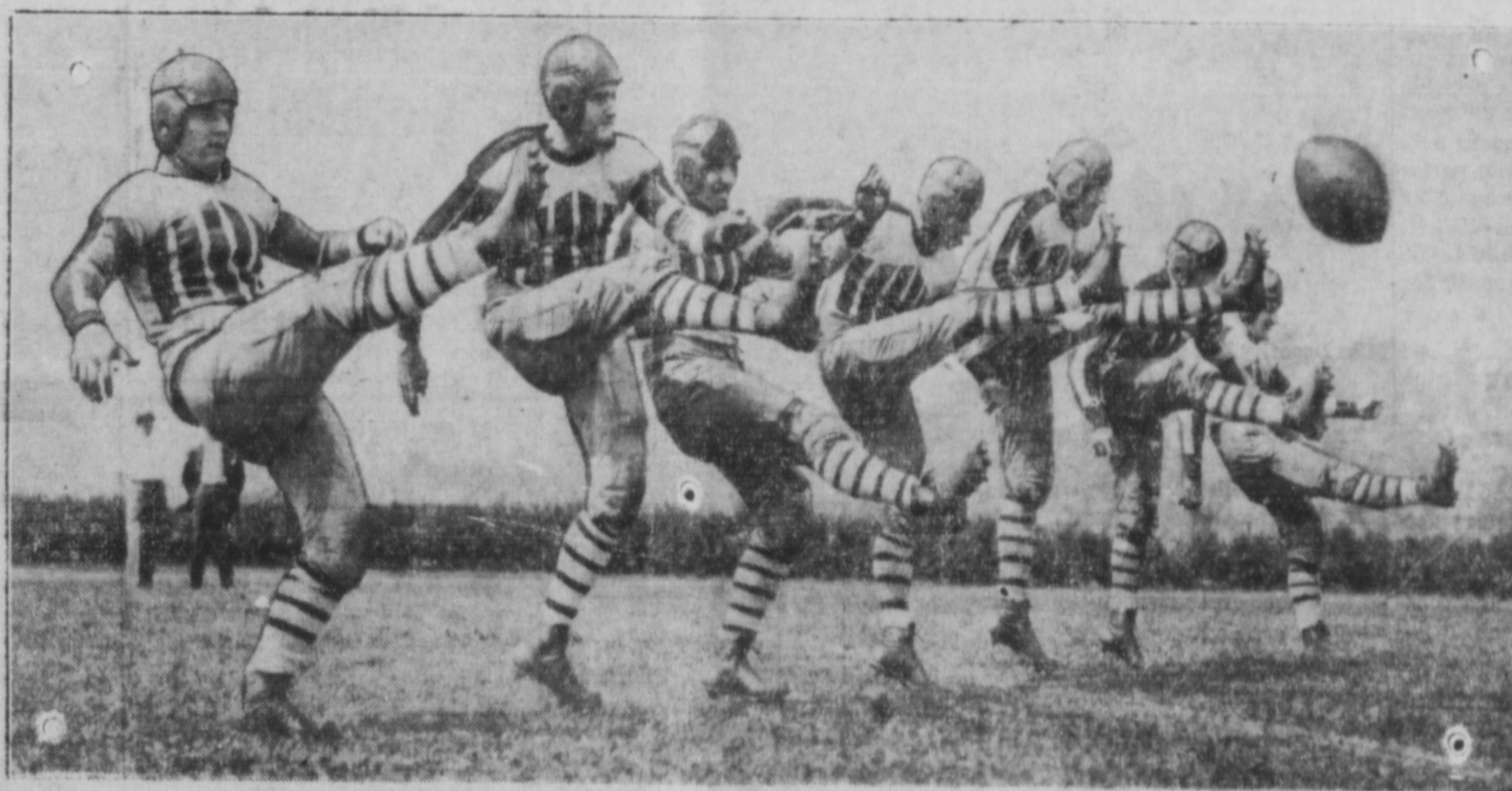
Gridiron warriors continue to practice even after two weeks of play ing, showing a little of the desired action.