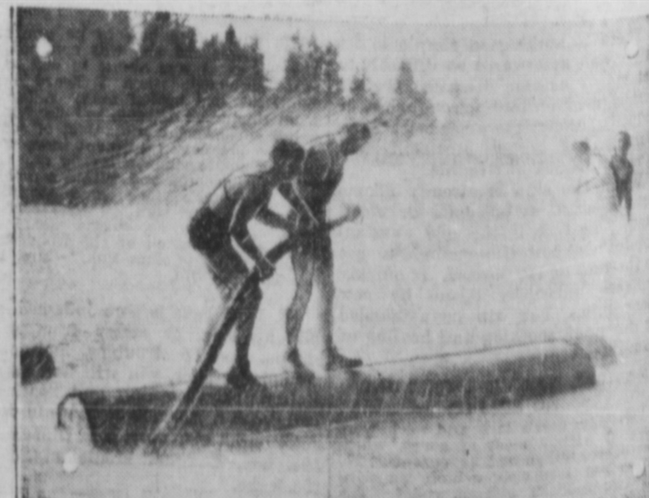
Right: Firemen of Aberdeen, Wash., have a day off so they spend it in quite an unusual manner by climbing on logs and turning hoses on each other in the middle of the lake. The streams are ninety pounds pressure.