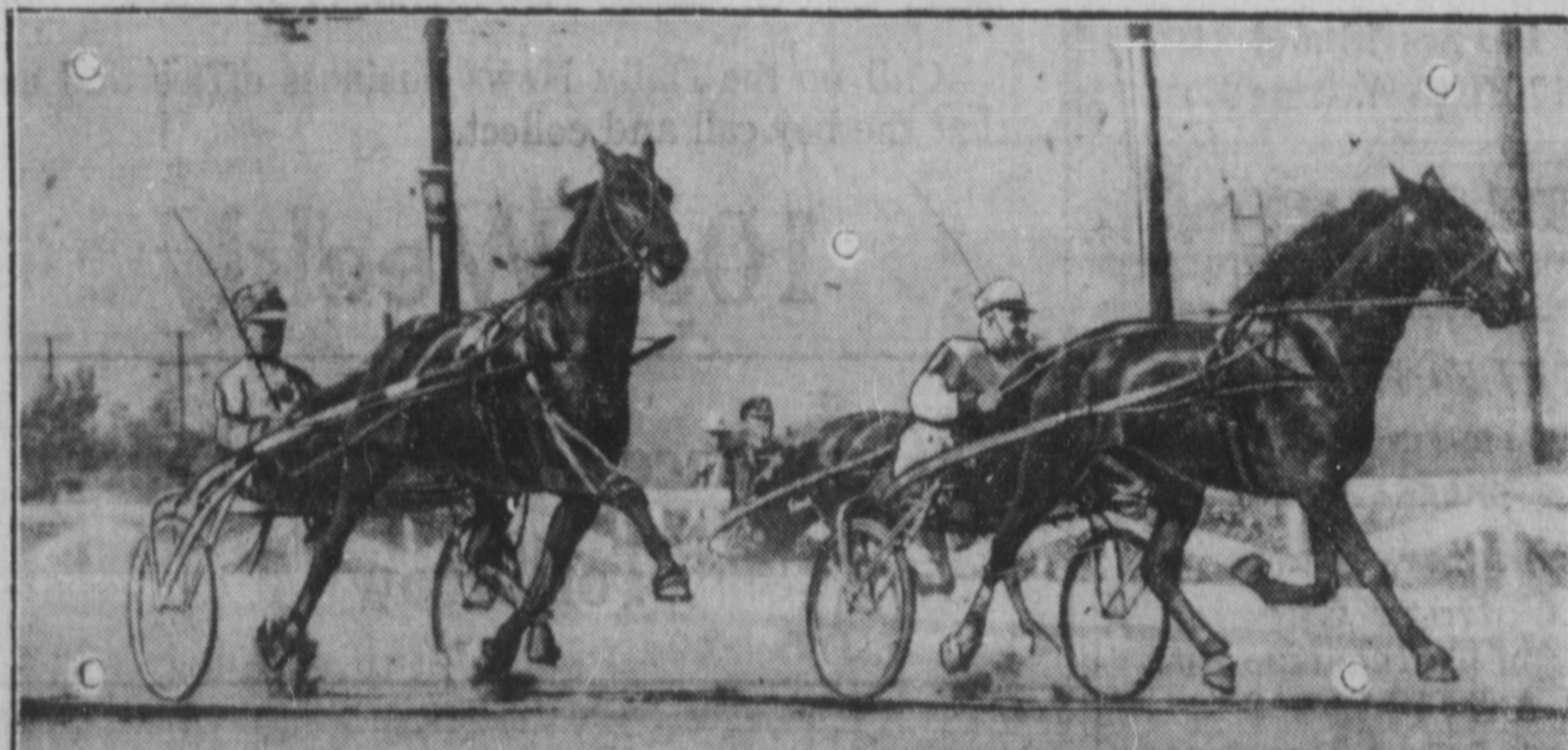
Why come down to earth? Spirit of aviation evidently affects horses as in this trotting race during country fair at Pomona, Calif. Loganberry is seen leading Juanito.

This advertisement is not published or displayed by the Liquor Control Board or by the Government of British Columbia