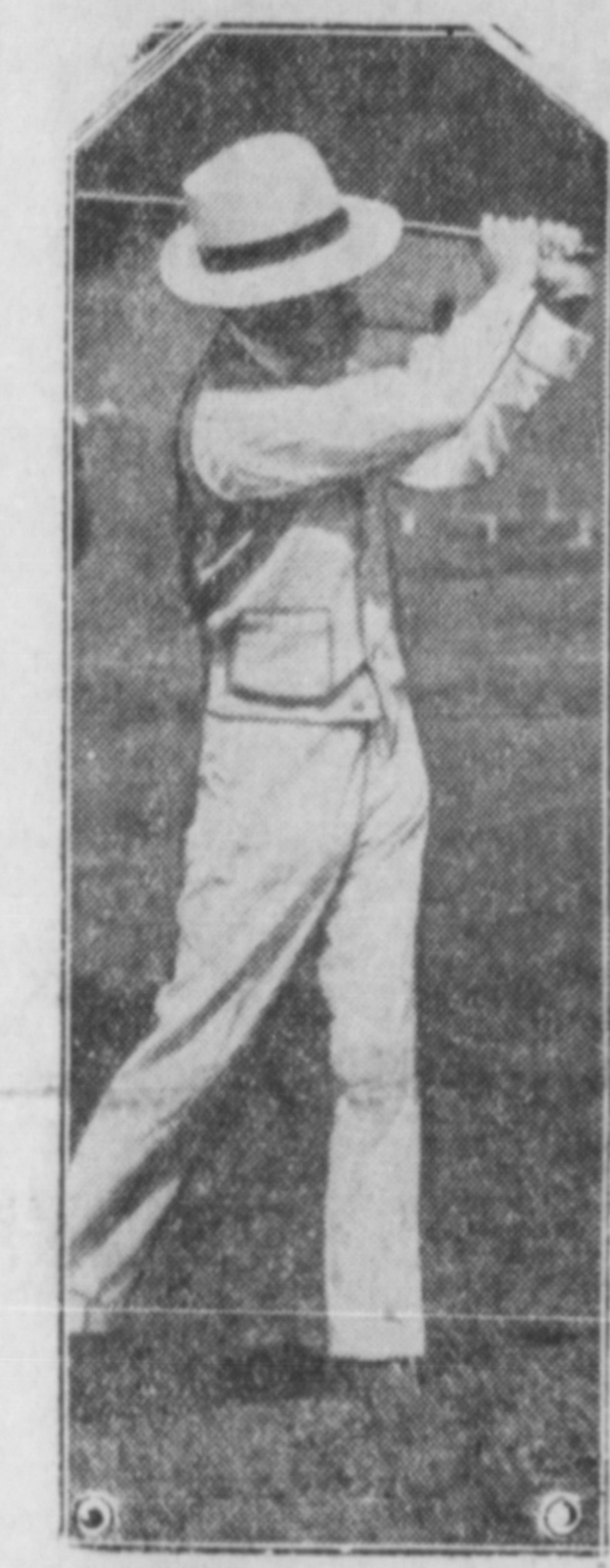
Zowie! There goes a good one as King Prajadhipok of Siam, world's most absolute ruler, swings his club at Murray Bay, Quebec, during his recent visit.

Premier Also First Lord of Treasury—Stanley Baldwin President of Council—Snowden Again Chancellor of Exchequer