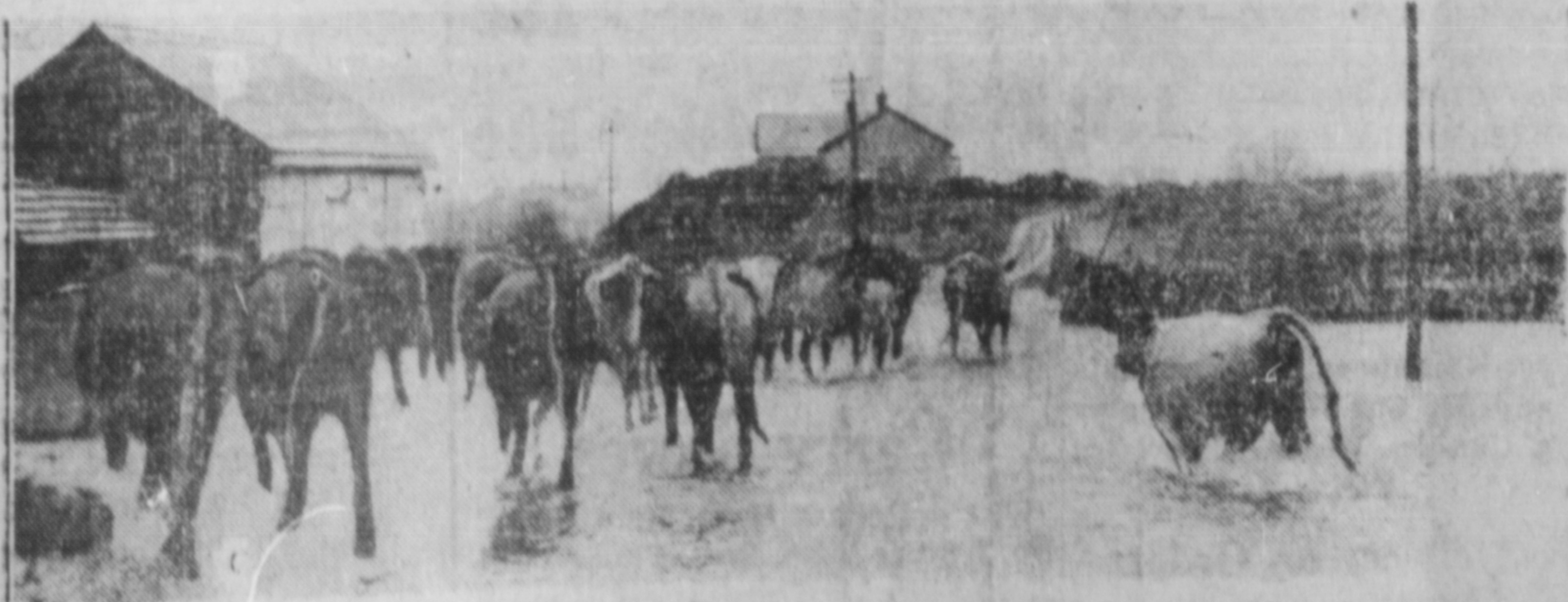
Bungalows were swept away, houses flooded and streets made impassable by a fierce channel gale along the southern English coast. Here are cattle wading through flooded pastures at Winchelsea