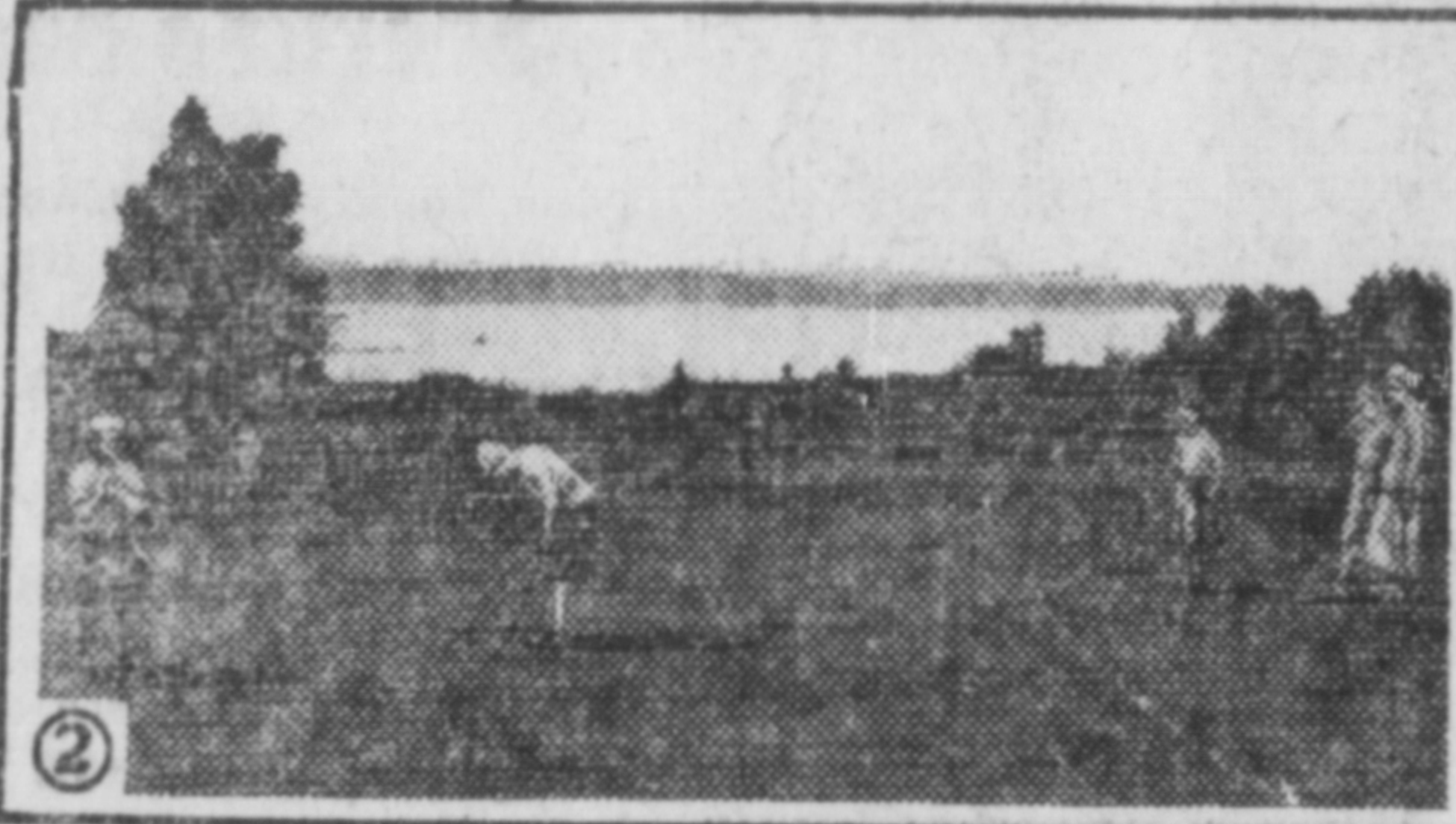
and their visitors. From coast to coast, excellent courses are available and where the company does not operate its own links, playing privileges at first-class clubs are granted. In the Maritimes, there are courses at St. Andrews-by-the-Sea, N. B.; Kentville, N. S.; Digby, N. S.; and Yarmouth, N. S. all in connection with the company's hotels. Quebec City has two fine courses, one dating back to 1874. Montreal has the oldest club in Canada, the Royal Montreal, founded in 1873, which today boasts two championship 18-hole courses. Other Clubs are numerous and good. Toronto, too has many excellent links, including the Royal York Golf Club, where guests at the Royal York Hotel have playing privileges. Ontario abounds in courses, all along the Canadian Pacific lines. Bungalow camps at French River and Kenora (Lake of the Woods) have sporty 9-hole courses for their patrons. Throughout the Prairie Provinces, golf is available at all the larger centres, while the Banff Springs Hotel Golf course is among the best in the country, in settings of unrivalled mountain scenery. It is the Mecca for golfers from all over Canada and the United States, to say nothing of the numerous overseas visitors who play it each summer. Vancouver and Victoria offer ready hospitality, the latter standing unique among Canadian golf centres, in that the game is played throughout the 12 months of the year, the annual mid-winter tournament for the E. W. Beatty Challenge Cup, run by the Canadian Pacific Railway, being an outstanding feature of the golf calendar.