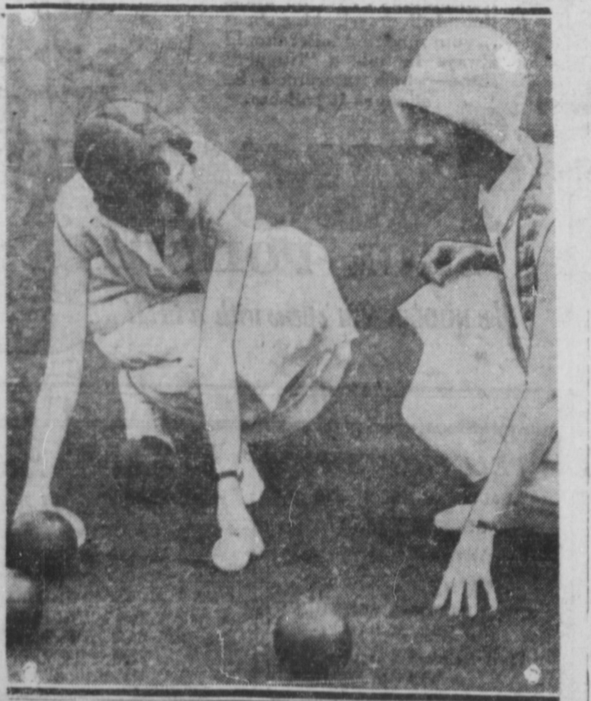
Women have now taken seriously to game of bowls, and county associations are being formed for them. Newcomers to game measure woods during practice match on Essex bowling green.