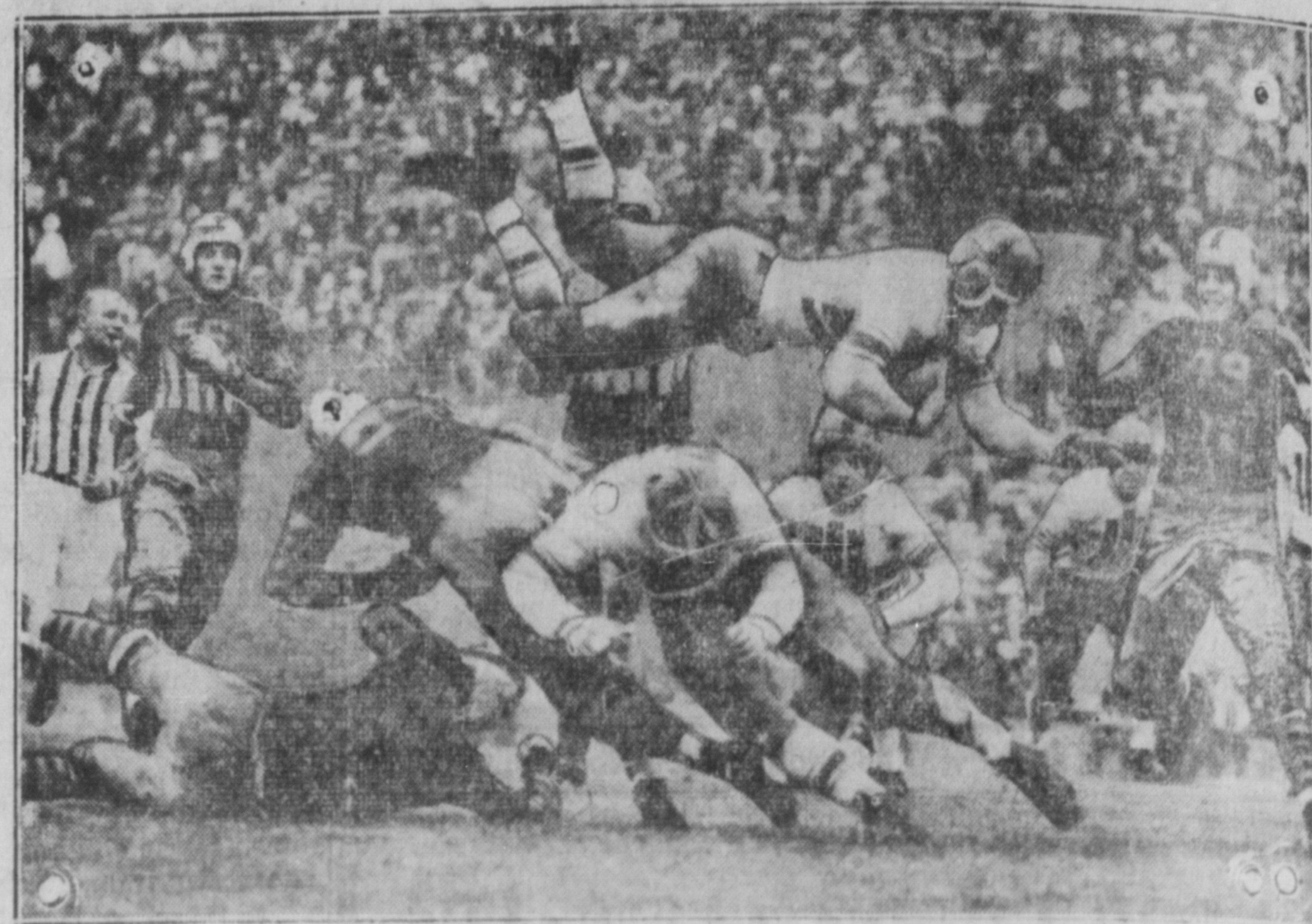
If it wasn't for the football garb, one would think this was a school of flying fish at play. This was during a Utah and Washington game at Seattle, recently, with the boy in the air from the Salt Lake state