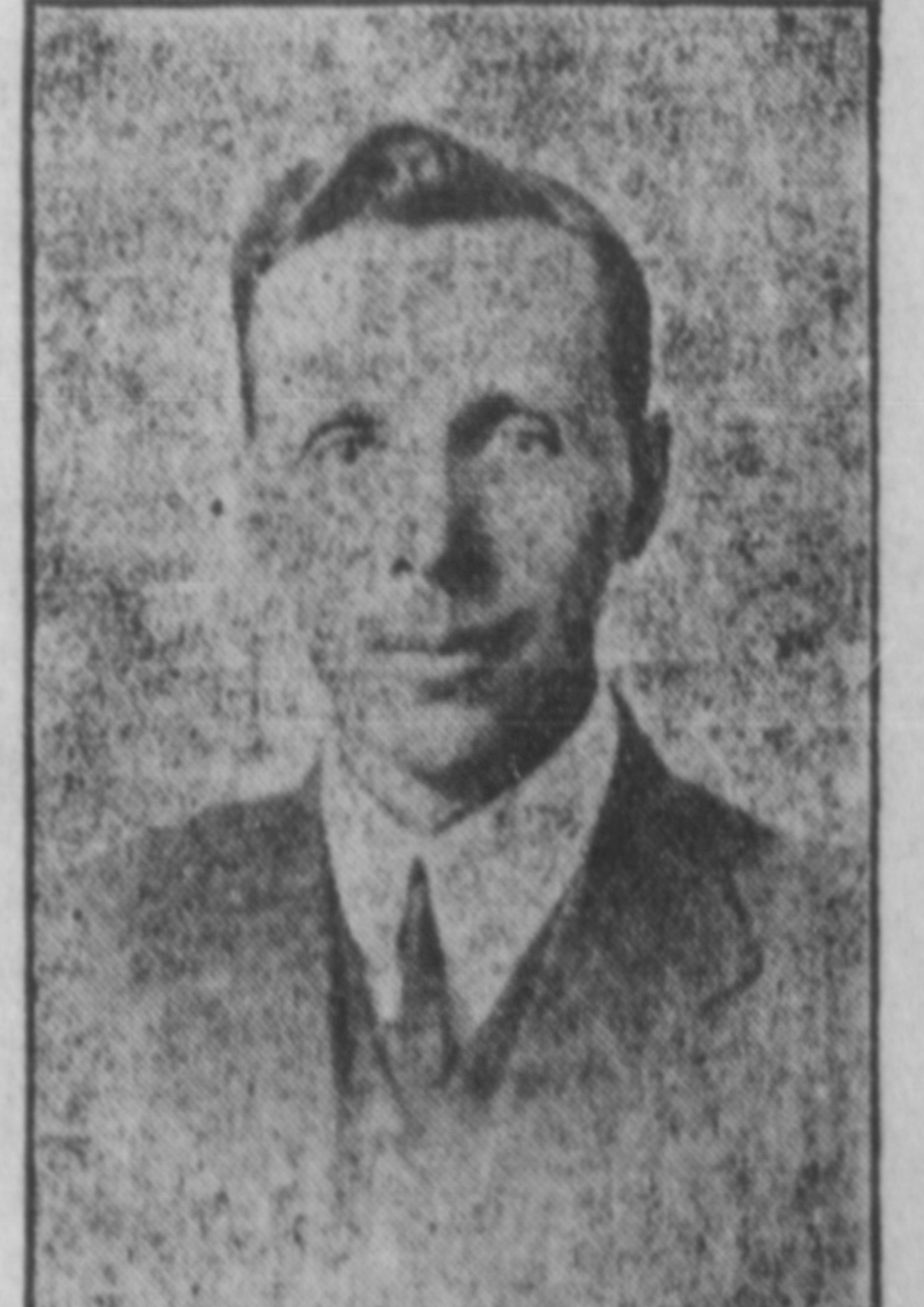
The new Minister of Finance.