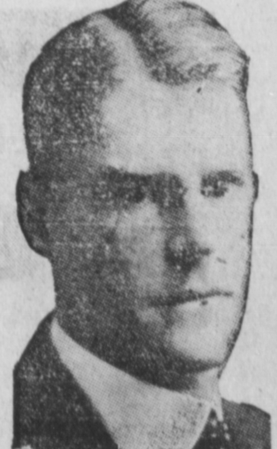
Conservative debate leader, Minister without Portfolio.