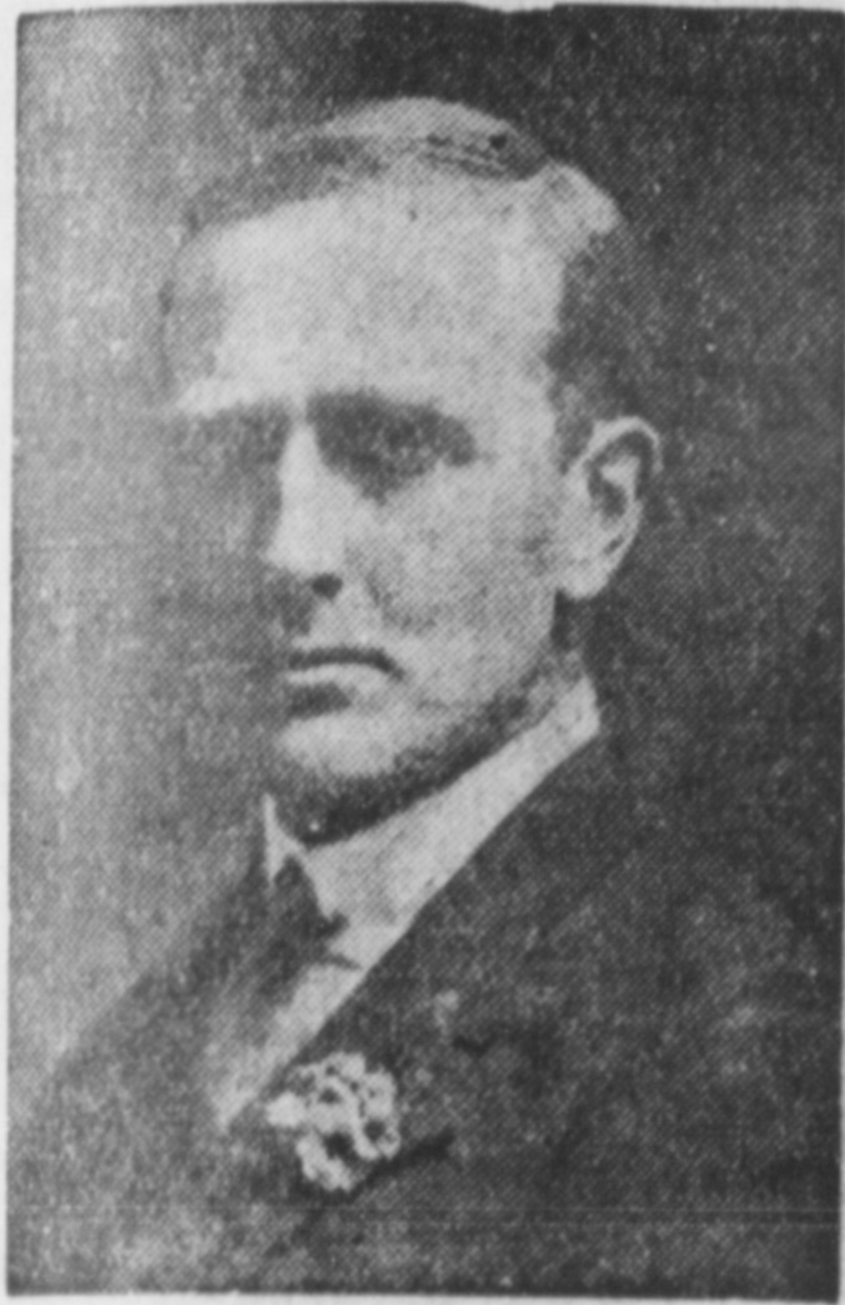
Attorney General of British Columbia