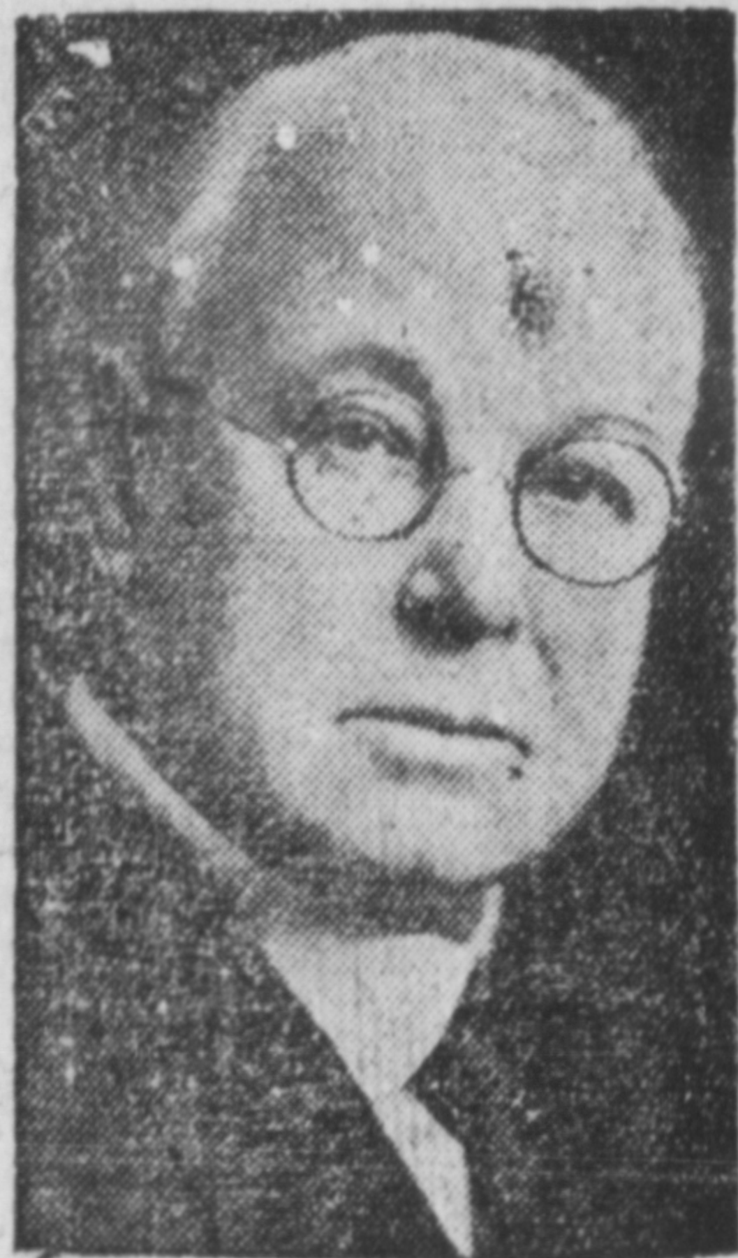
Commissioner of Fisheries.