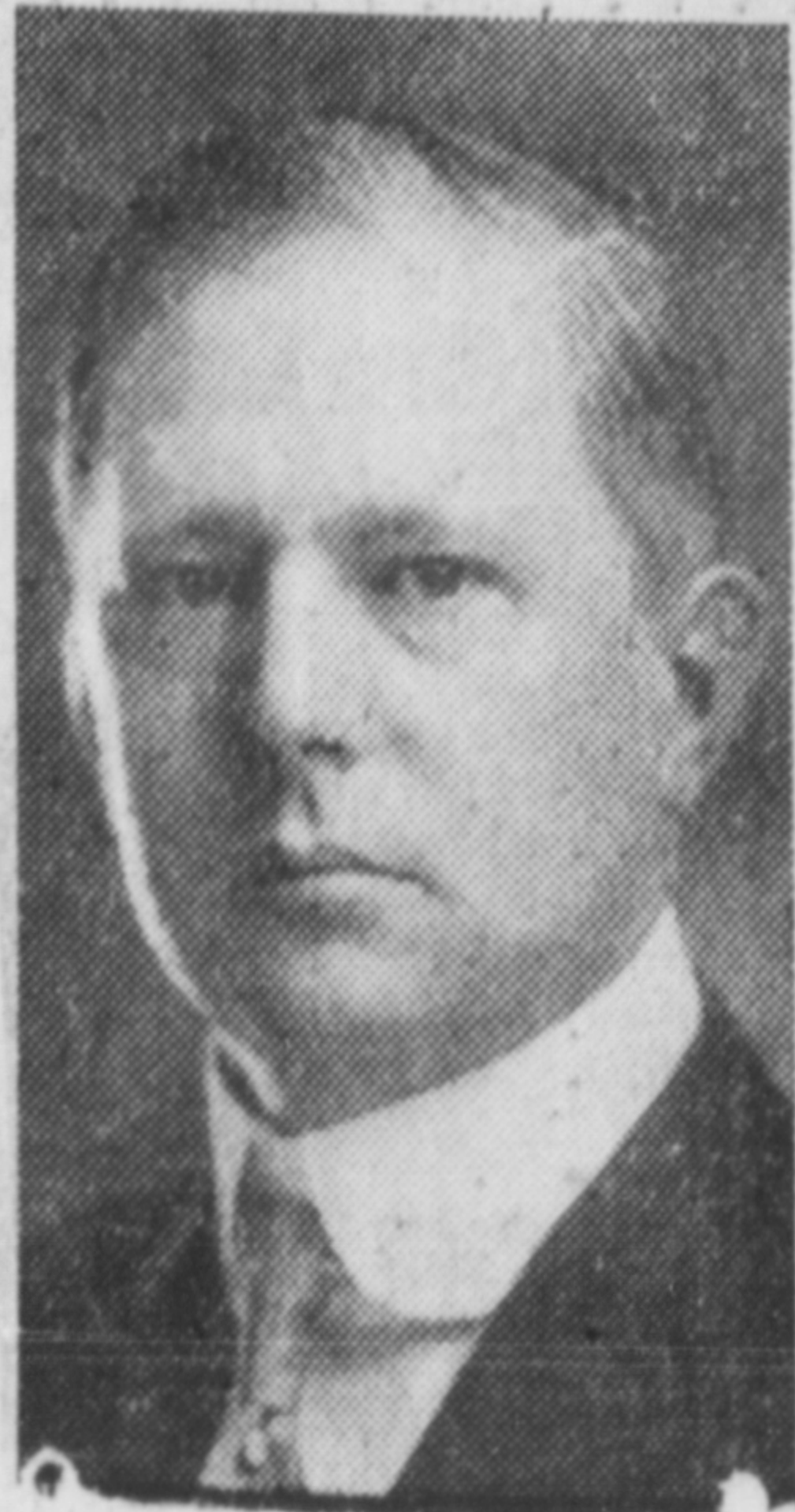
Chief lieutenant of the Liberal leader.