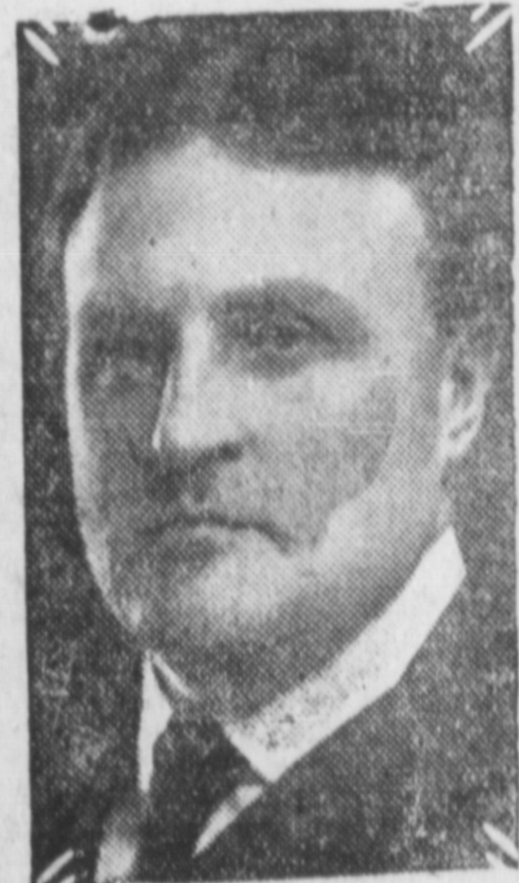
The able leader of the Liberal party for British Columbia.