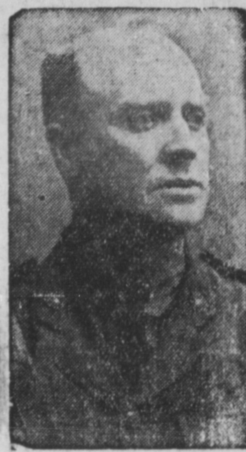
The Minister of Education.