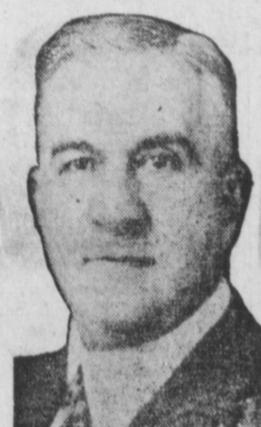
President of the Council.