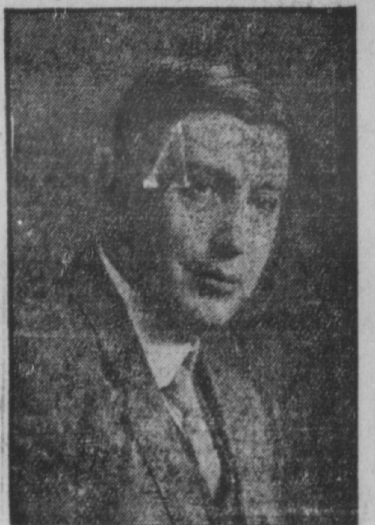
One of the prominent Liberal members, former Minister of Public Works