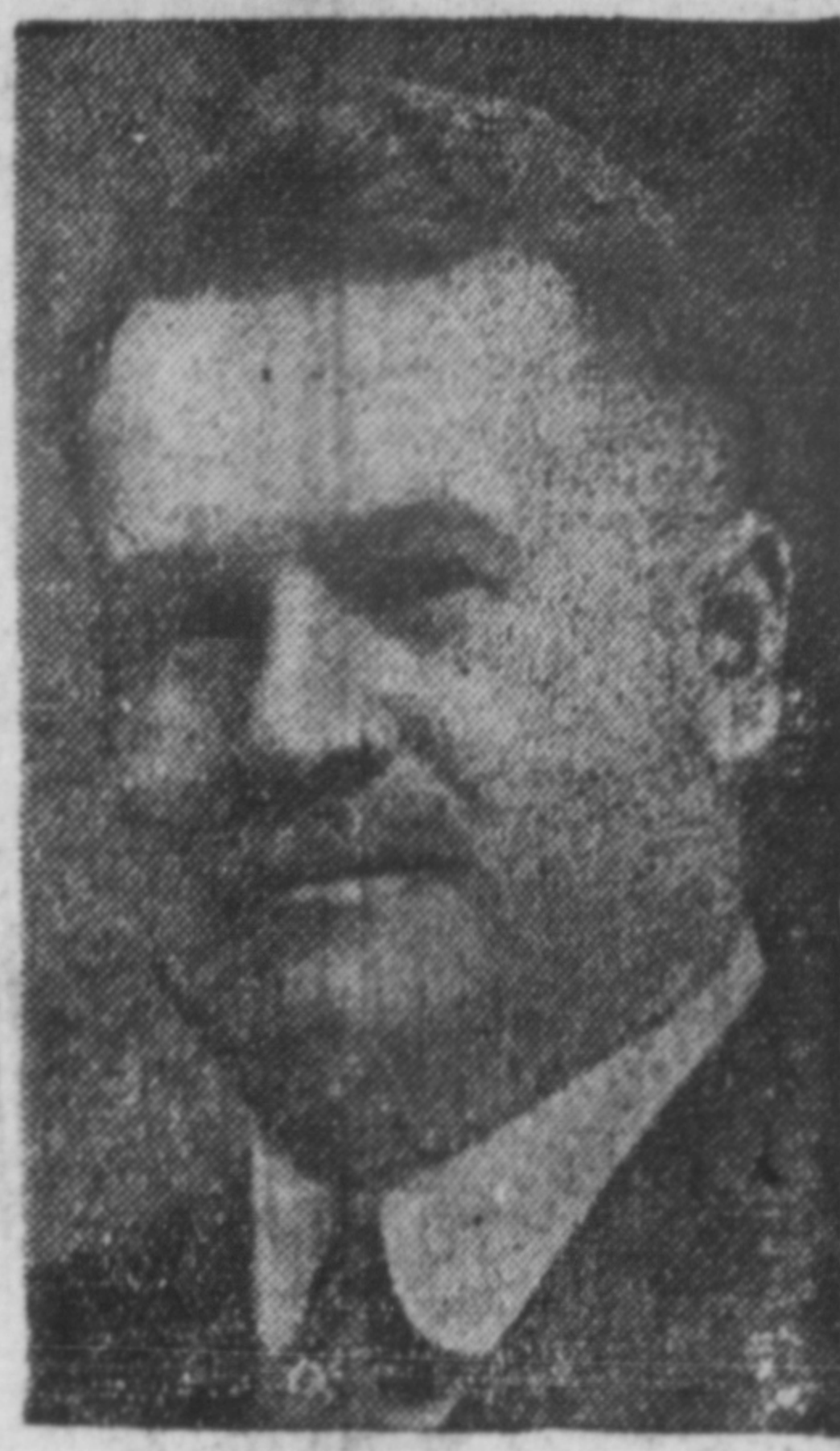
British Columbia's popular Premier.