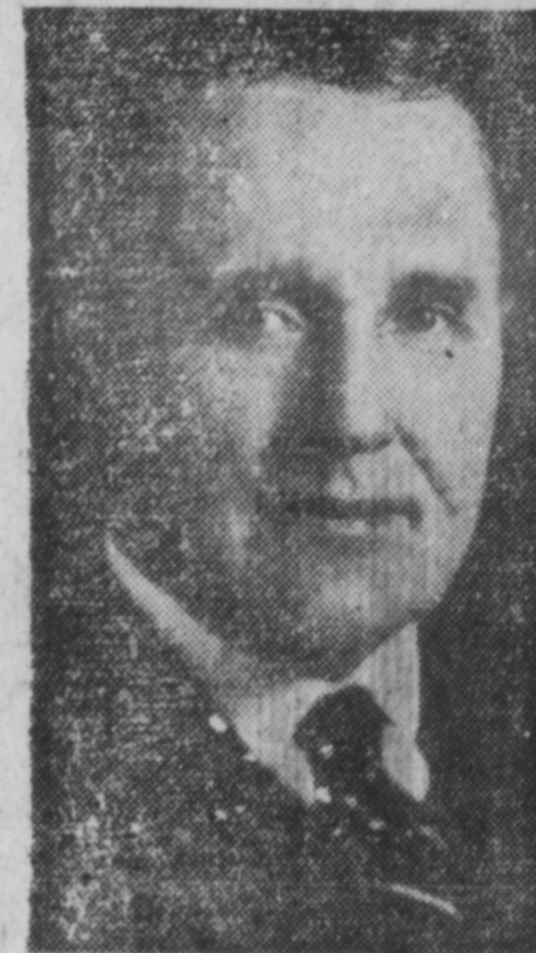
Minister of Agriculture.