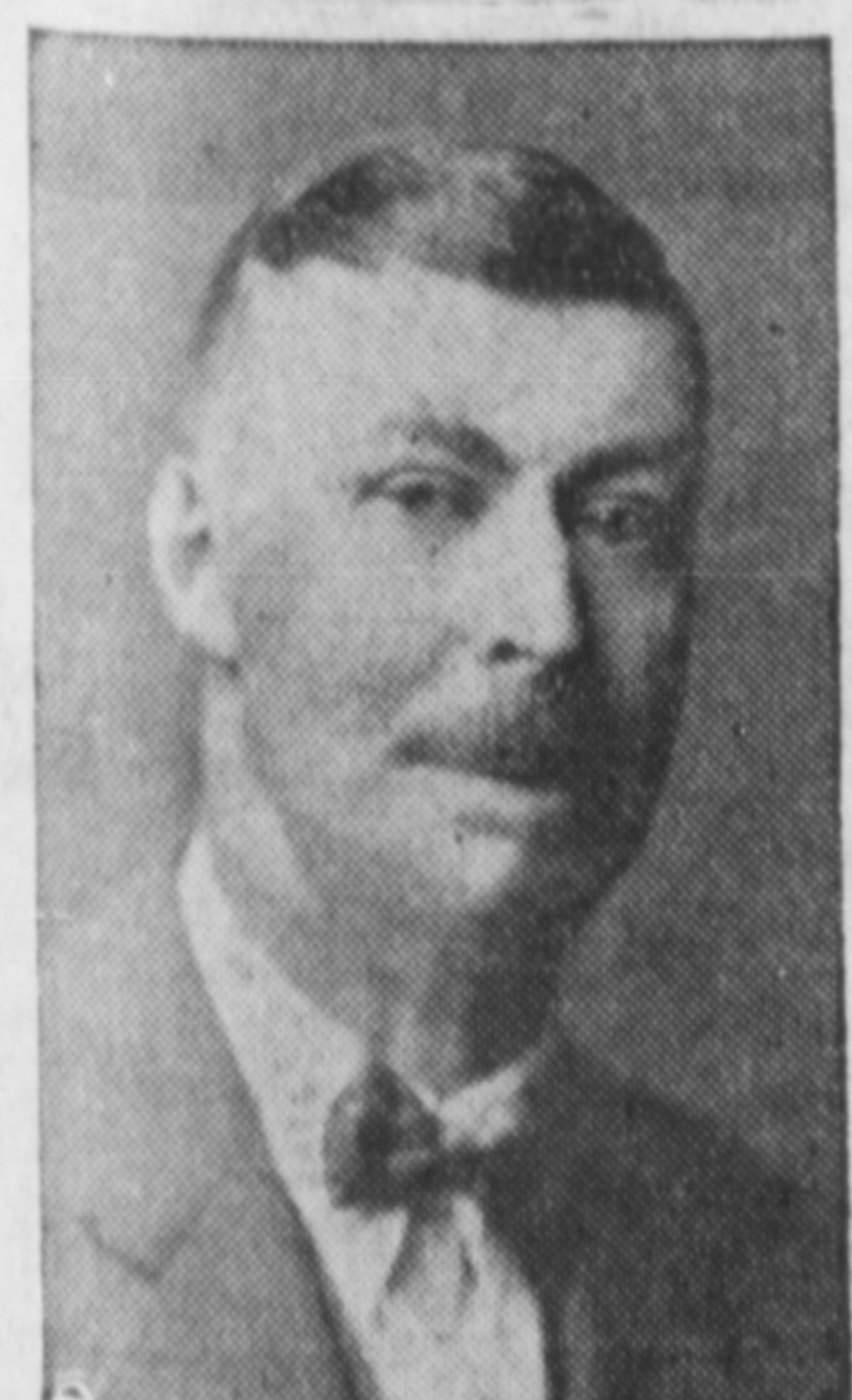
New Minister of Public Works.