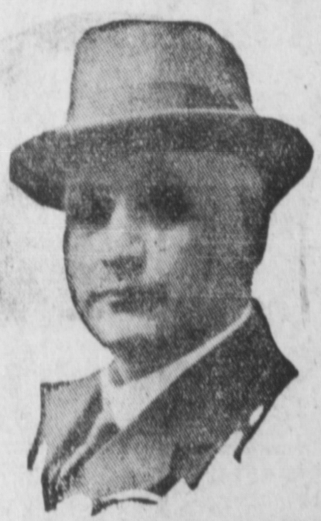
The Minister of Mines.