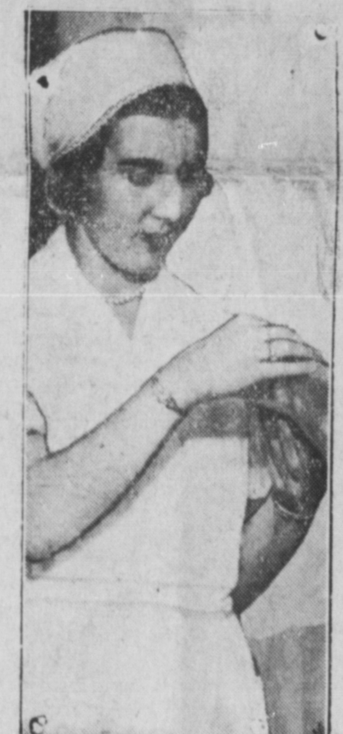
Princess Ingrid, only daughter of Crown Prince Gustaf Adolf, taking a course in cooking at a Stockholm Institute, is here seen preparing a fowl for broiling.