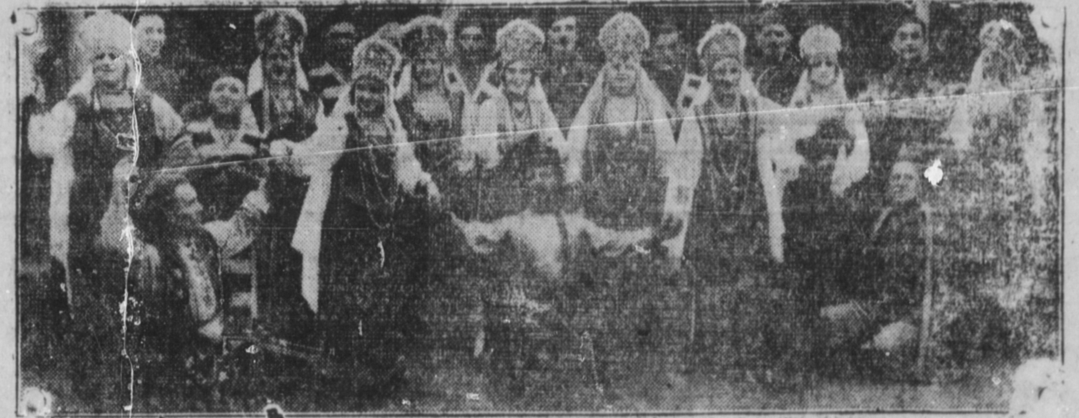
The group of musicians shown above will be heard in Prince Rupert on July 9 and again July 17 in Moose Hall, under auspices of the Prince Rupert Gyro Club.

commissioned by the Russian Czar to draft 100 of the nation's best singers from the Imperial Opera House and Conservatory to form a choir.