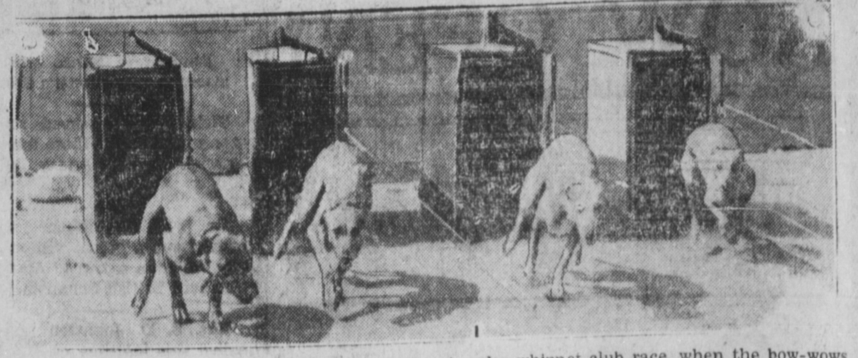
This breezy get-away of canines is the start of a Los Angeles whippet club race, when the bow-wows stretched out the old pedal extremities for honor and glory and all that.