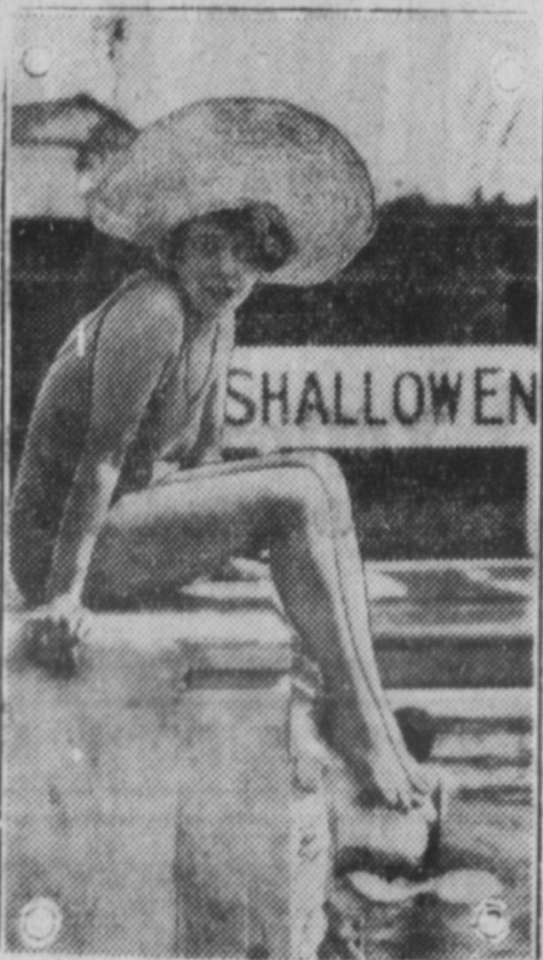
This young lady with the big straw hat is enjoying respite from heat wave at Chiswick, England.