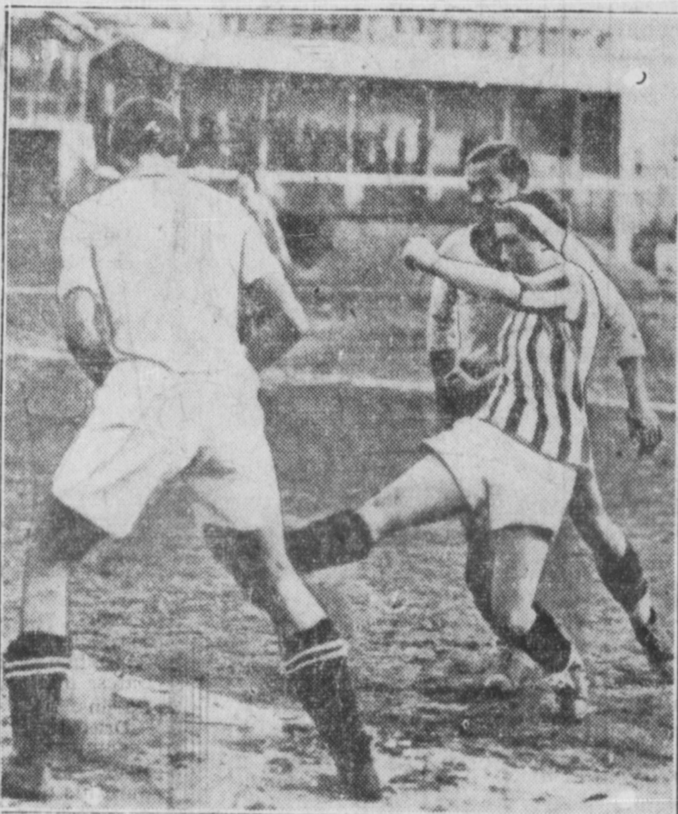
Stalwart member of "New Theatre" soccer team, theatrical girls' outfit, booting ball as members of "Arenaccia" men's soccer team attempt to goal, in match between men and women in Naples, Italy, when latter won.

At Ottawa, the Senators defeated the long-suffering Philadelphia Quakers five to three in overtime. The Quakers had a three to nothing lead at the end of the first period but Ottawa plugged along, tied it up in the third and scored twice in the extra session.