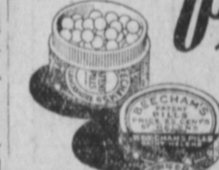
(The Nation's Laxative)

When all is not well with digestion take Beecham's Pills