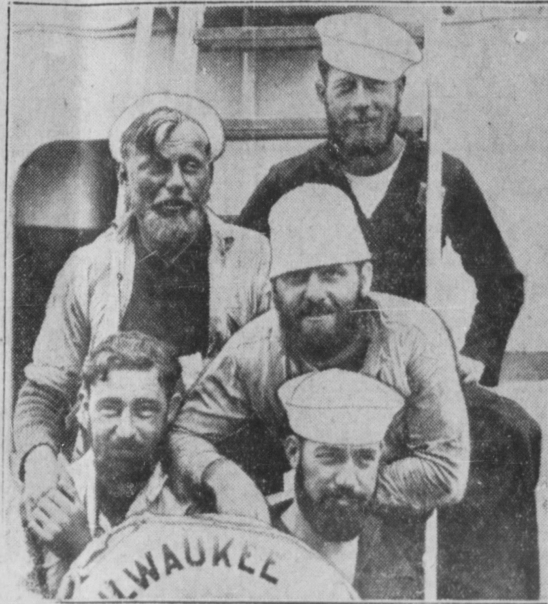
Whiskers, black ones, brown ones, some yellow ones and a few red ones, are seen sprouting from the noble chins of these men of the "briny deep" who returned to Boston recently aboard the United States steamer Milwaukee after a long water trip. These boys may be relatives of the well-known Smith Brothers—who knows!