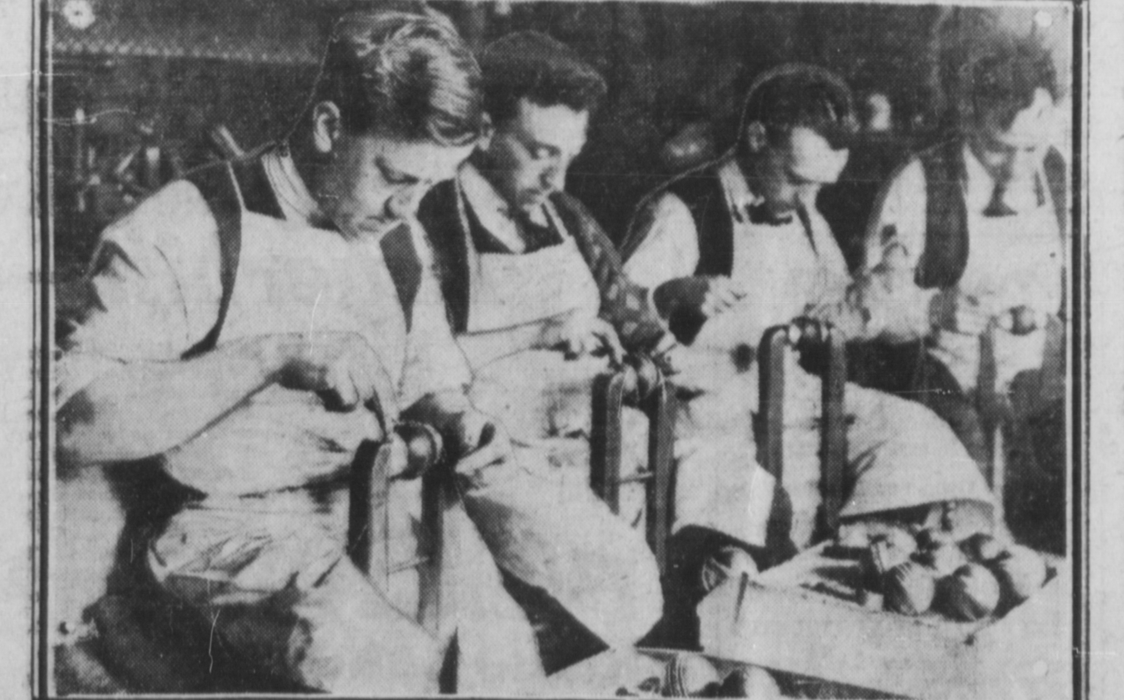
Ball manufacturers in England are now working at full pressure turning out cricket balls in readiness for forthcoming cricket season. Here is some in a London cricket ball factory.