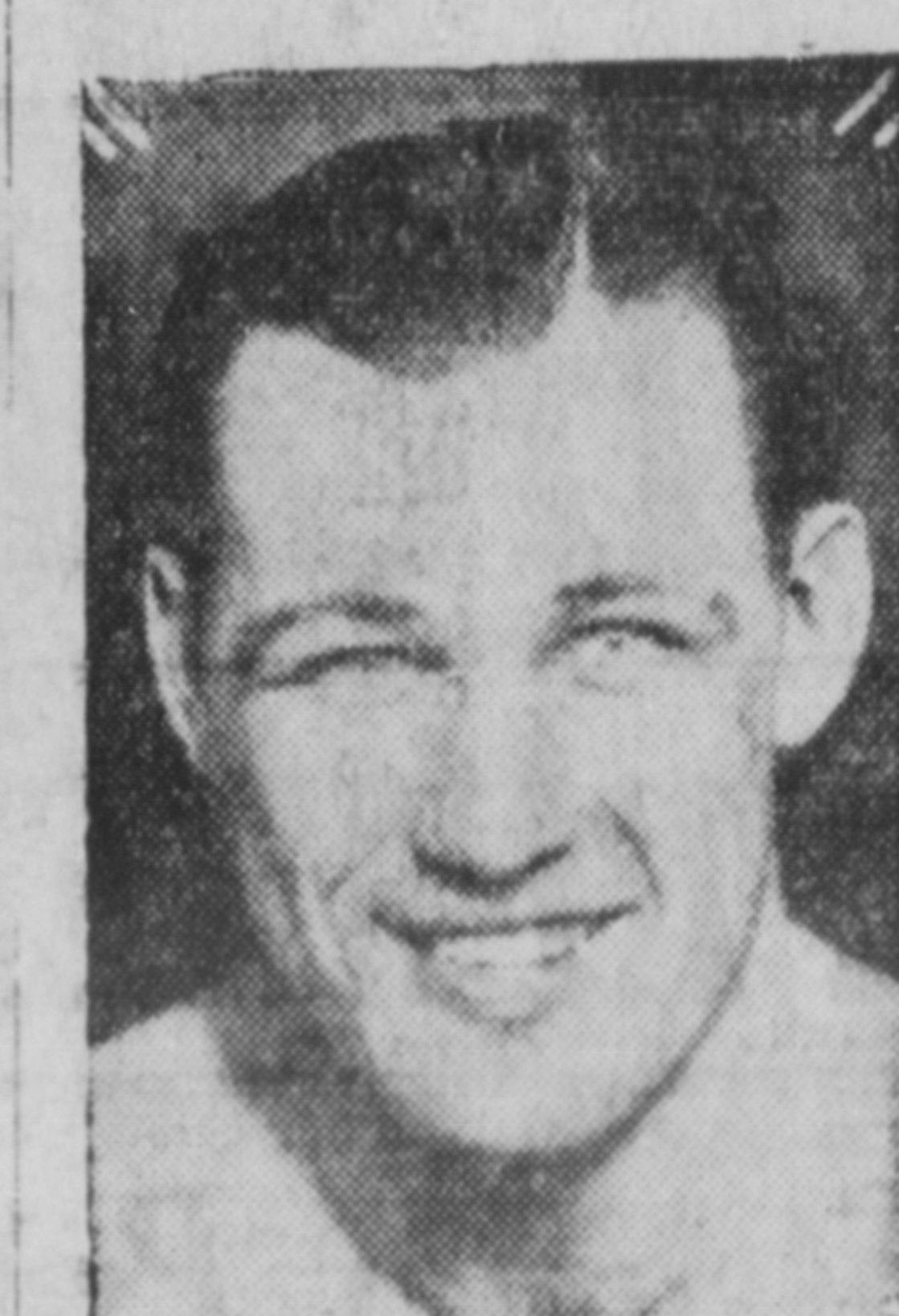
Jack Sharkey, who gave Primo Carnera worst defeat of his career last night.