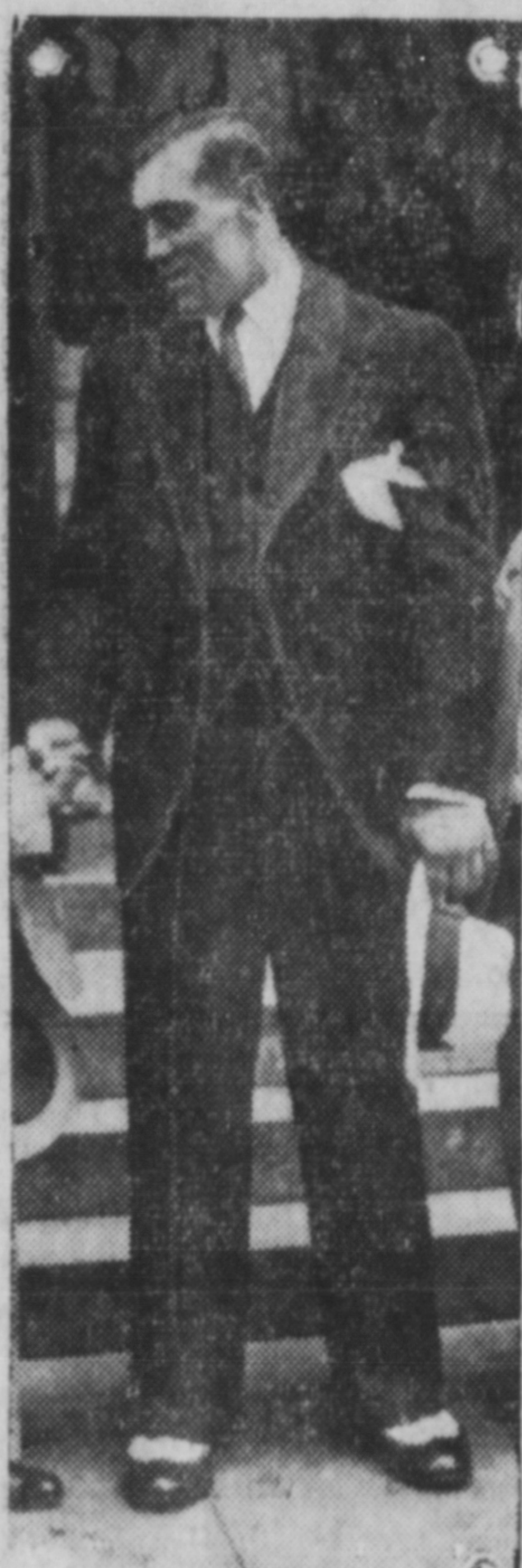
Massive Primo Carnera who lost to Sharkey.