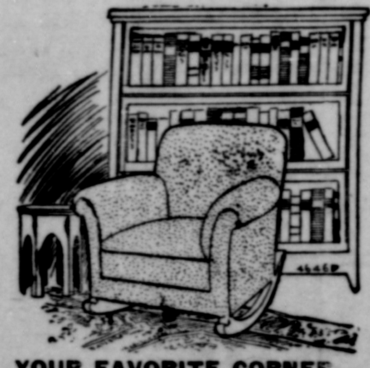
YOUR FAVORITE CORNER Is it furnished as you would like it? Have you a convenient case for your books, a chair that gives you rest and comfort and everything else in the line of the RIGHT FURNITURE?

TOYS for the CHILDREN Trains, Books, Dolls, Animals, Games, Balls, Tanks, Pistols, Wagons, Sleighs, in fact, see everything in Toyland at our store.