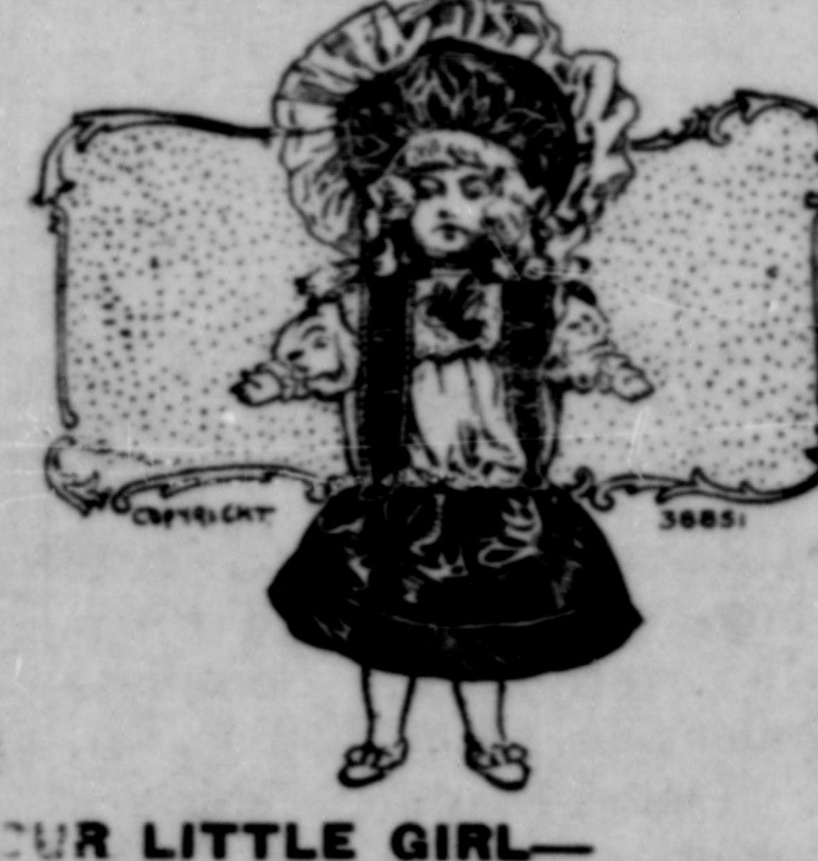
YOUR LITTLE GIRL —the one you delight in pleasing—whether or not she belongs to you, will just love a dolly that you give her. So bring her here and let her choose. THE DOLL SHE WANTS

TOYS for the CHILDREN Trains, Books, Dolls, Animals, Games, Balls, Tanks, Pistols, Wagons, Sleighs, in fact, see everything in Toyland at our store.