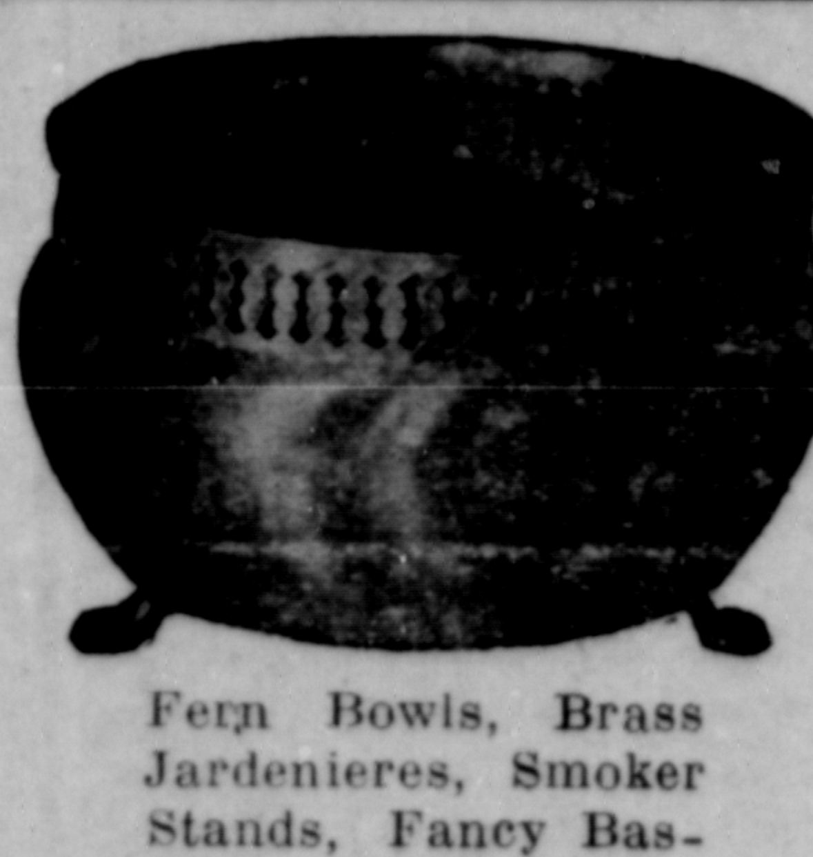
Fern Bowls, Brass Jardineres, Smoker Stands, Fancy Baskets, Ladies' Handkerchiefs and note paper in fancy boxes.

Fancy China Royal Dalton, Derby, Ainsley, Wedgewood, and hand pointed Japanese. Cut Glass Berry Bowls, Nappies, Bon Bon, Water Sets, Creams and Sugars. At Special discount prices for Xmas.