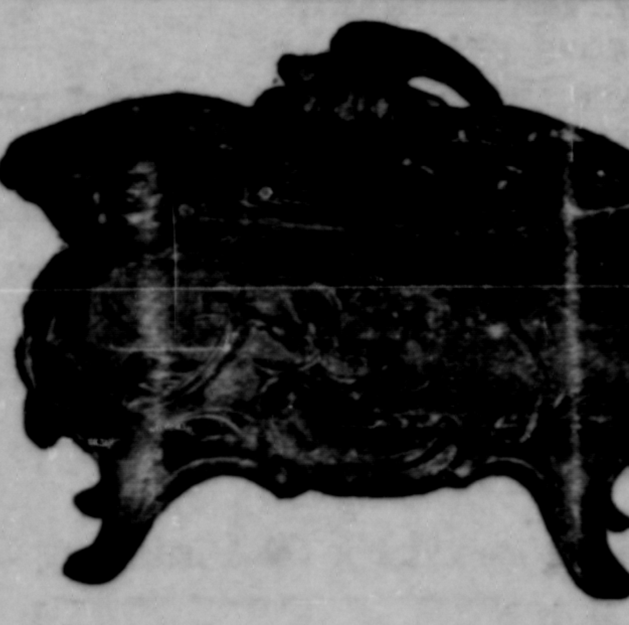
Fancy Jewel Case, Mesh Chain Bags, Ladies' Vanity Purses and Satchels.

Fancy China Royal Dalton, Derby, Ainsley, Wedgewood, and hand pointed Japanese. Cut Glass Berry Bowls, Nappies, Bon Bon, Water Sets, Creams and Sugars. At Special discount prices for Xmas.