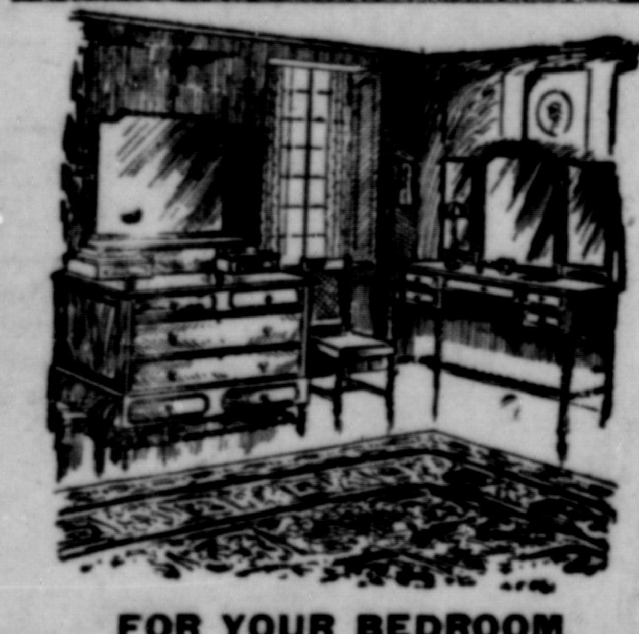
FOR YOUR BEDROOM Furniture in one of the period styles would be particularly pleasing and always in good taste. Call and see our large stock of HIGH-CLASS FURNITURE

Community Plate Silverware--- A Useful Gift--- THREE BEAUTIFUL DESIGNS—ADAM, PATRICIAN and SHERATON—The Gift de Luxe—Solid or Hollow Handle Knives, Spoons, Forks, Berry and Salad Spoons, Sugar Tongs, Butter Knives, Baby Spoons, Meat and Fish Forks. Also Leather and Mahogany Cases filled to suit your price. Axminster Carpet Square Tapestry or Brussels. Special Discount Price for Xmas.