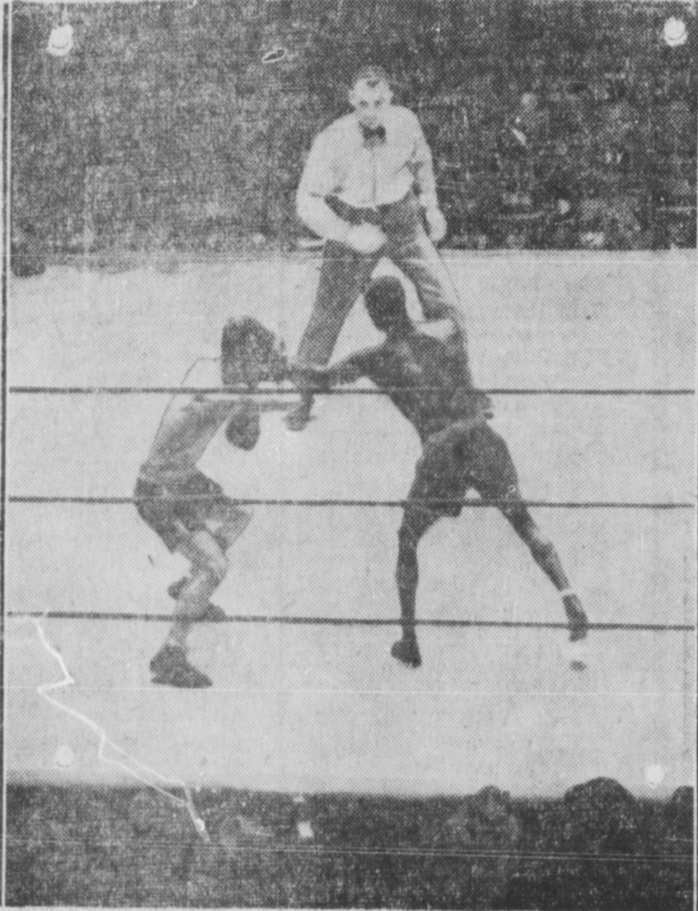
"Battling" Battalino blocking vicious left jab sent by Kid Chocolate during encounter which won decision for Battalino

"KID" CHOCOLATE AND "BATTING" BATTALINO IN ACTION