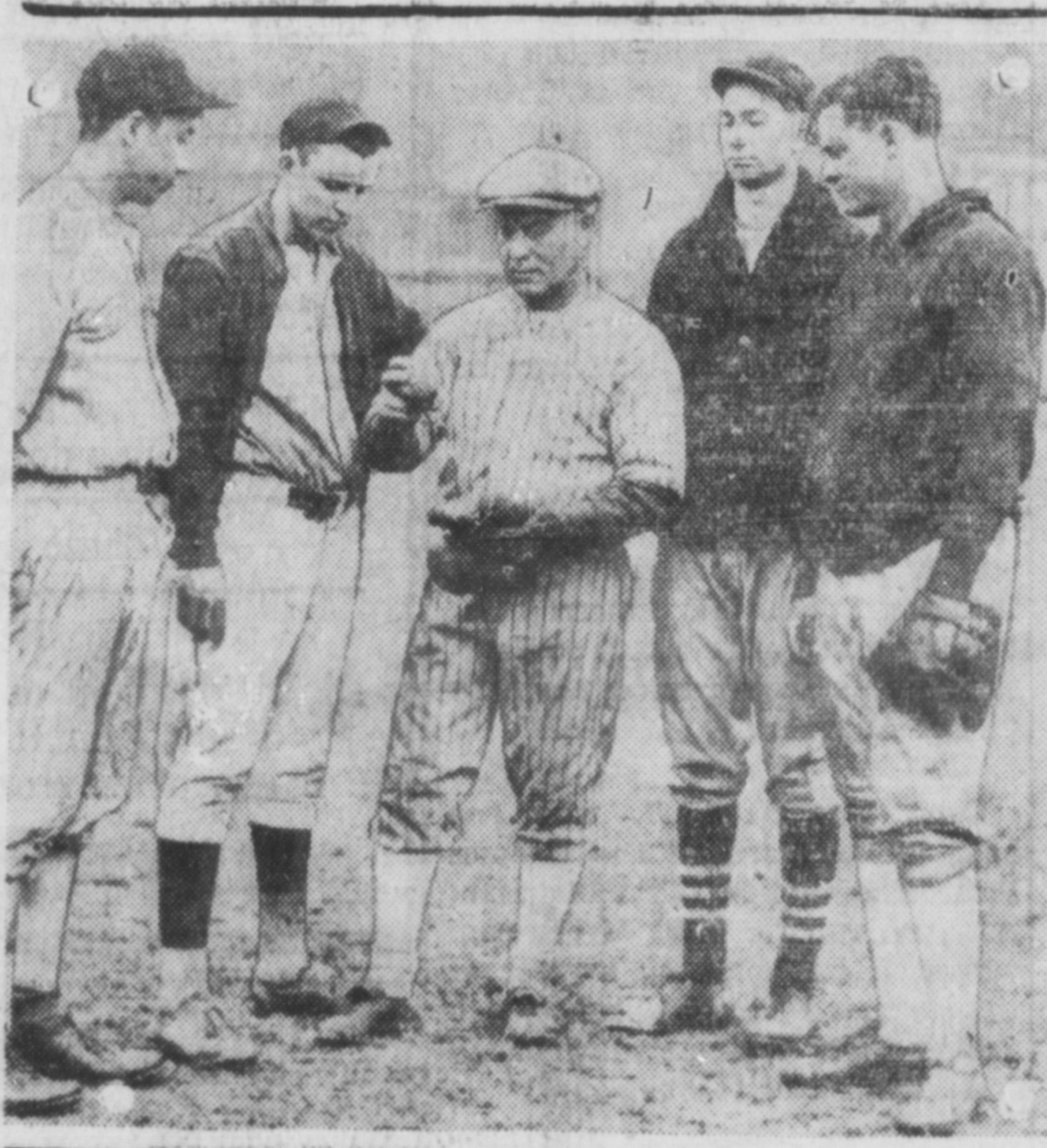
Baseball is major study in this school, for all candidates aspire to major leagues. Here we see Kid Elberfeld, diamond star of another day, instructing quartet of his 35 pupils in art of pitching a baseball.