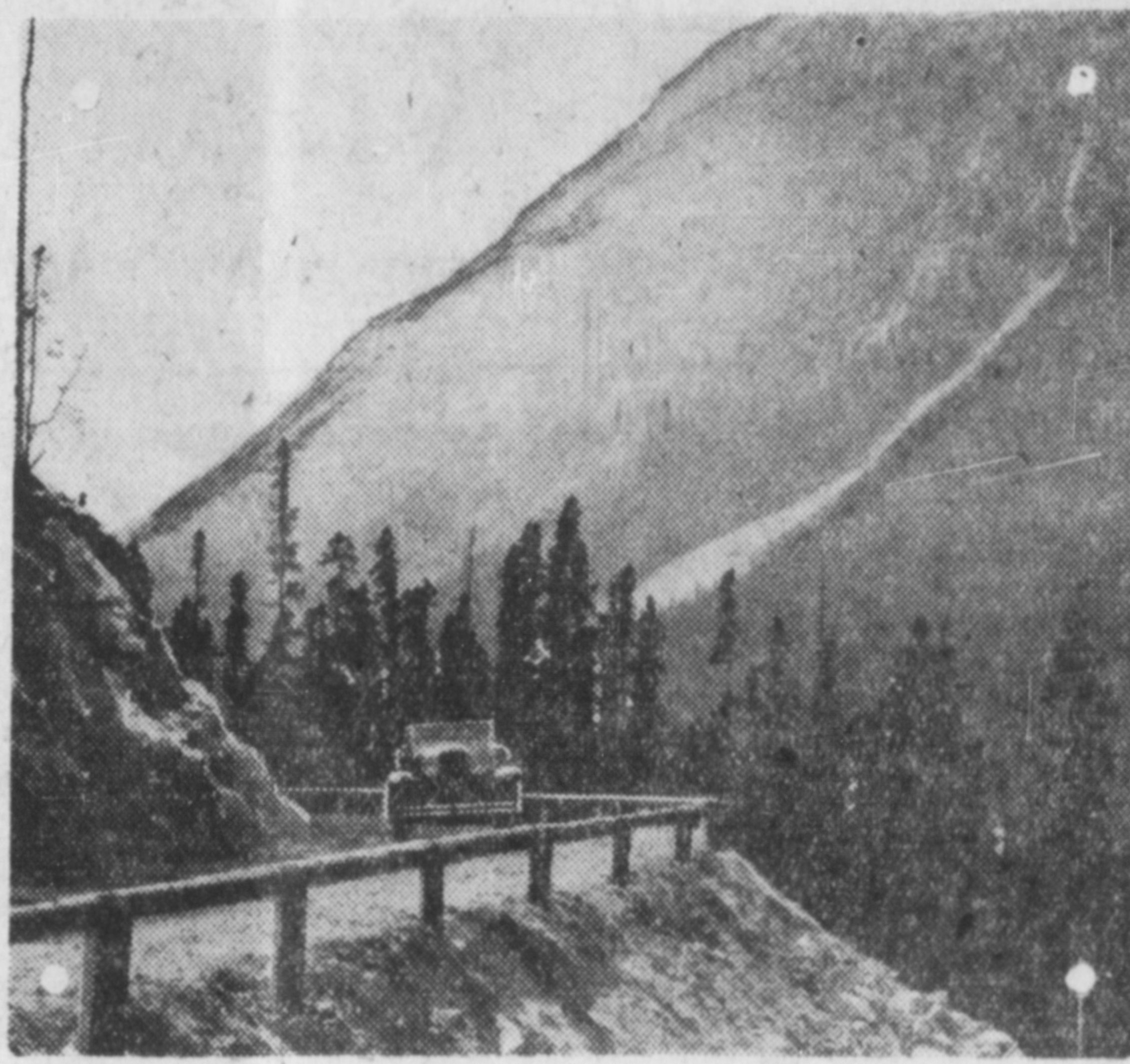
View on the Banff-Windermere road.