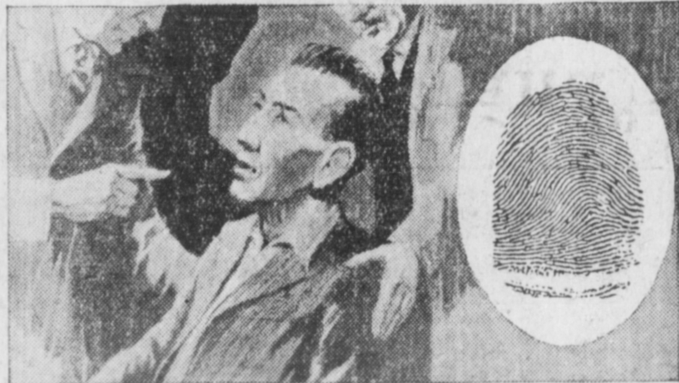
The wounded bandit in custody