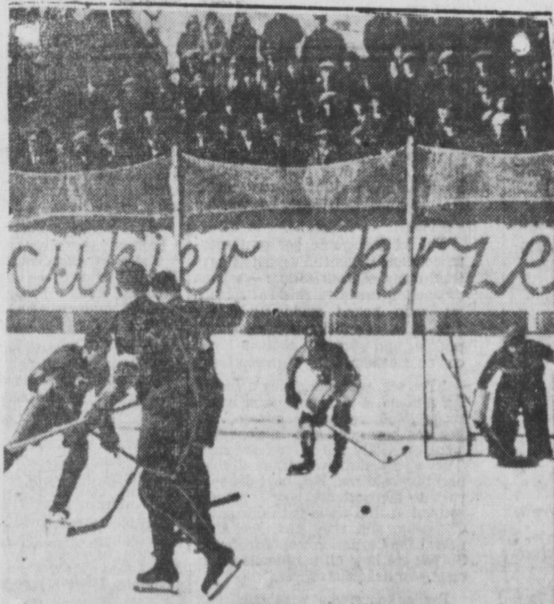
An exciting moment during the ice hockey match between Canada and France in the world championships which took place in Krynica, Poland. The Canadian team won 9-0.

GLASGOW, March 10.—Dundee defeated St. Mirren two to nil in a Scottish League, First Division, postponed game yesterday.