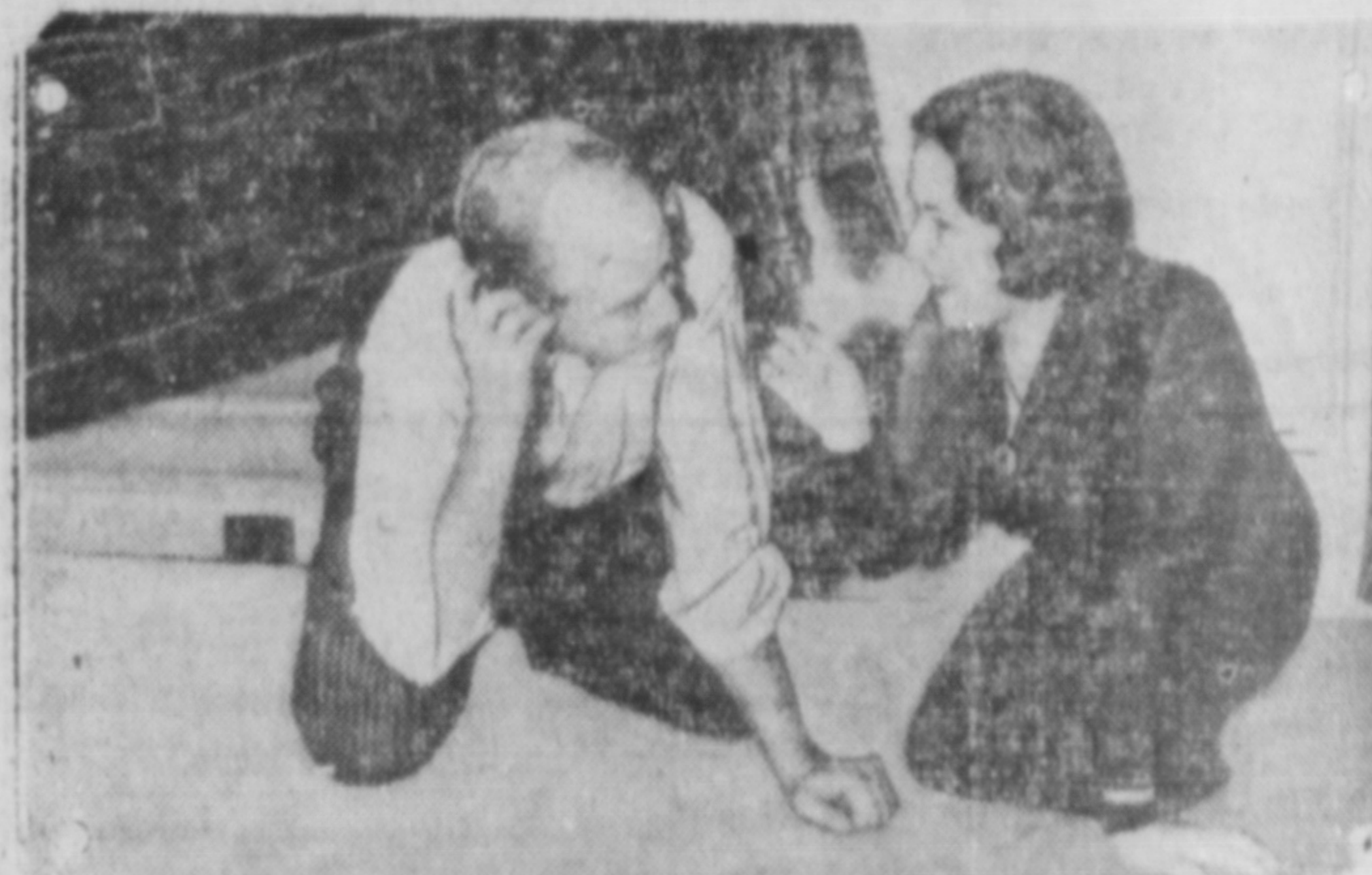
There's a big difference hunting wild animals and collar buttons. Martin Johnson agrees. Had Mrs. Johnson not found the button, he would have missed an important engagement.