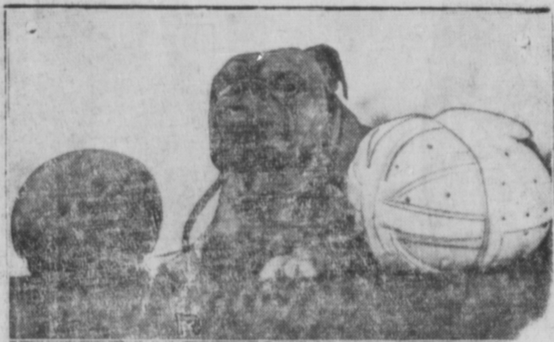
If the Yale line is as hard as the lines on the face of the team's bulldog mascot, football opponents have lots to worry about.