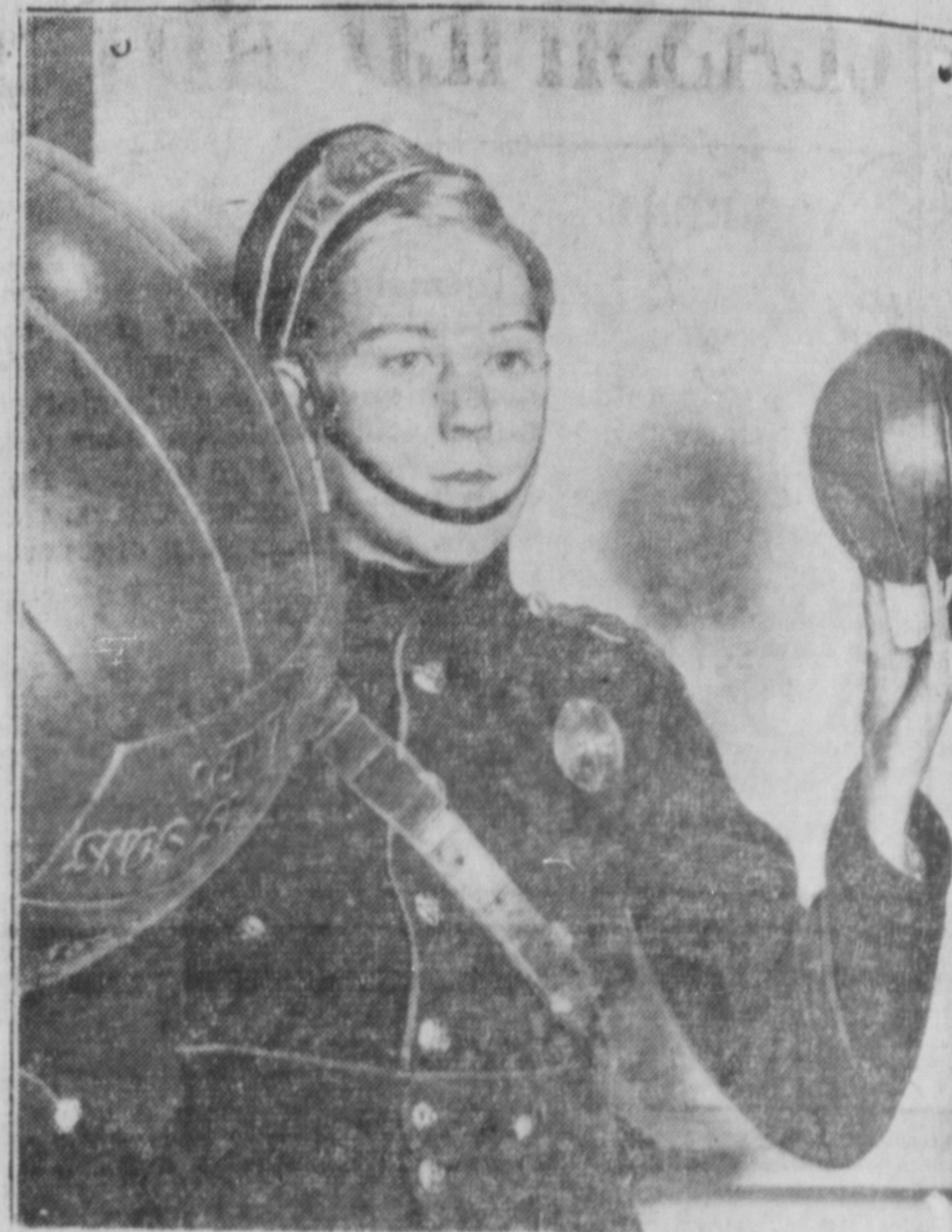
This messenger boy at the big leather fair in London, England, holds the two extremes in football. Whereas you can kick the small one all over the lot, the larger one is just a question.