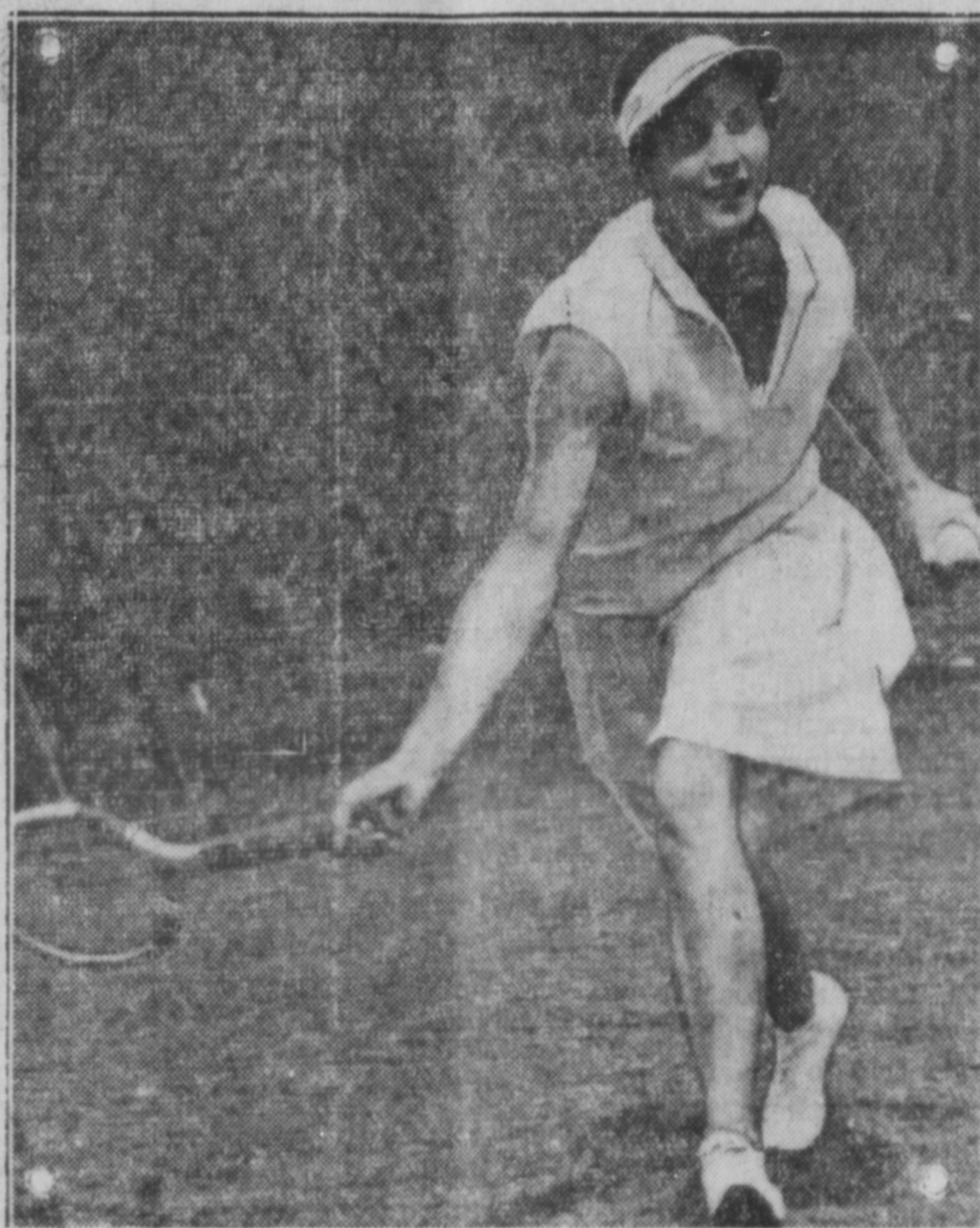
Always presenting a picture of poetic grace on the tennis courts, Mrs. Helen Wills Moody demonstrates that action which has won so many championships.