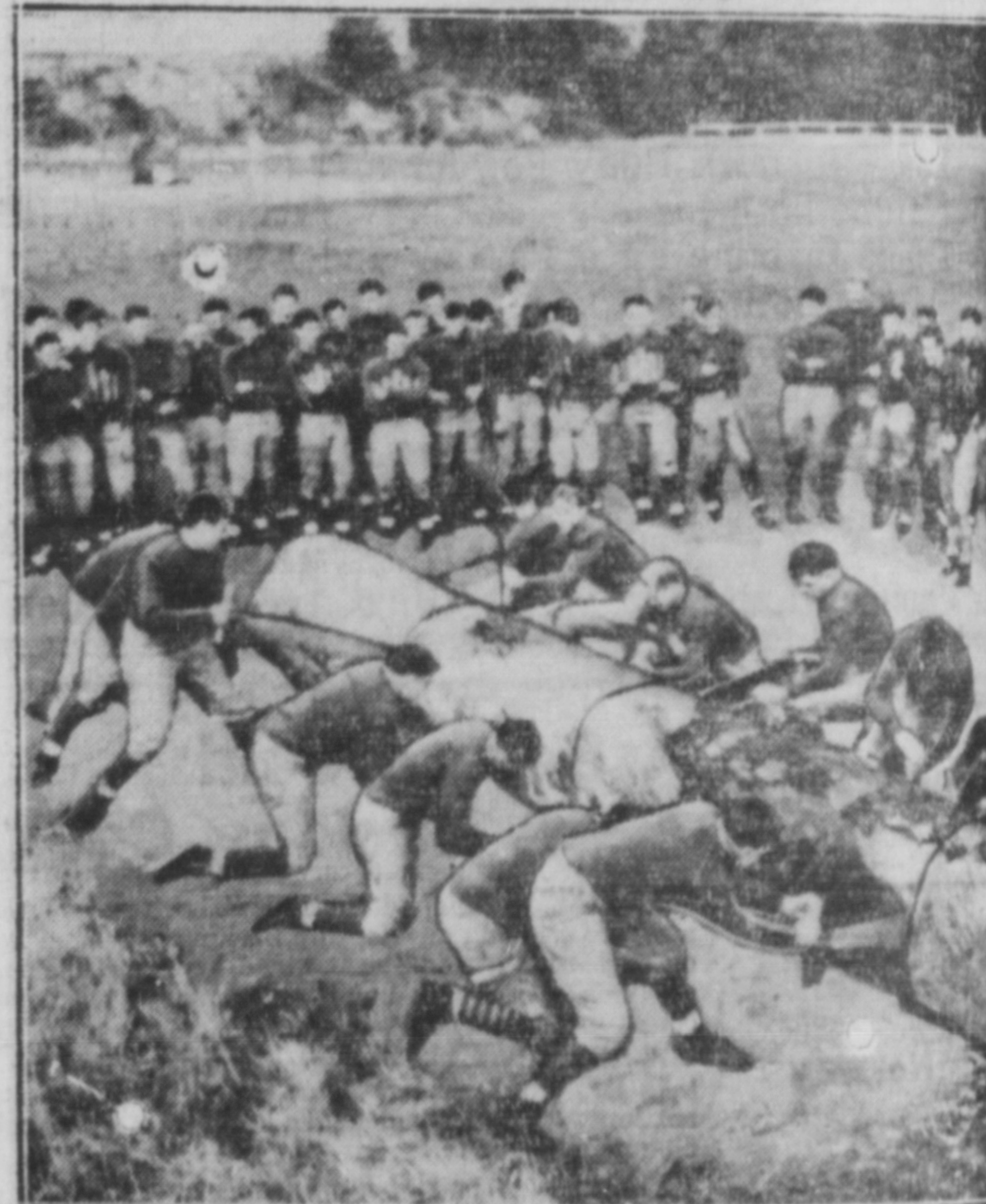
There are plenty of trees where this football team is training. Head coach of the University of Washington believes that good trees make good firewood, and, perhaps, more so when cut down by football aspirants.