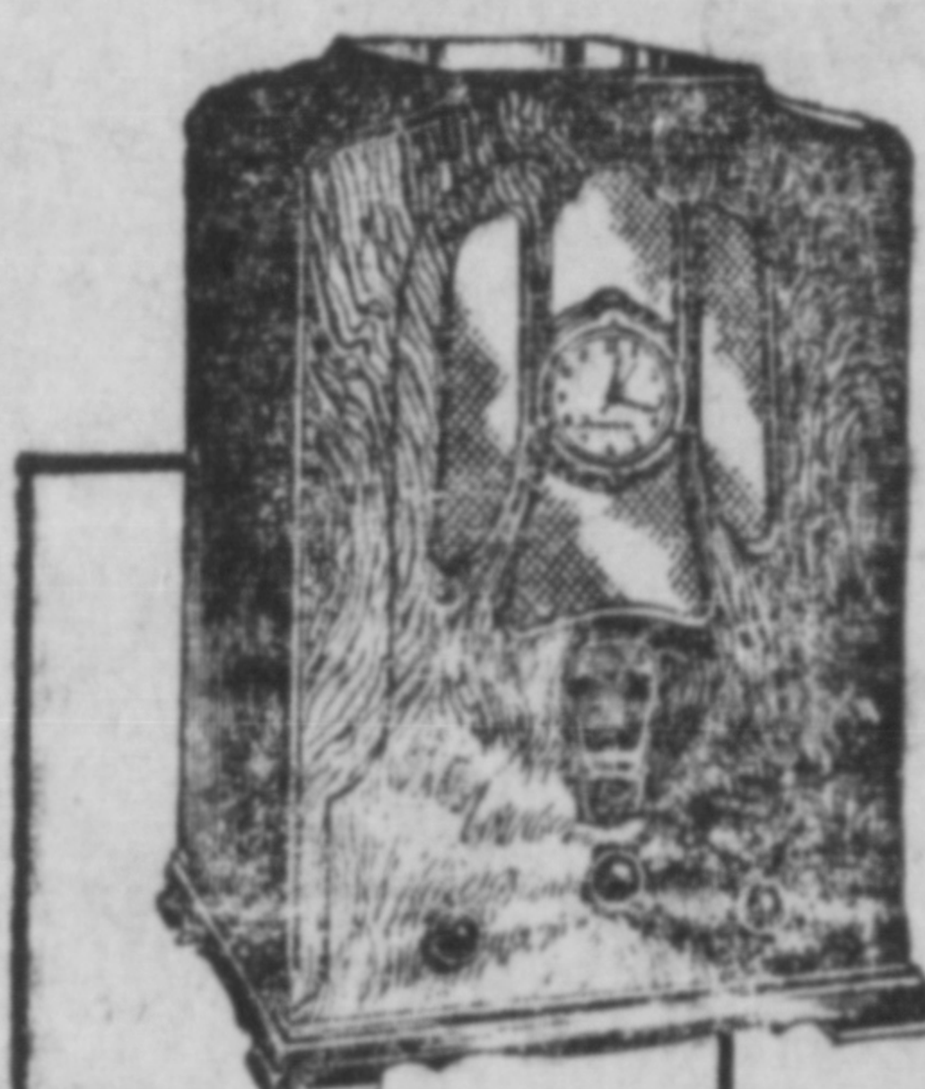
VICTOR "SUPERETTE" The smallest BIG radio ever built $89.50 With Telechron Clock as illustrated $105.50 Each complete with 8 tubes

Hear this new radio and realize the joy . . . the reliability . . . of automatic volume-control in a Victor Super-Heterodyne, made possible through correct engineering of pentode and super-control tubes. Now, within this luxuriously designed and beautifully executed cabinet, you are offered a receiver which will transport the pleasure of listening-in to new heights of absolute enjoyment.