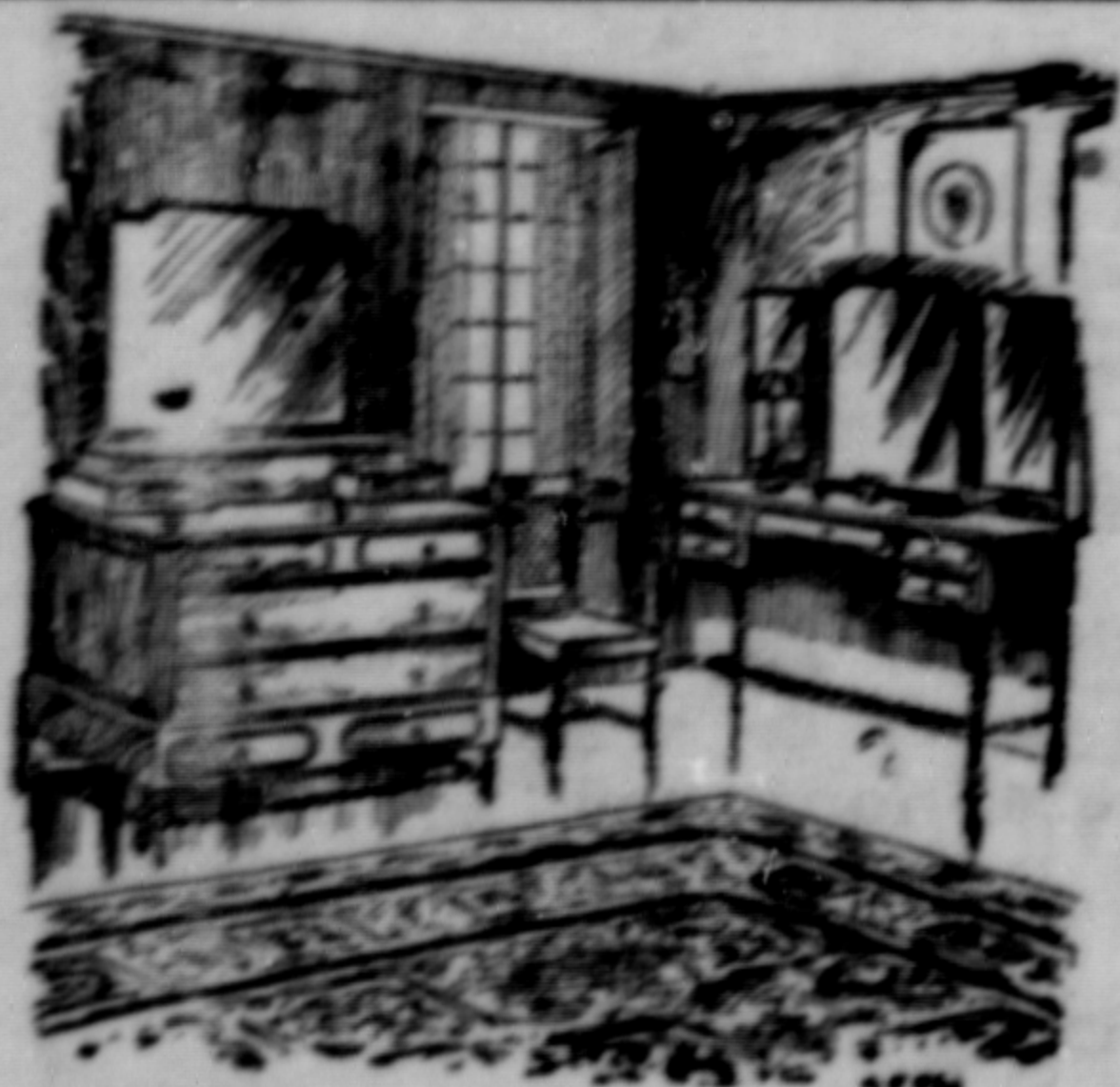
FOR YOUR BEDROOM

Axminster Carpet Square Tapestry or Brussels. Special Discount Price for Xmas.