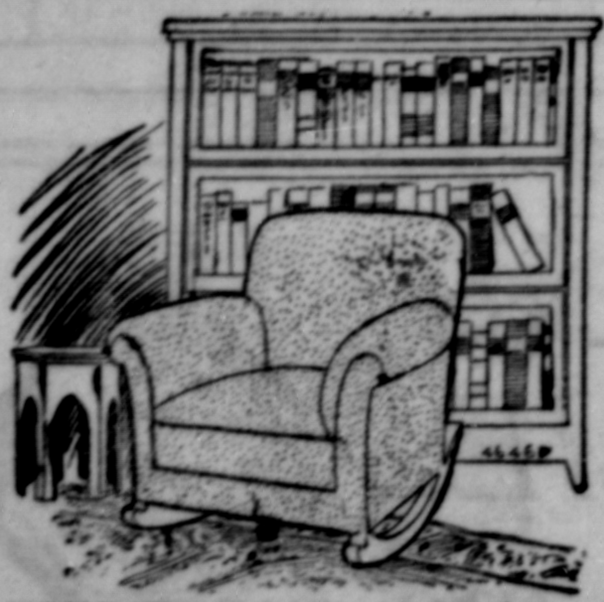
YOUR FAVORITE CORNER

Is it furnished as you would like it? Have you a convenient case for your books, a chair that gives you rest and comfort and everything else in the line of the RIGHT FURNITURE?