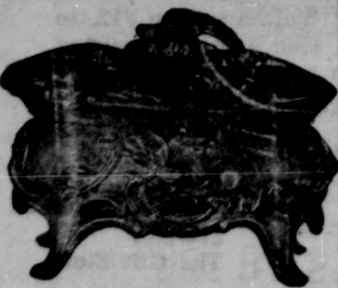
Fancy Jewel Case, Mesh Chain Bags, Ladies' Vanity Purses and Satchels.