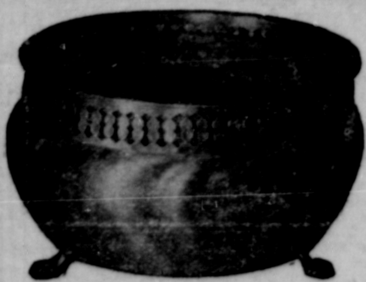
Fern Bowls, Brass Jardinieres, Smoker Stands, Fancy Baskets, Ladies' Handkerchiefs and note paper in fancy boxes.

Berry Bowls, Nappies Bon Bon, Water Sets, Creams and Sugars. At Special discount prices for Xmas.