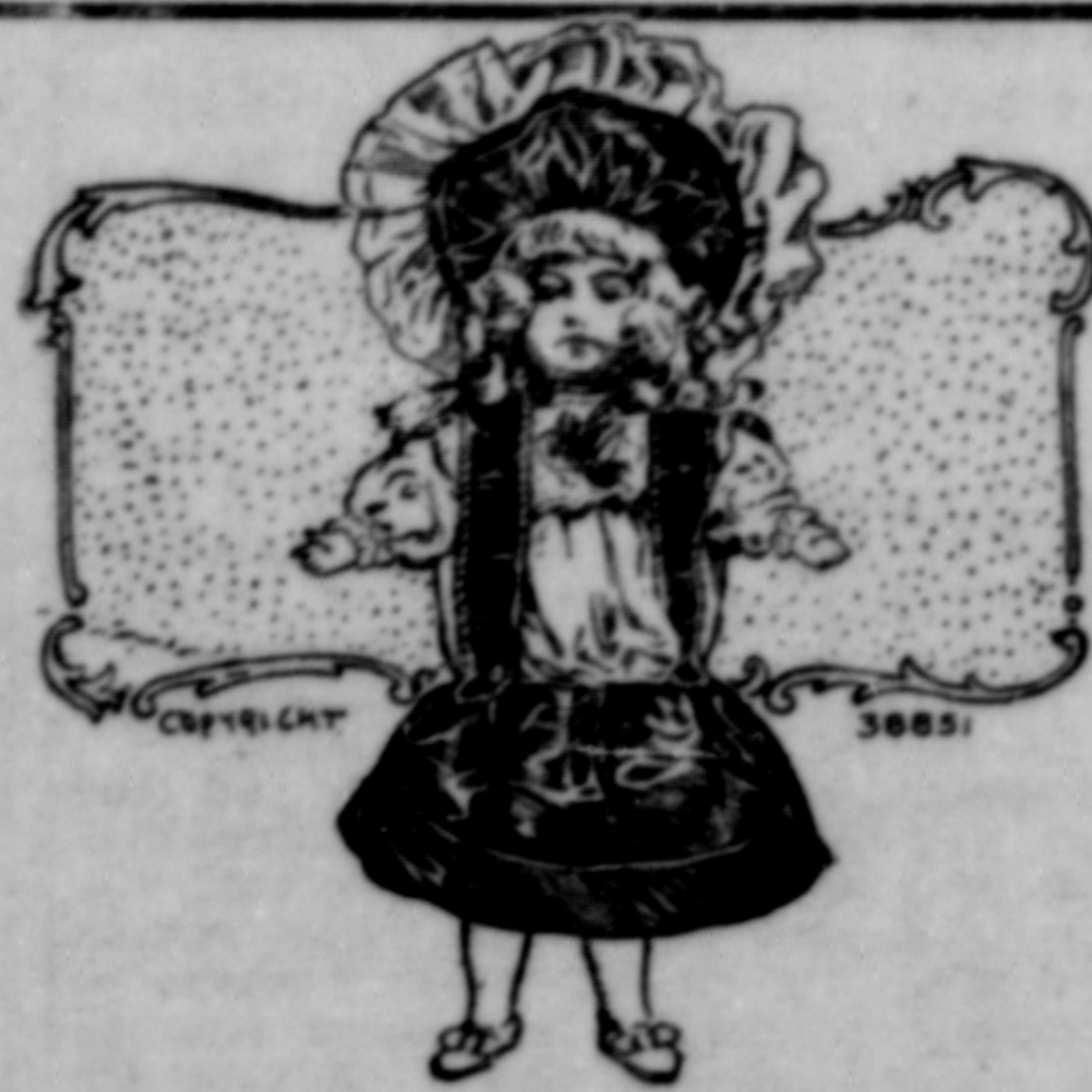
YOUR LITTLE GIRL

Trains, Books, Dolls, Animals, Games, Balls, Tanks, Pistols, Wagons, Sleighs, in fact, see everything in Toyland at our store.