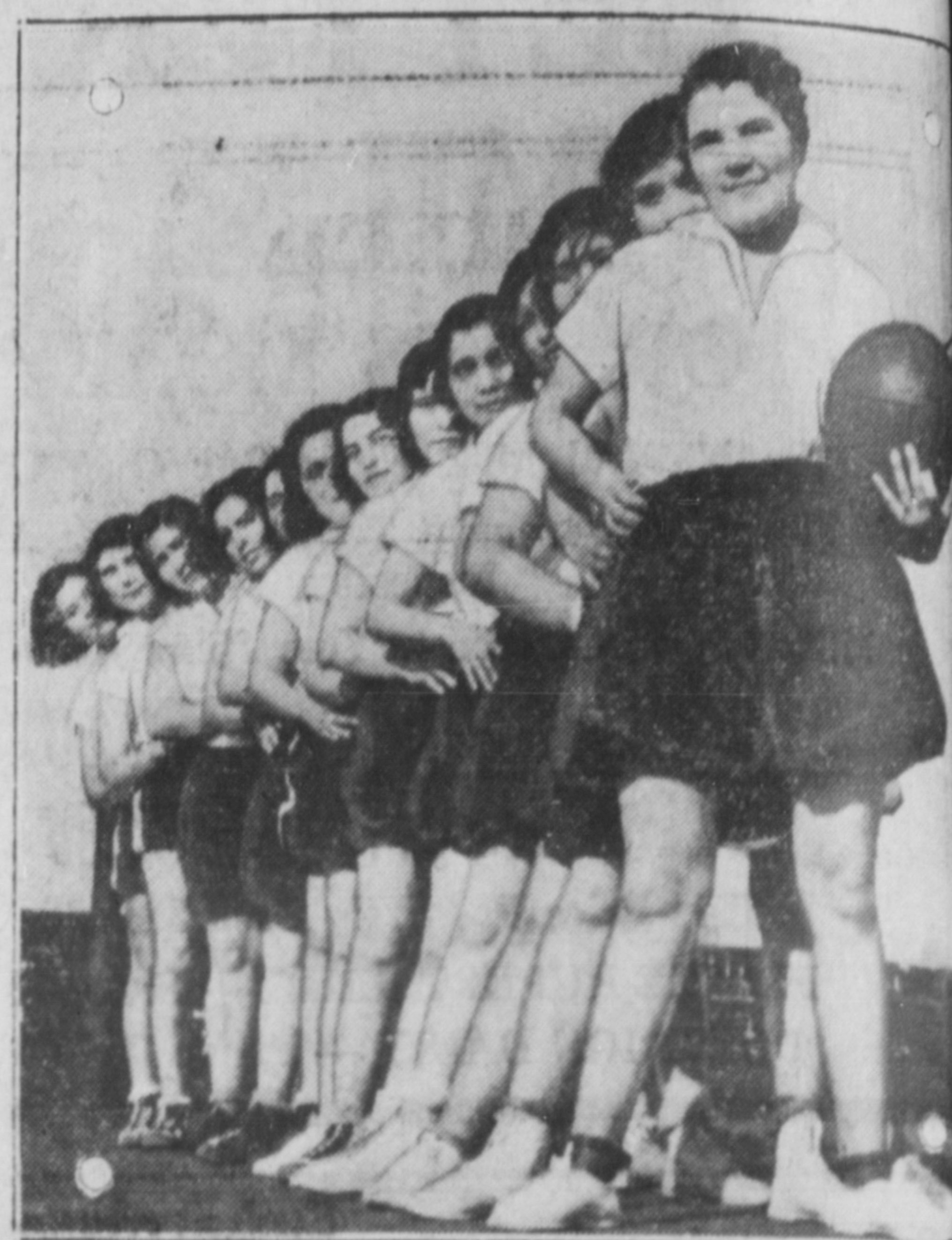
They'd hardly make the Pollys, we admit, but the Indian play a nifty game of basketball. All are members of Los Angeles Young Women's Christian Association.

Correspondence School, is spending a few days in Prince George on business.