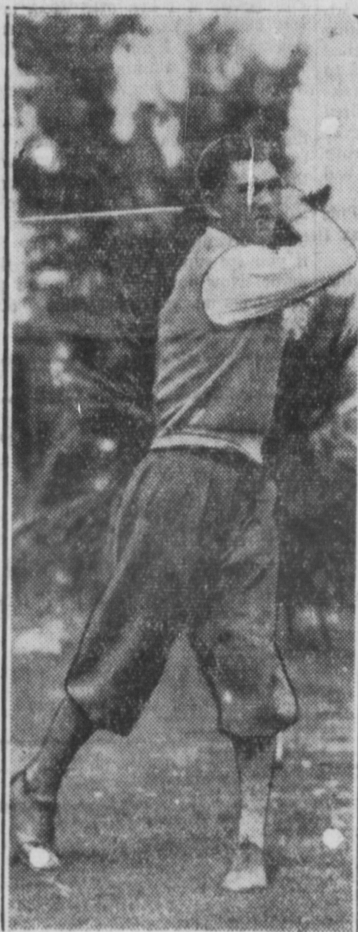
Max Schmeling, who has returned to this country to engage in barnstorming tour.