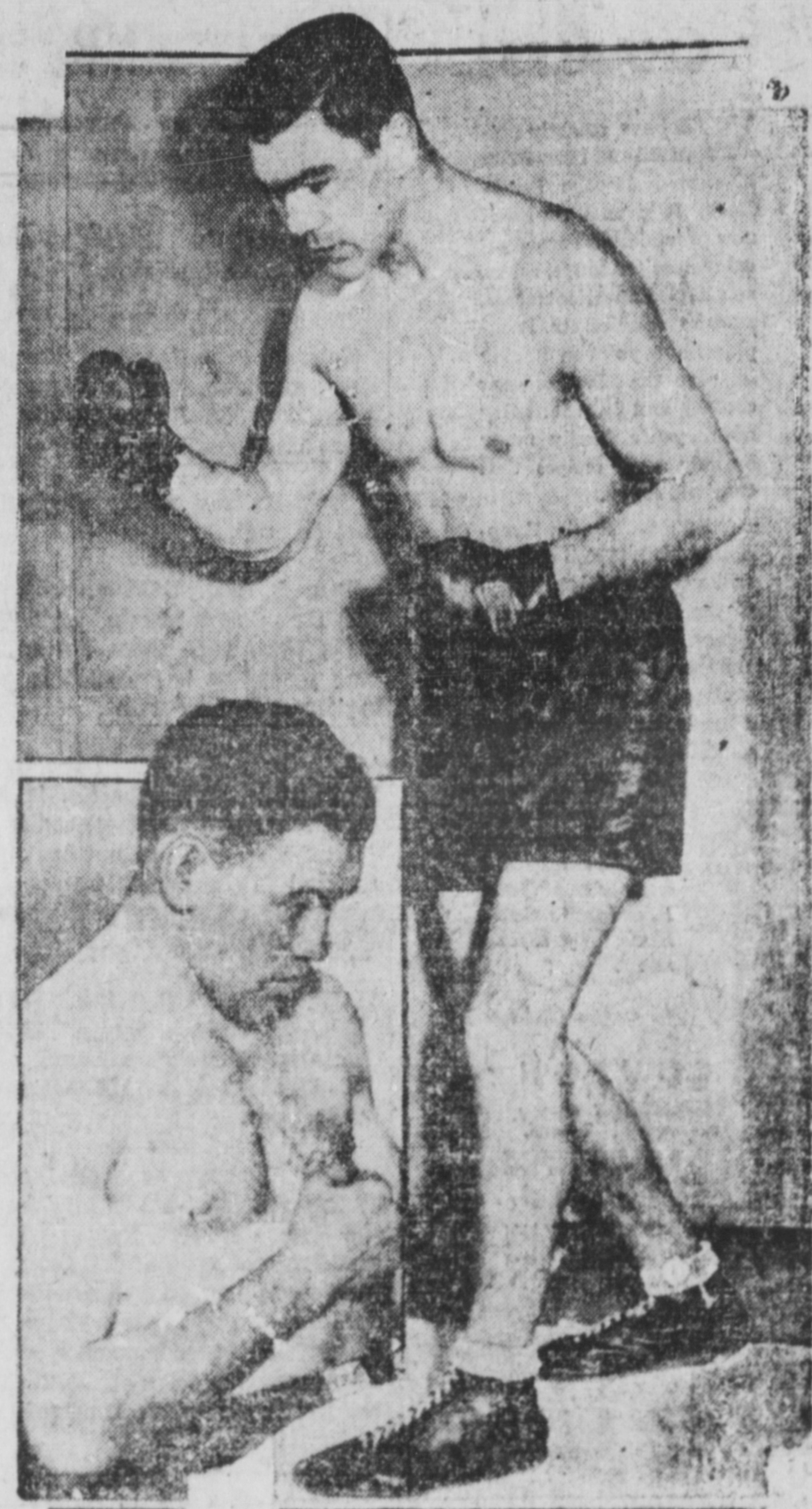
Max Schmeling, German heavy weight champion, in two poses.