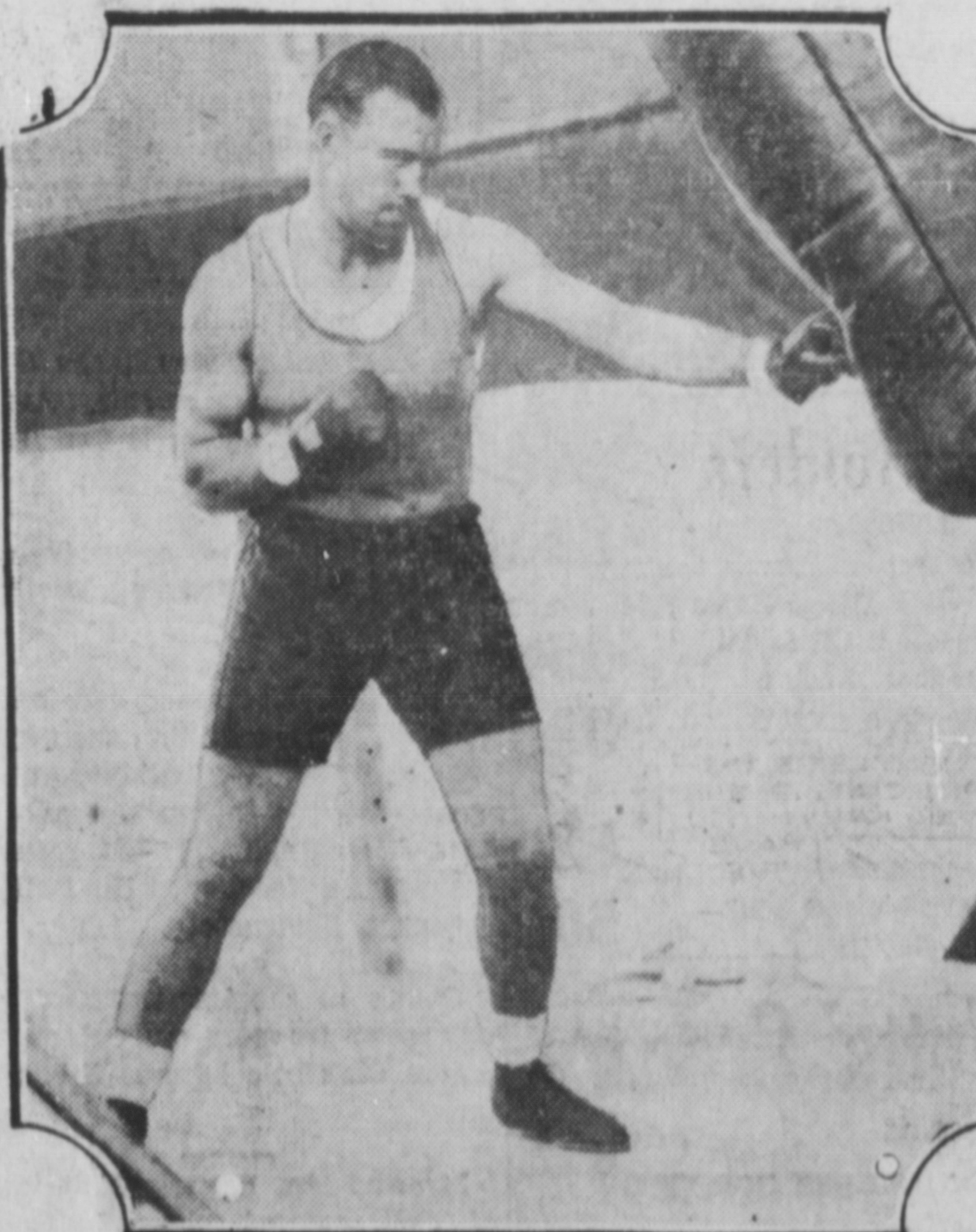
Jack Sharkey, who will meet Max Schmeling in 15 rounds in June.