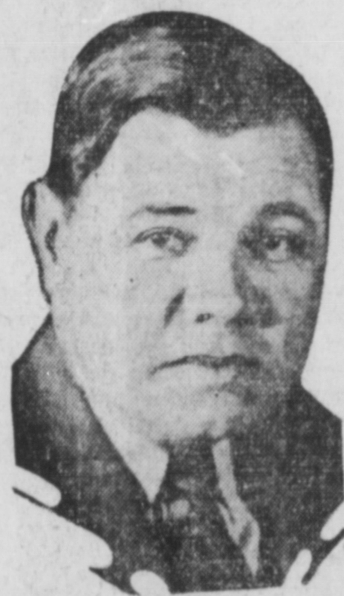
Babe Ruth demanding $80,000 salary from New York Yankees this year.