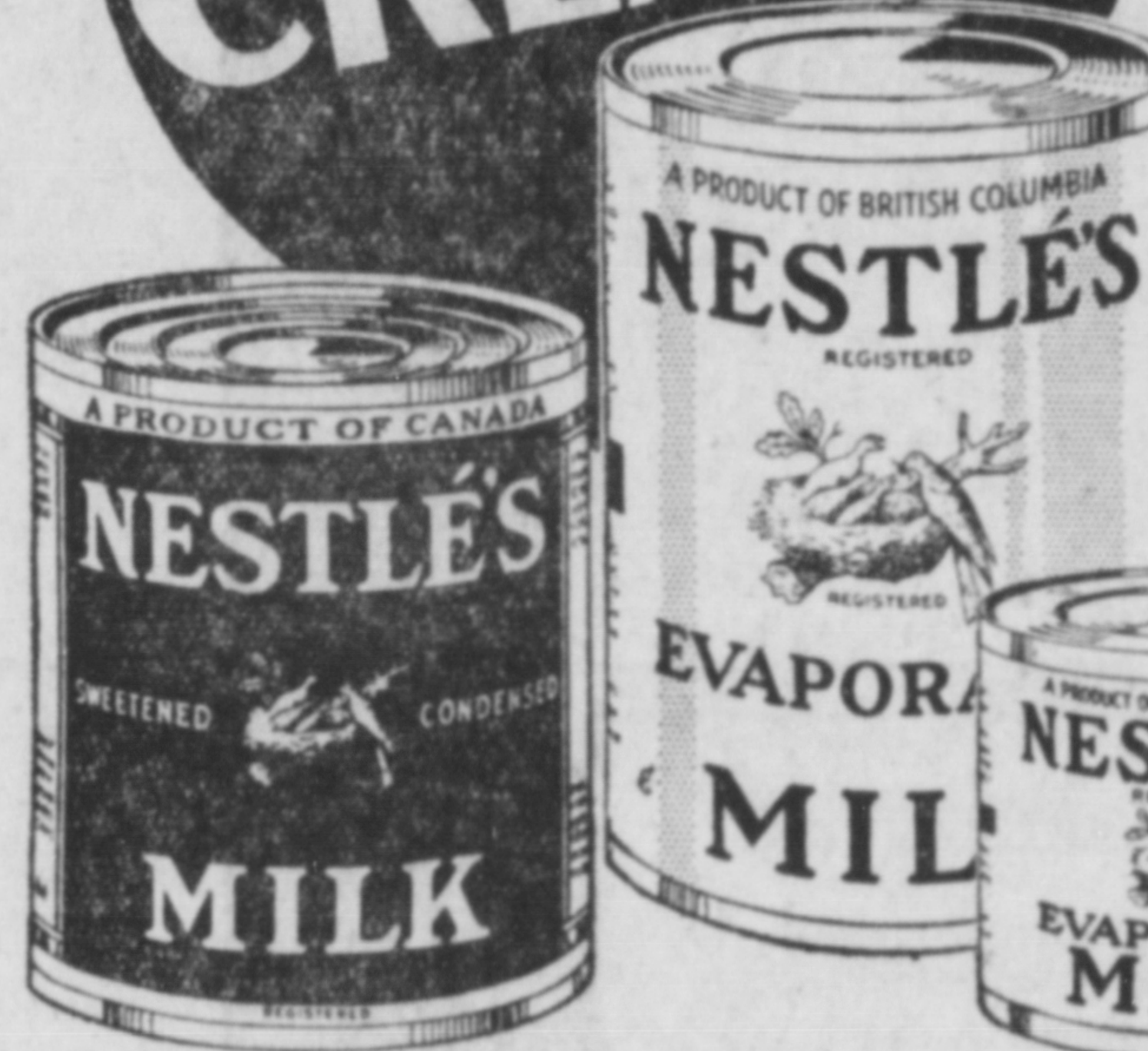
CONDENSED Sweetened Condensed Milk has the Blue Label Unsweetened Evaporated Milk has the White Label

Nestlé's—World's Largest Producers and Sellers of Condensed and Evaporated Milk