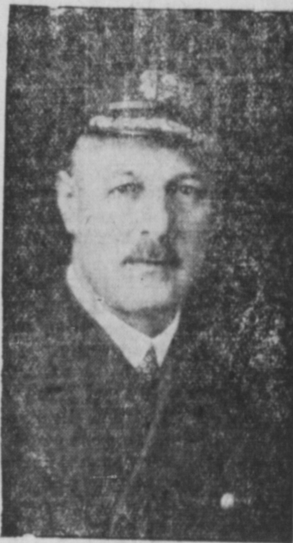
To command ss. Prince Robert.