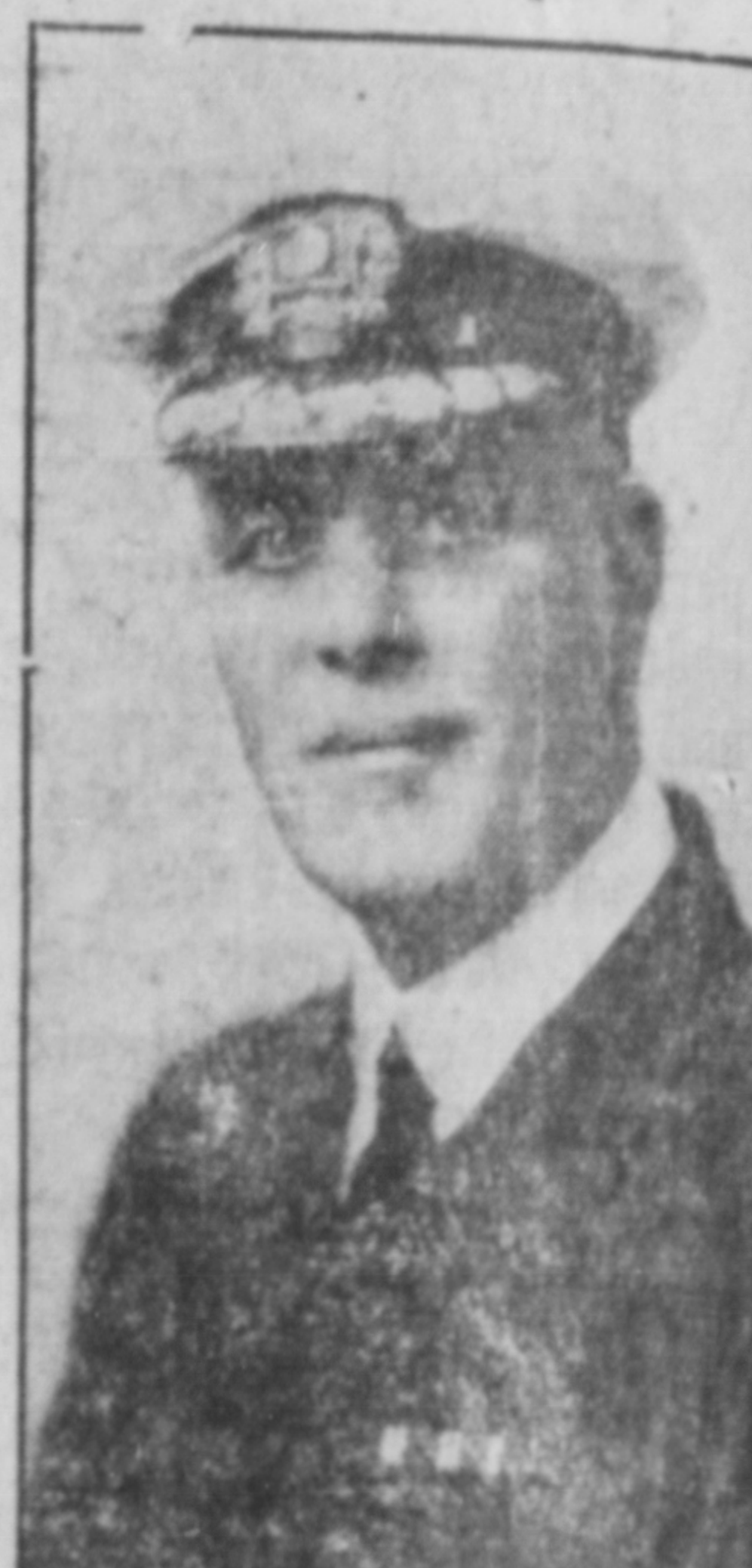
Master of ss. Prince Rupert.