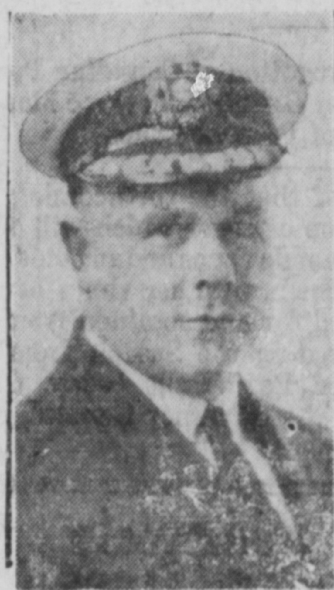
Appointed to ss. Prince George.