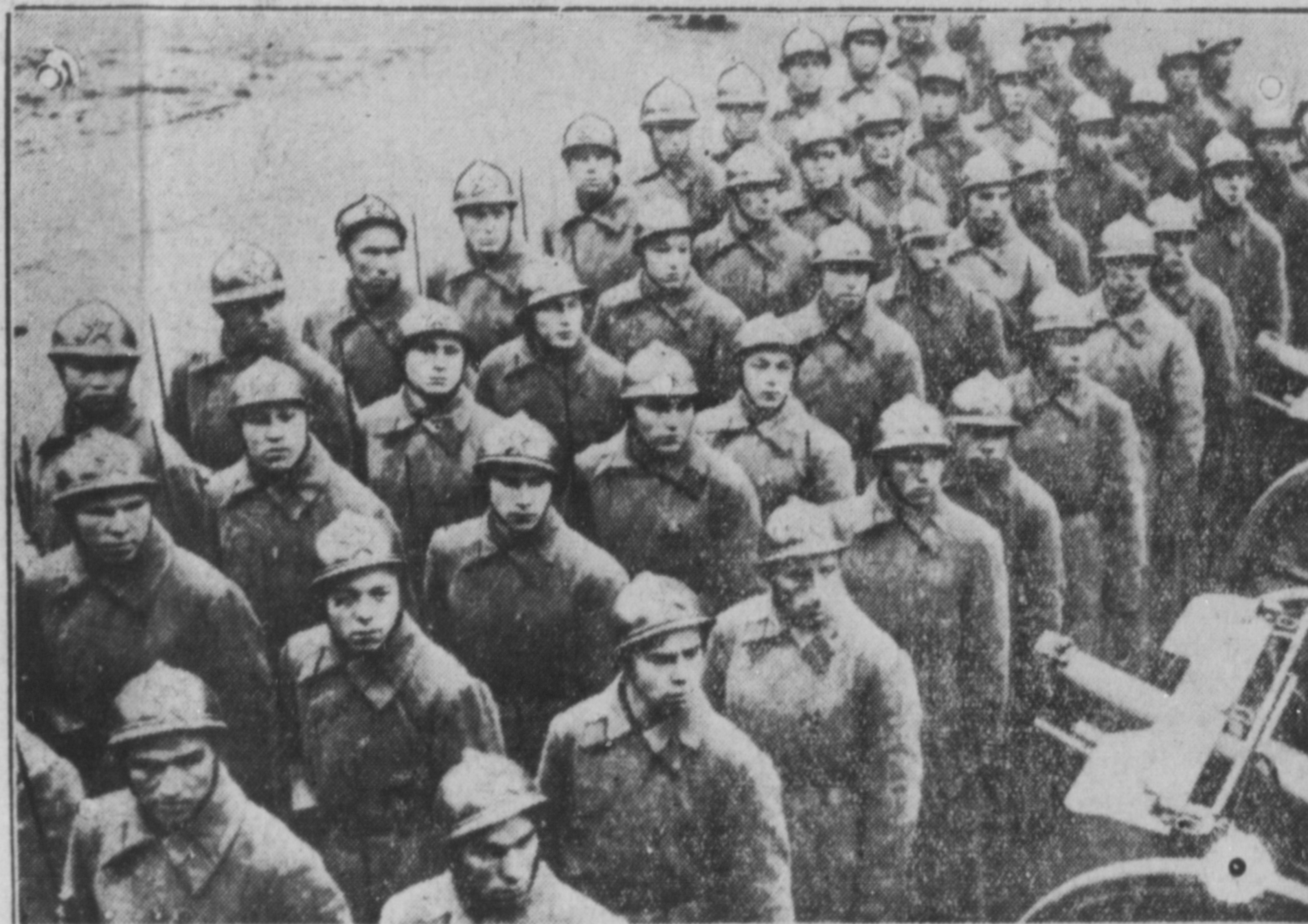
With a cheer for Lenin and a curse for Trotsky these Soviet troops, resplendent in their new steel helmets and tunics, passed in review before high military leaders at Moscow, recently.