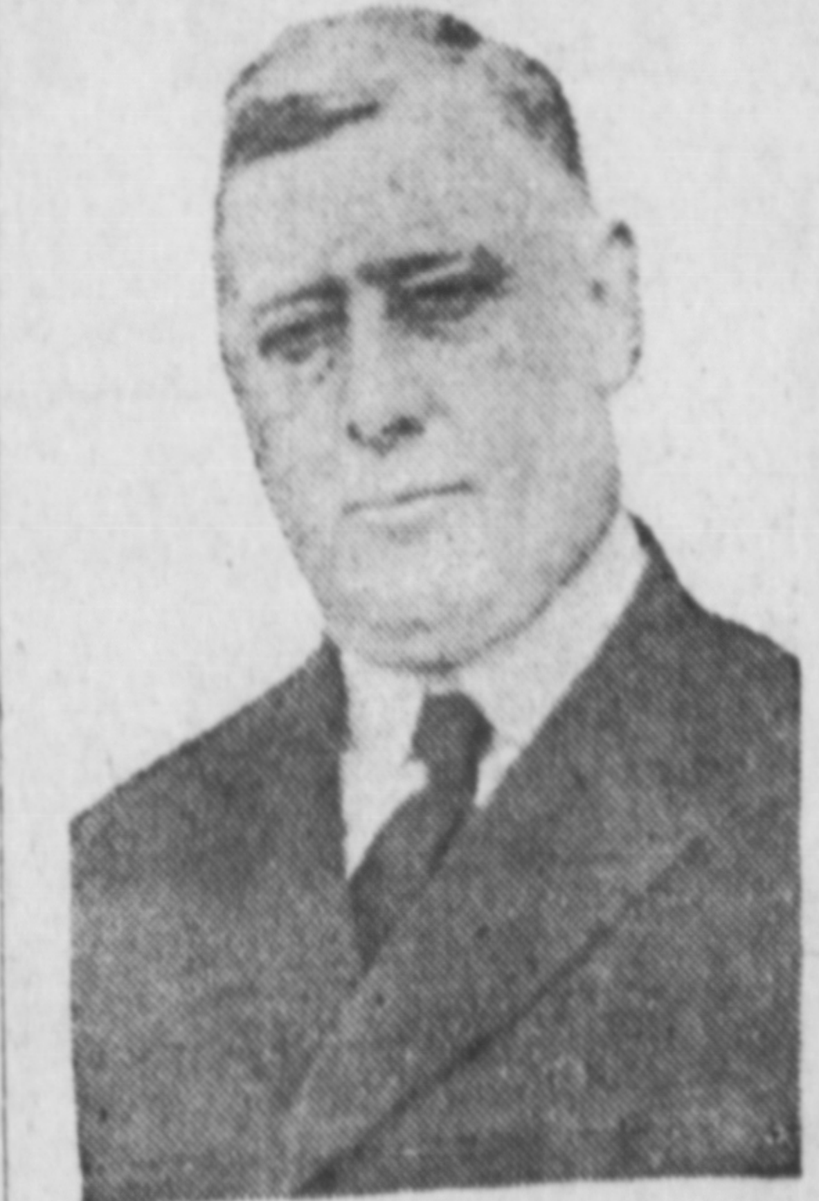
Hon. C. C. Ballantyne, one time minister of marine and fisheries.