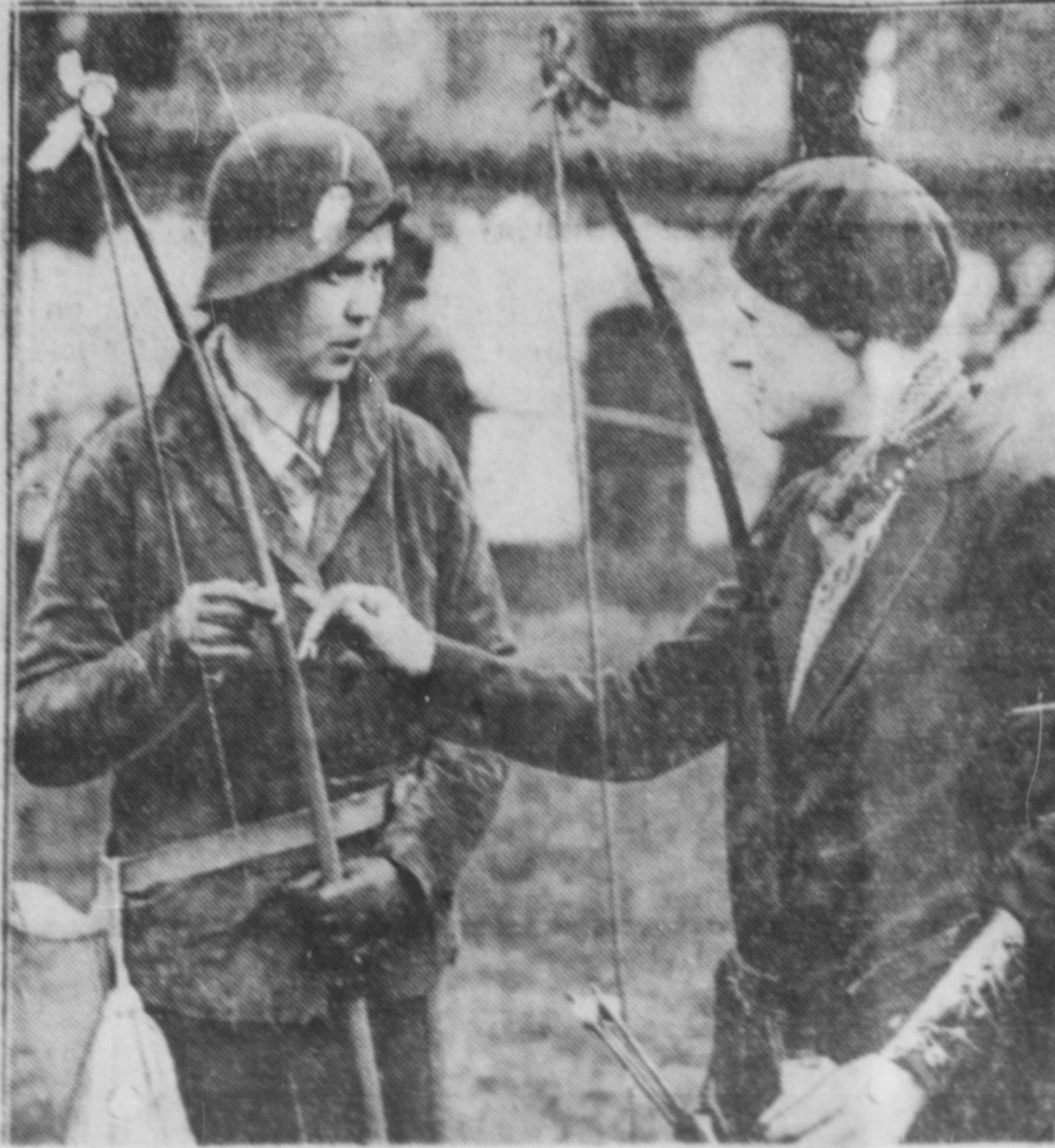
Toxophilites—that's highbrow for archers—and here we have a couple of them preparing for the cup matches at the Royal Toxophilite Society's grounds at London, England. There is a large entry this year and contest will be keen.