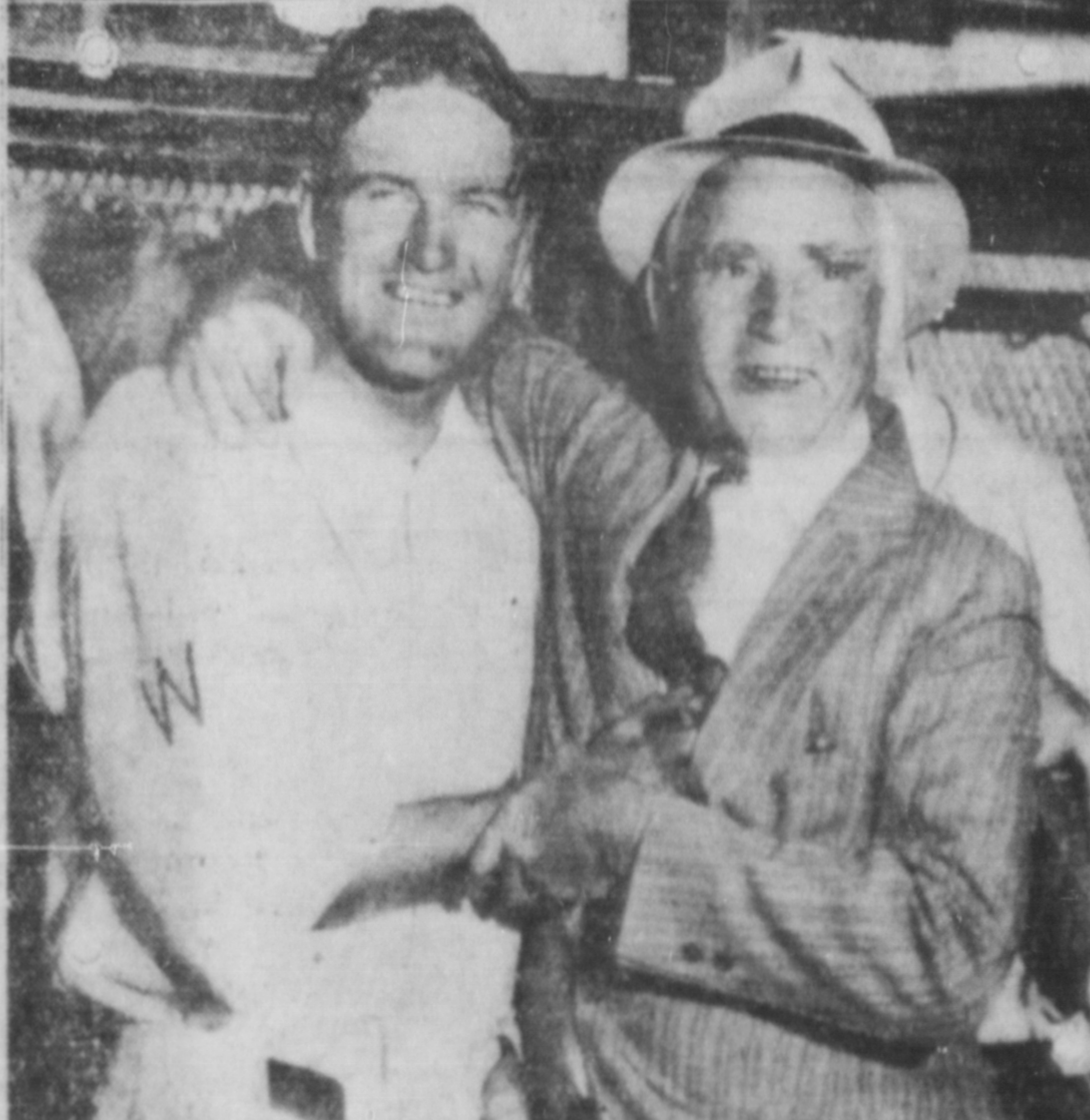
Joe Cronin, youthful playing manager of the Washington Senators, is congratulated by Clark Griffith, owner of the club, after the Senators clinched the American League pennant and earned the right to meet the New York Giants, National League flag winners, in the annual World's Series.