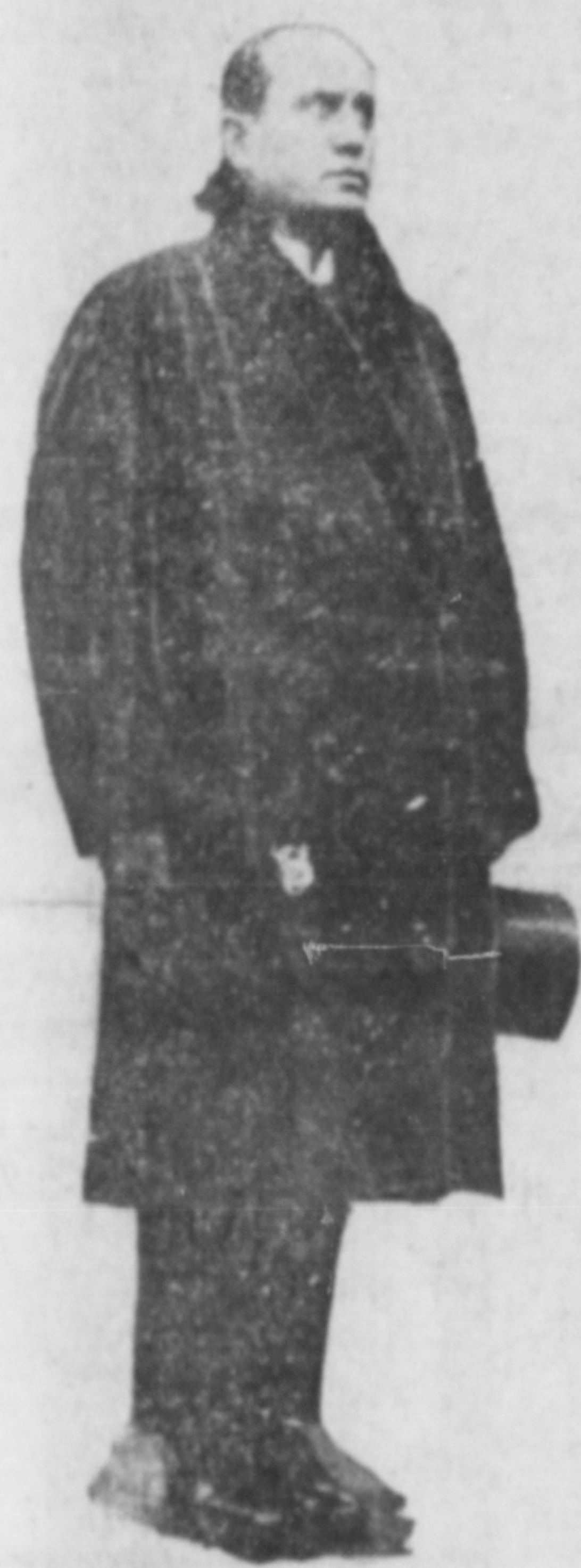
Whose ten-year peace plan for Europe has been adopted by four European nations.

Principal Points Are Announced—United States Stand Alone But Would Not Hinder Any Settlements or Interfere With Plans For Disarmament