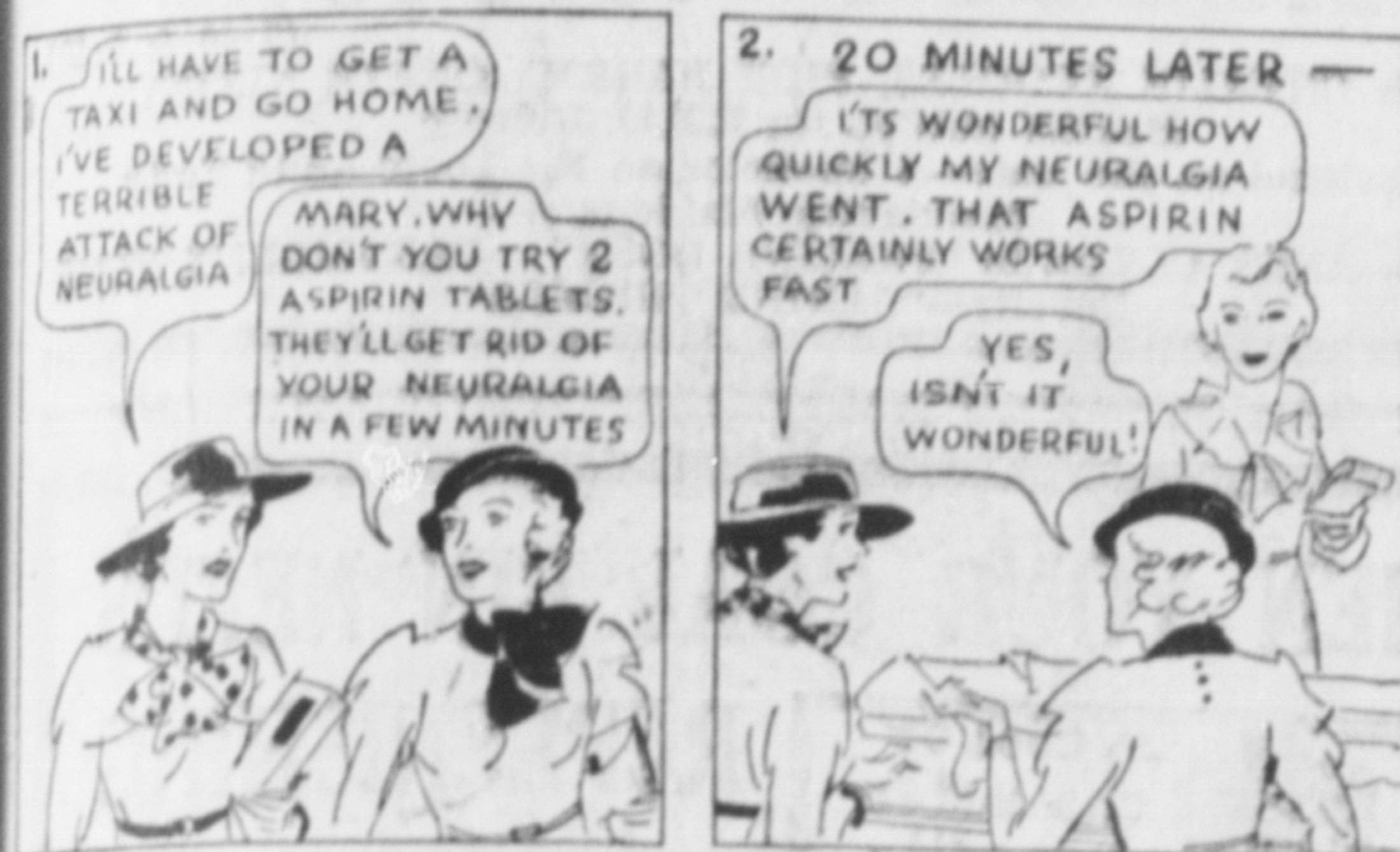
For Quick Relief Say ASPIRIN When You Buy

Now comes amazingly quick relief from headaches, rheumatism, neuralgia, neuralgia... the fastest safe relief, it is said, yet discovered. These results are due to a scientific discovery by which an Aspirin Tablet begins to dissolve, or disintegrate, in the amazing space of two seconds after touching moisture, and hence to start "taking hold" of pain a few minutes after taking. The illustration of the glass, here, tells the story. An Aspirin Tablet starts to disintegrate almost instantly as you swallow it. And thus is ready to work almost instantly. When you buy, though, be on guard against substitutes. To be sure you get ASPIRIN'S quick relief, be sure the name Bayer is in the form of a cross is on every tablet of Aspirin.