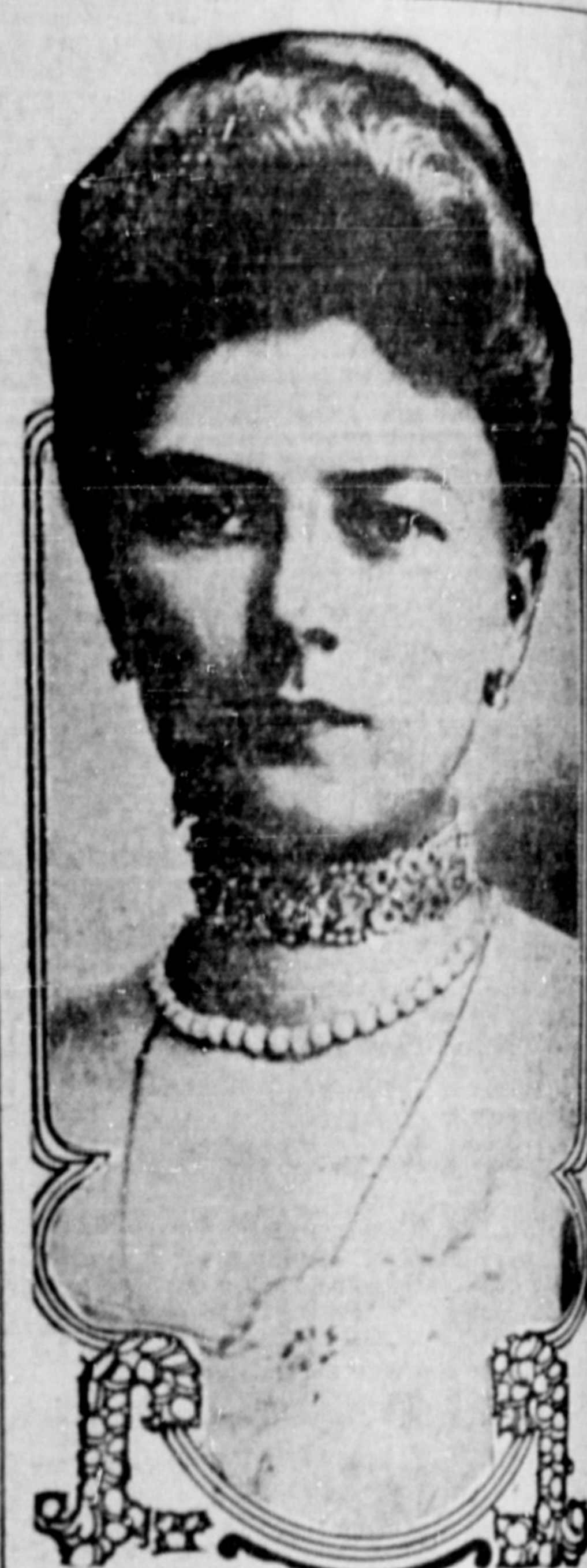
THE DUCHESS OF HOHENBURG

London, July 7.—The uncertain health of Francis Joseph the aged Emperor of Austria, has raised discussion on the status of the Duchess of Hohenburg, the beautiful and accomplished wife of the Archduke Francis Ferdinand, heir to the Austrian throne.