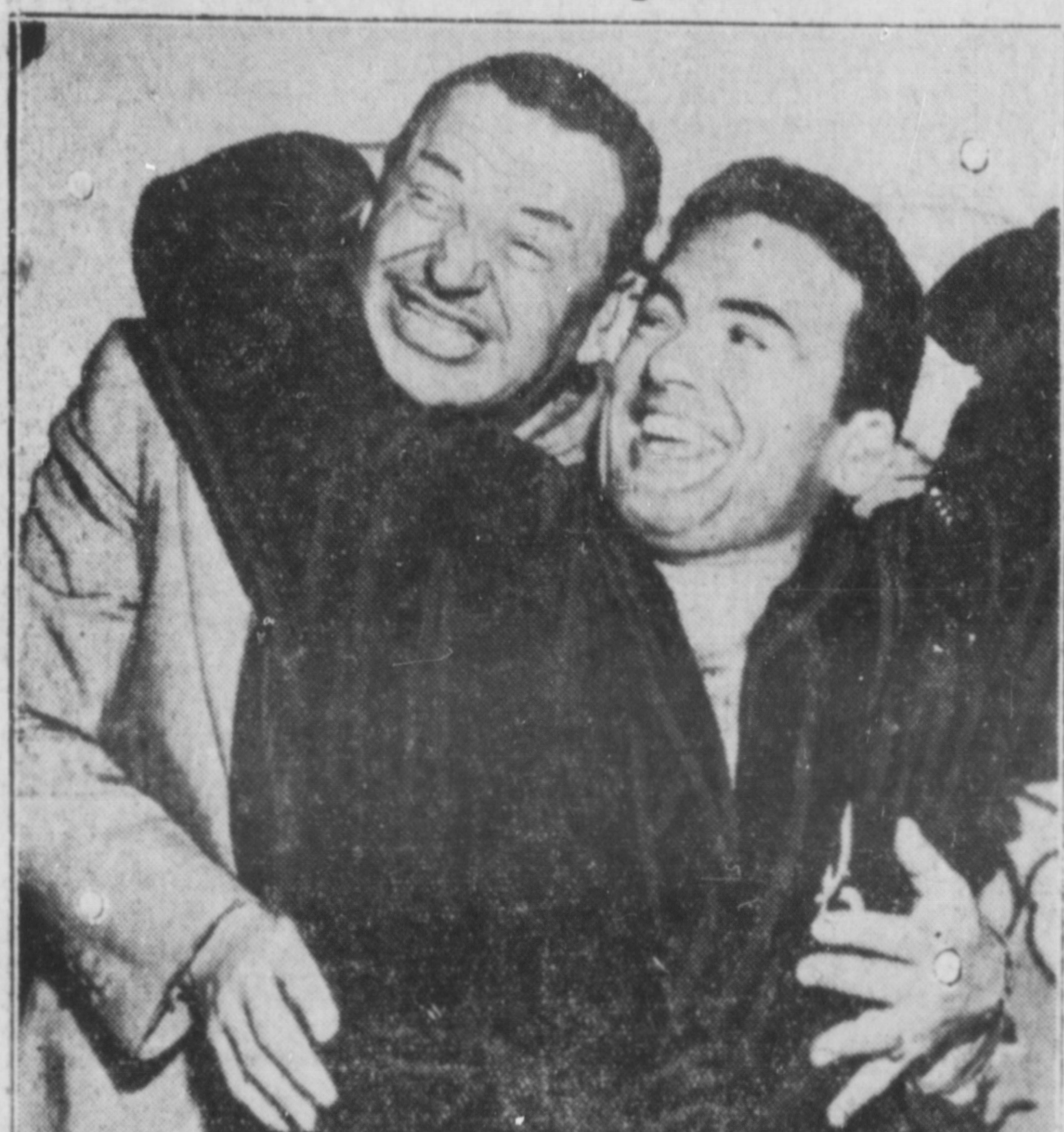
With all the artistry of an experienced wrestler, Wallace Beery assumes a pained expression as Jim Londos, demonstrates headlock.