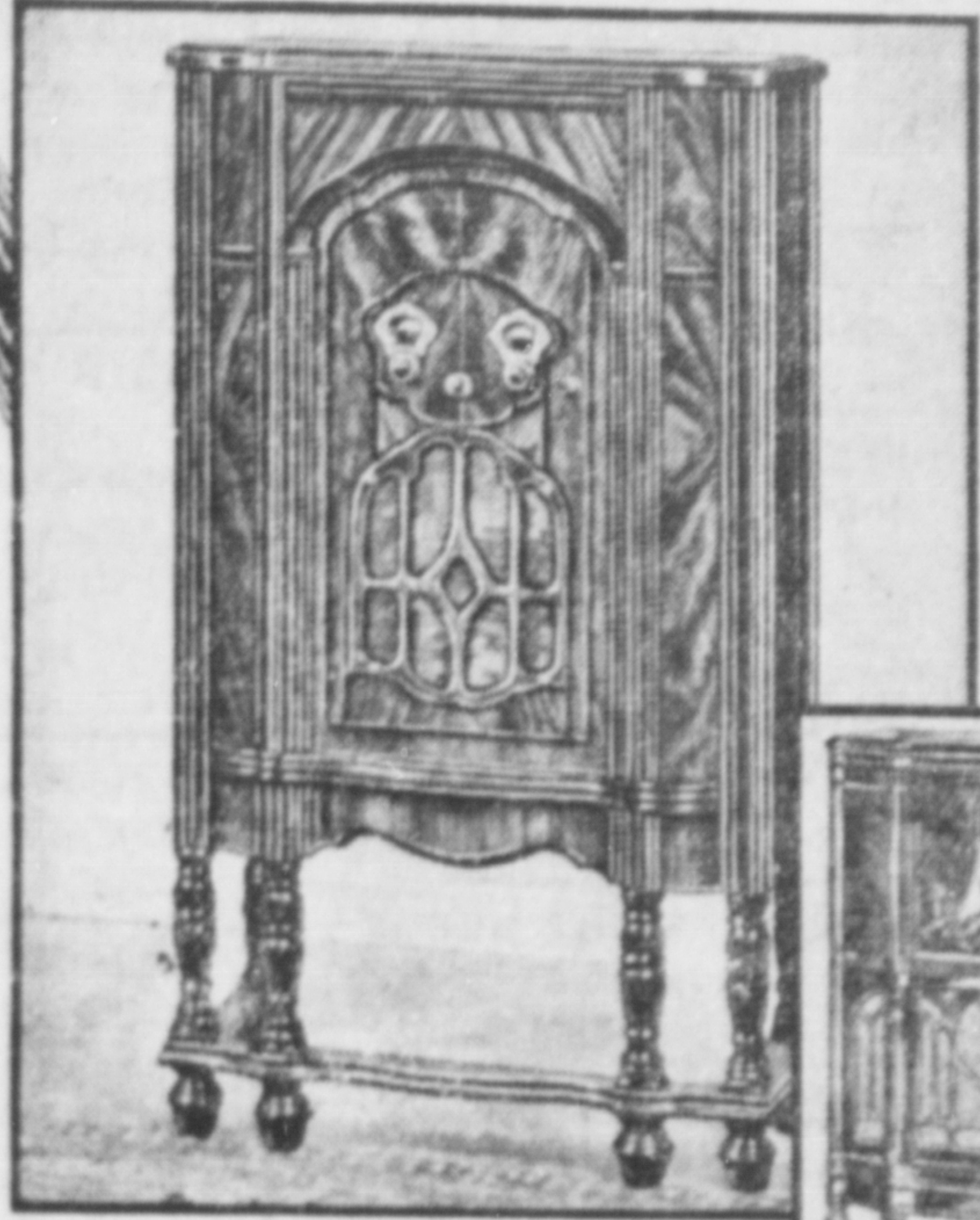
Victor Radio R-31 $79.50, with 5 tubes

"I'd set a high standard and a low price for my radio. I had to have selectivity ... sensitivity and real tone. It met all these demands plus an extended range to pick up police calls. However, to go back to tone quality—the salesman showed me one big reason why everything sounded so full and