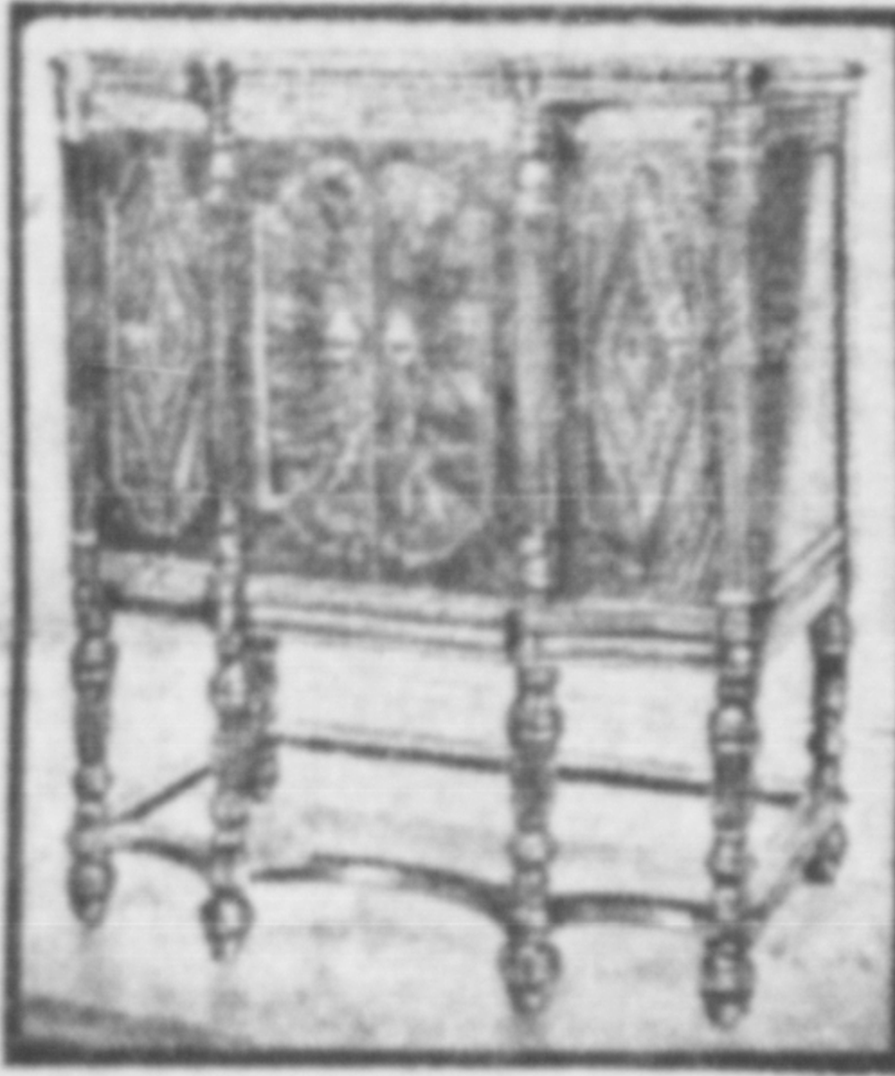
Victor Automatic Duo (Radio-Records) $245, with tubes