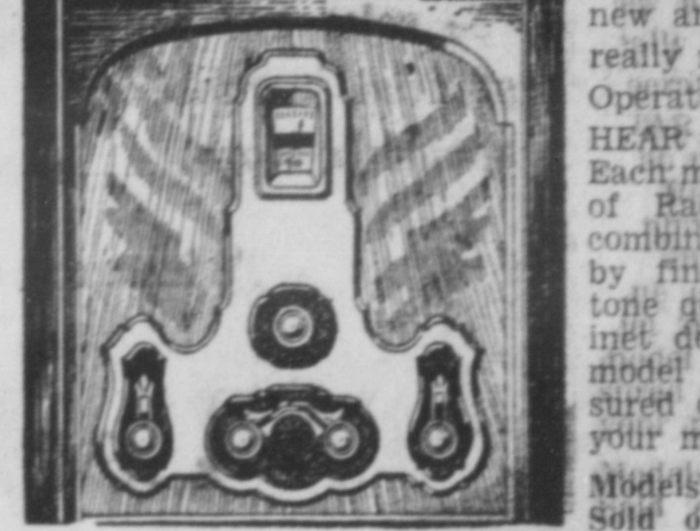
The 280 $199.00 Easy Terms

Tona-lite Control is so utterly new and fascinating that you really must see it for yourself. Operate the controls. SEE and HEAR this marvelous advanced. Each model in Victor's new line of Radios and Radio-record combinations is characterized by finer performance, better tone quality and lovelier cabinet design. No matter which model you choose you are assured of the utmost value for your money. Models from $19.50 to $245.00. Sold on Easy Payment Plan.