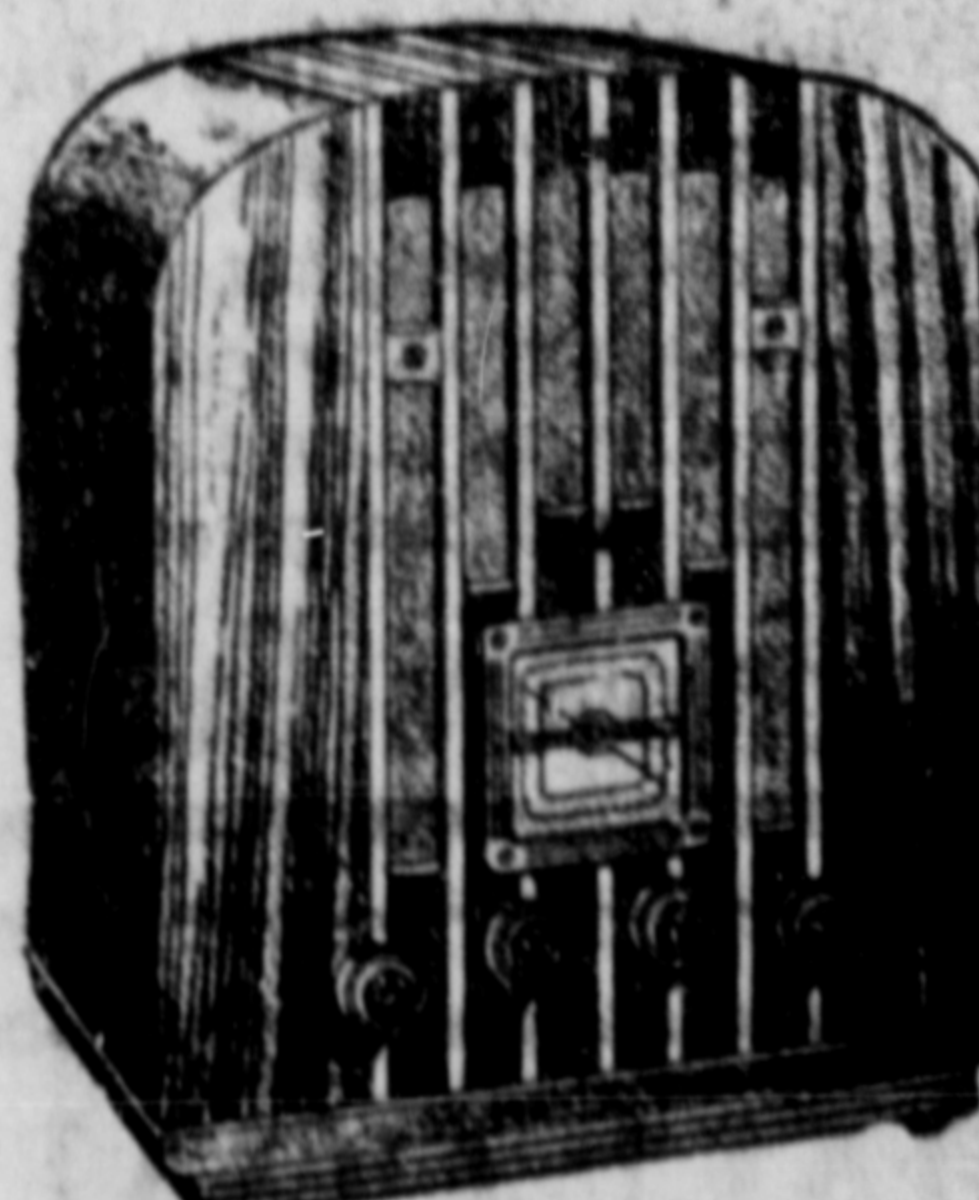
Model M-51 $65.50