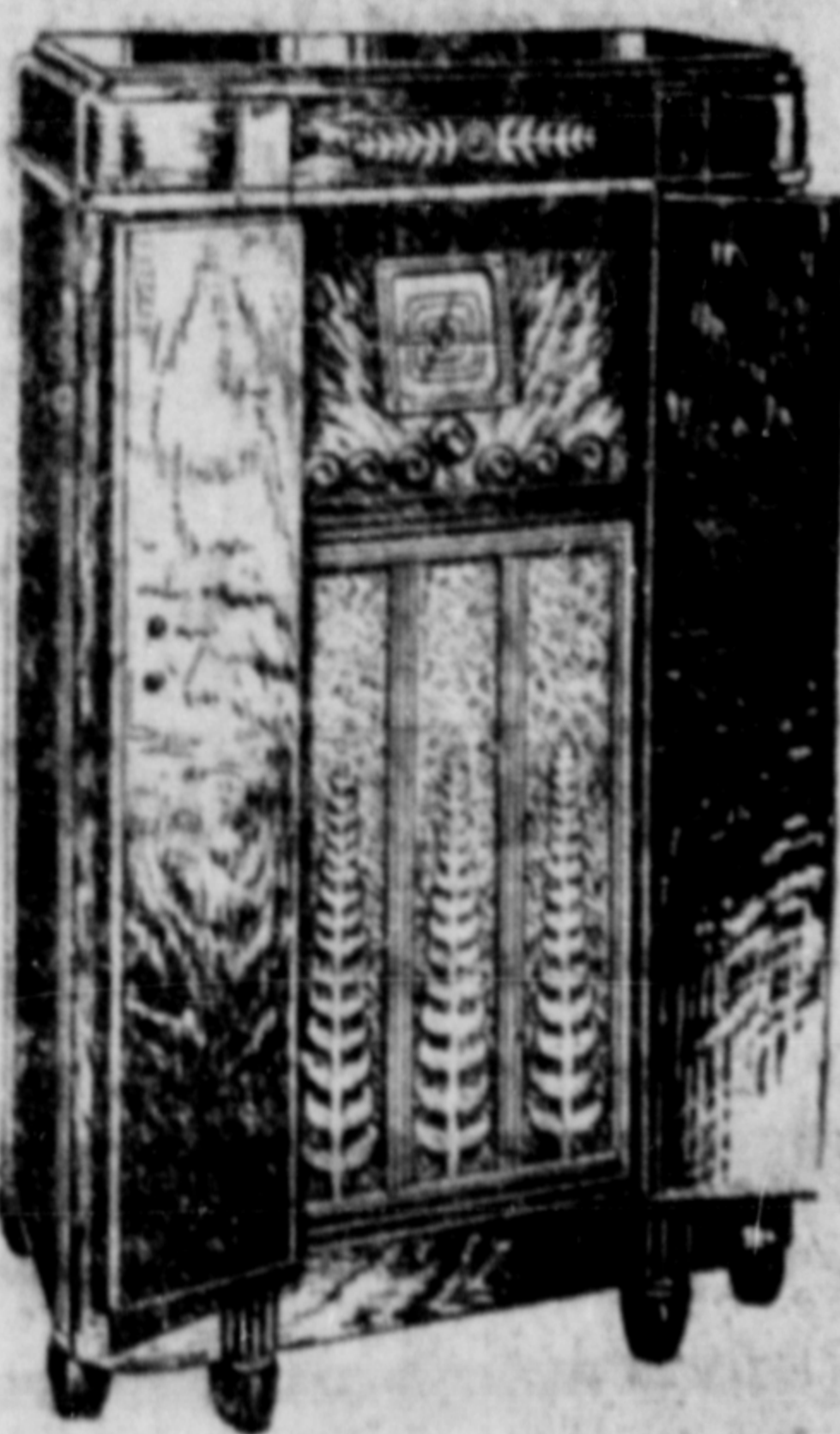
The Waveruler Model M-125 $255.00