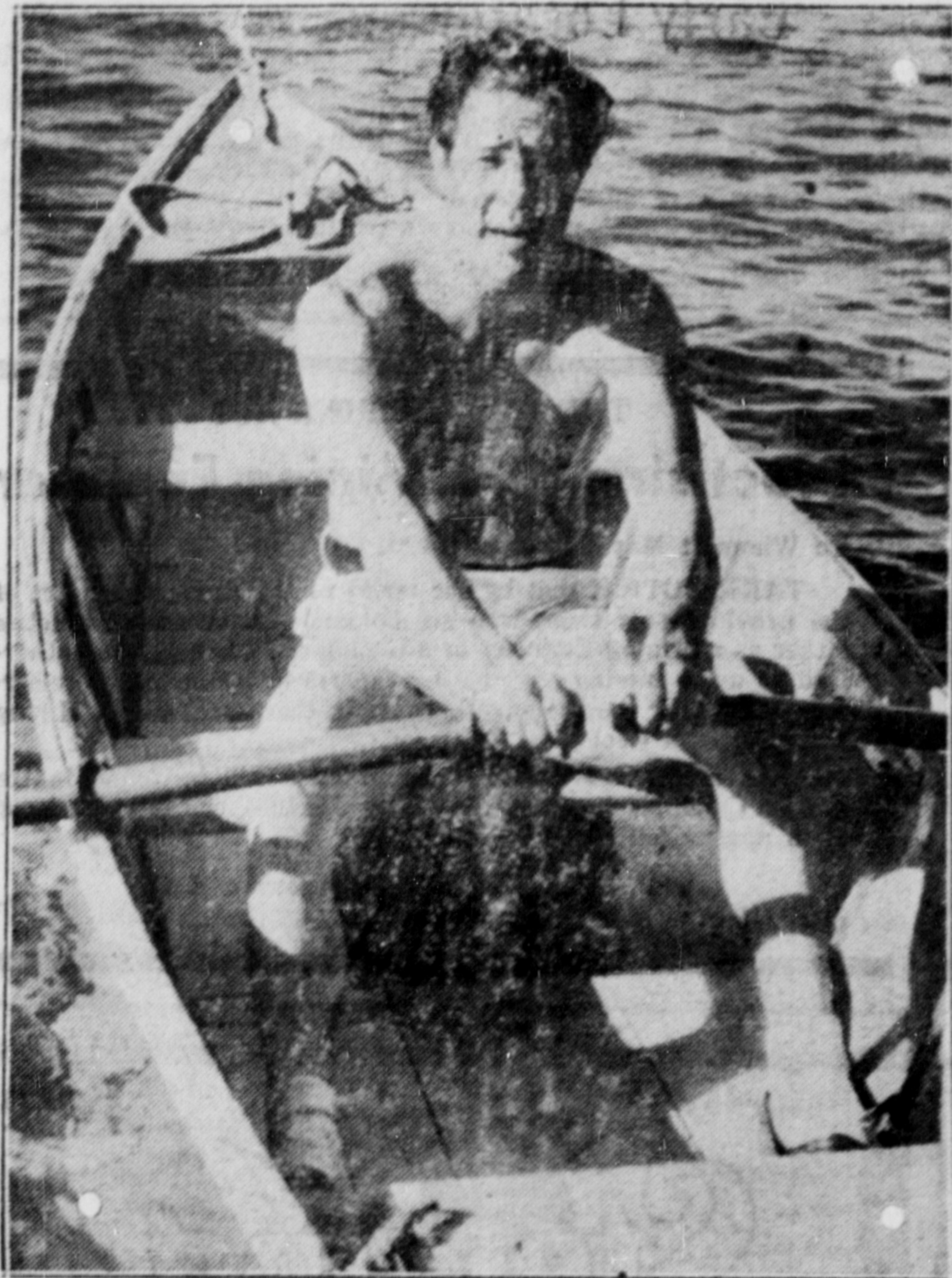
Max Baer, getting into his preliminary training for the coming bout with Carnera, photographed doing a little rowing on Lake Tahoe, Calif. He plans to come east for the more serious part of his training before the big battle, June 14.