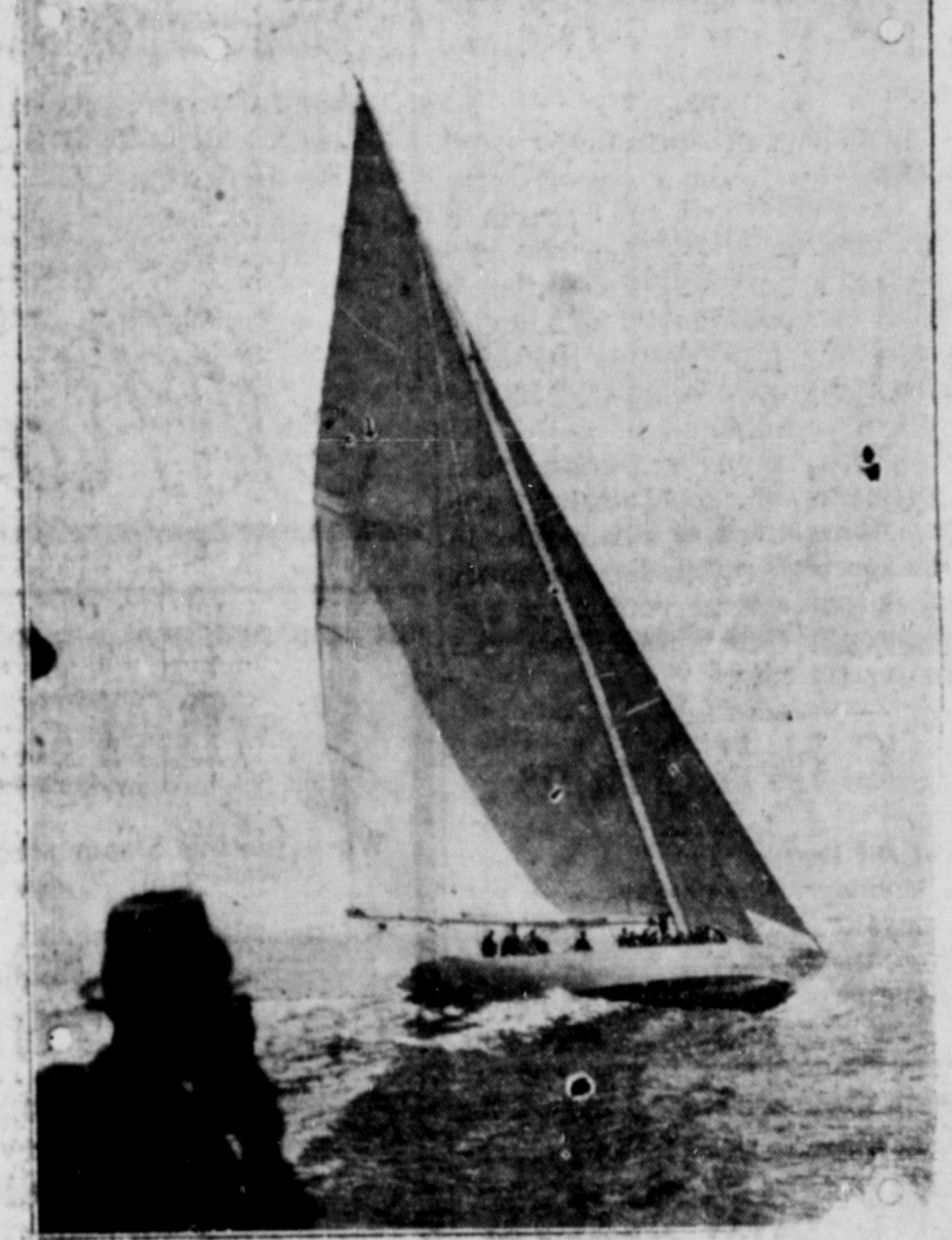
The prospective America's Cup defender "Rainbow," photographed from a motorboat as she made fair speed before a brisk wind in Narragansett Bay, after having been placed under sail for the first time. Rainbow was skippered by Harold Vanderbilt; the yachtsman who heads the syndicate that constructed the craft for possible competition against the British-built "Endeavour".