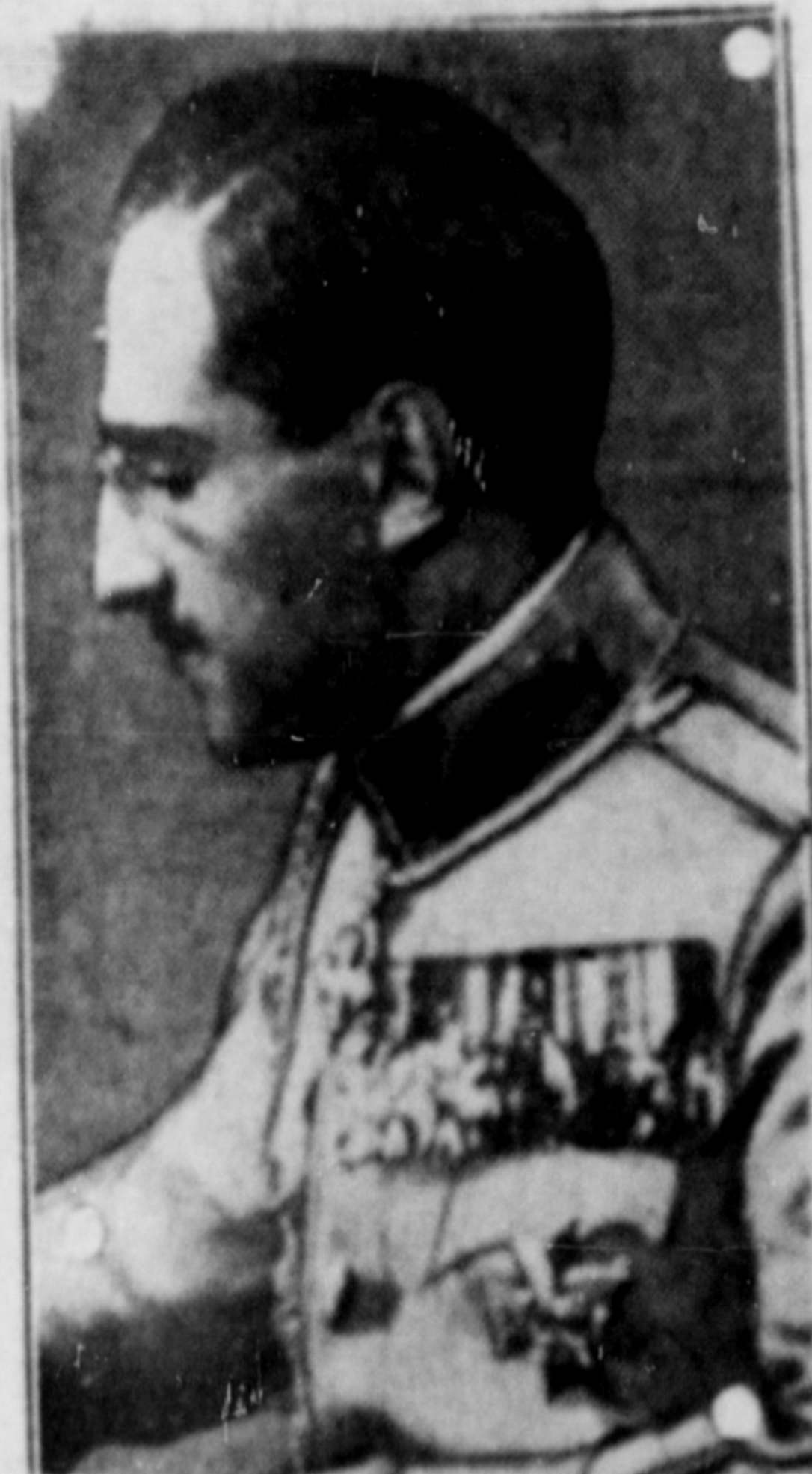
Slain Jugo-Slav Monarch

Some political observers do not believe the circumstances of yesterday's unfortunate incident to have been of such a nature to lead to serious international complications although civil strife may ensue in Jugo-Slavia. It is pointed out that, after all, the dead king, the object of many previous assassination attempts in his own country, was the victim of his own countryman. Barthou's slaying was, undoubtedly, not the prime intention of the assassin, a young Jugo-Slav terrorist, but was incidental to the planned killing of the king.