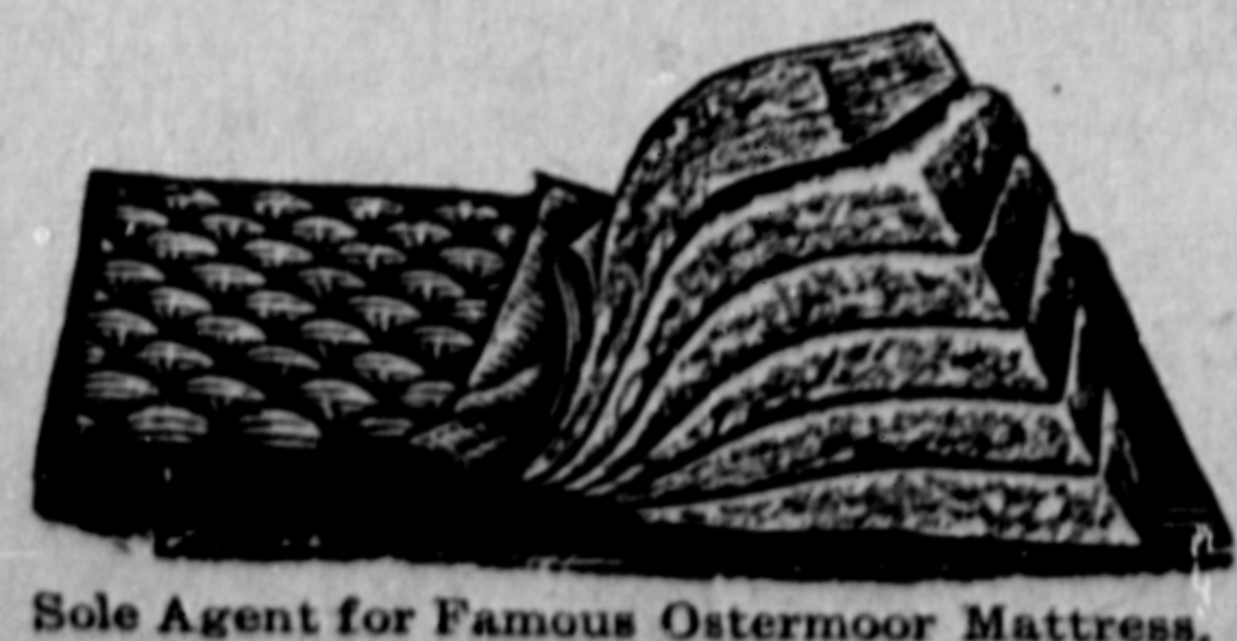
Sole Agent for Famous Ostermoor Mattress.

Building will be remodelled and we must increase our Stock. We have new and cheap Carpet, Linoleums, Crockery, Couches, Glassware, Table Cutlery, Baby Carriages, etc., etc.